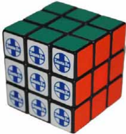
Haven't had your Rubik's Cube out since 1982? This promotional version from the Santa Fe went for $10.