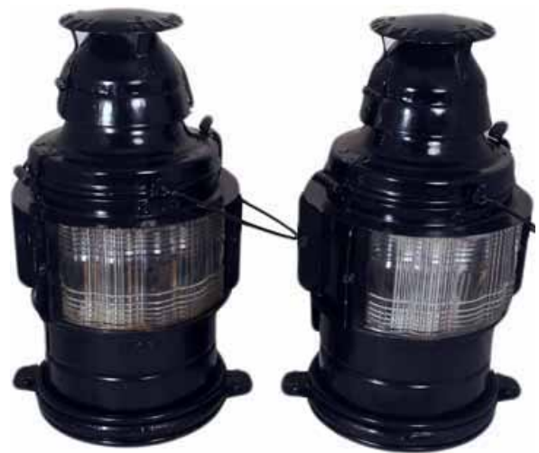
This set of Rio Grande class lamps came from the estate of a former employee and brought a high bid of $7827.