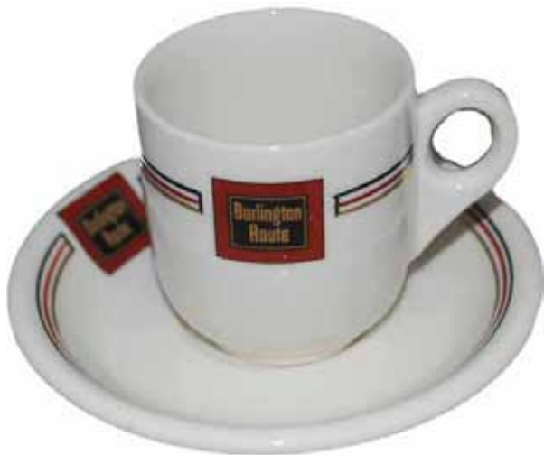
A near-mint Burlington Route demitasse cup & saucer set made in 1947 by Syracuse China brought $2350.