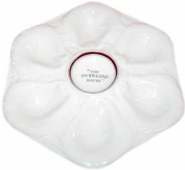
A high bid of $2750 was required to take home this Union Pacific Overland oyster plate by John Maddocks & Sons.