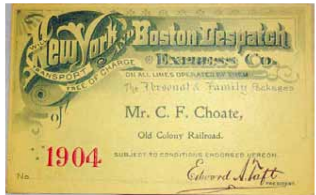
An unusual New York & Boston Despatch Express Company "pass" sold for a reasonable $75.