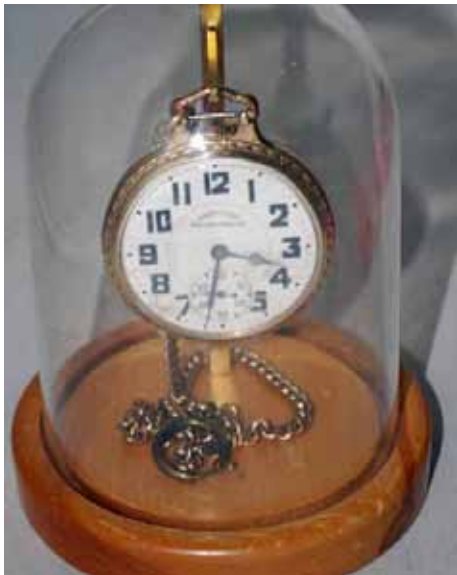
A high bid of $310 took home this Hamilton Railway Special 21-jewel gold pocket watch, with chain & display case.