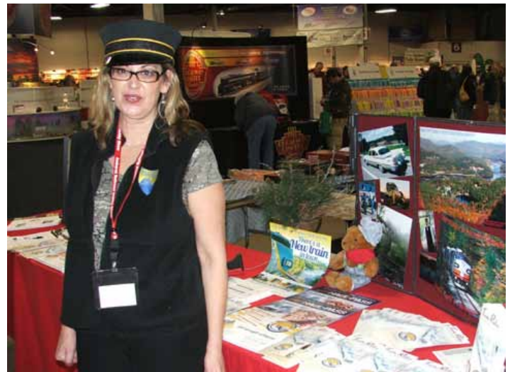
The Saratoga & North Creek Railroad was one of over sixty new exhibitors at this year's Railroad Hobby Show.

A Facebook Account is Not Needed to View our Albums Facebook Members: "Like" Us To Get KL&L Updates