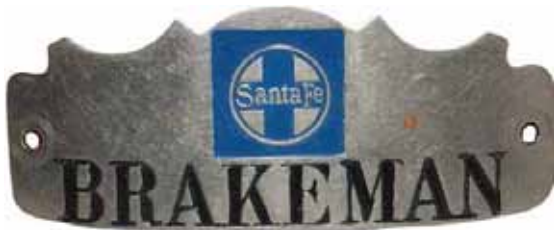
This Santa Fe "Brakeman" cap badge with a nice enameled logo sold for a high bid of $180.

The big item was the pair of Rio Grande classification lamps that brought a high bid of $7827, but a number of other lots also hit four figures. East coast collectors had several interesting things to bid on, with a BCF&NB key and a Mansfield & Framingham RR bond certificate among the many unusual examples. As always, there were also plenty of more common items, for collectors on a limited budget. A full online catalog with a prices realized list is available at www.railroadmemories.com .