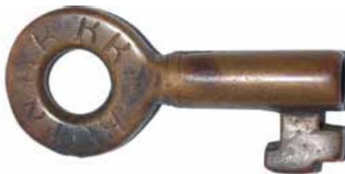
New England collectors bid this Boston, Clinton, Fitchburg & New Bedford Railroad key up to $172