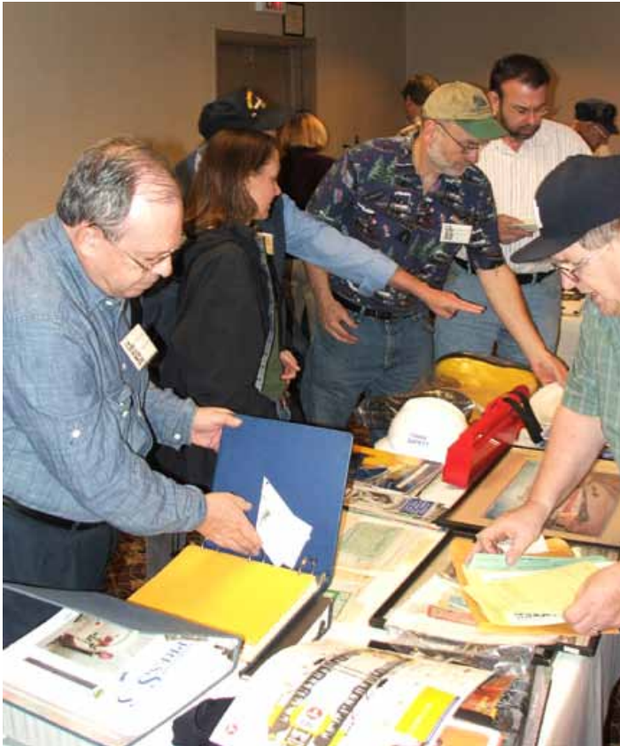
Railroadiana collectors inspect fund-raiser auction lots at the 2011 Key, Lock & Lantern Annual Convention.