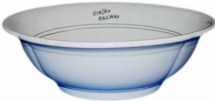
One of only two known examples, this large Uintah Railway wash basin bowl by Maine KT&W sold for $3300.