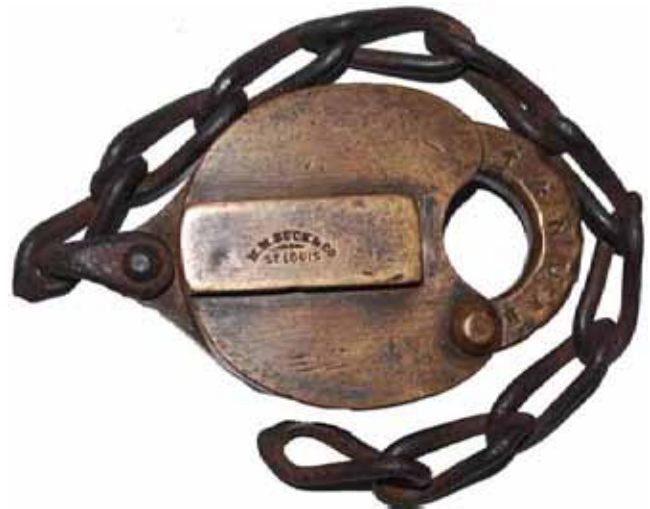
A $680 bid was needed to take home this Texas & New Orleans Railroad car lock made by M.M. Buck..