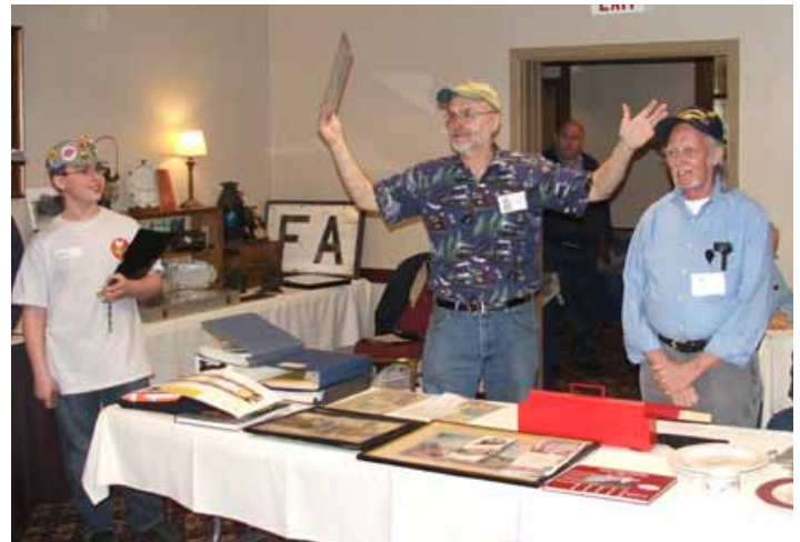
There are always some good deals at the fund-raiser auction, with all proceeds going to Key, Lock & Lantern.

The convention begins on May 4th, with an informal “meet & greet” session for pre-registered members, and the KL&L Board of Trustees meeting. On Saturday, May 5th, railroad history and memorabilia displays will be set up in the exhibit