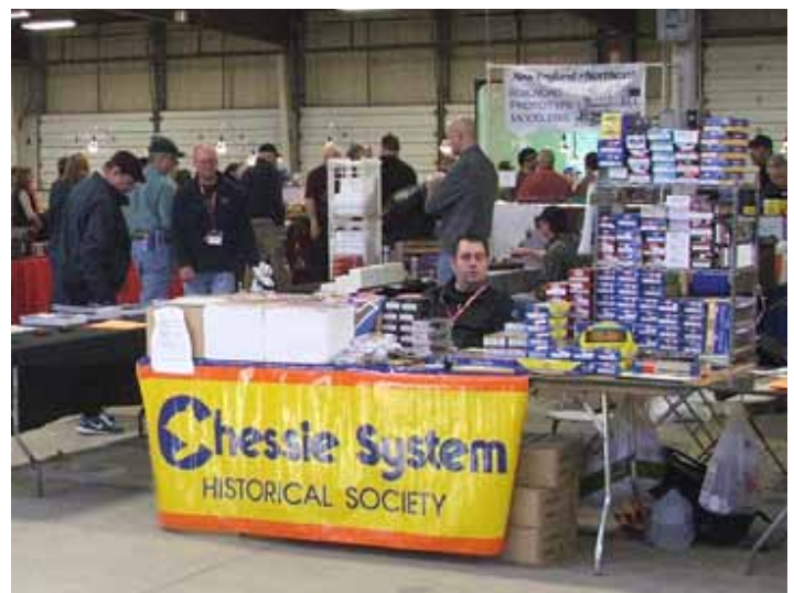
The Springfield show has always been a popular venue for railroad historical societies to recruit new members.