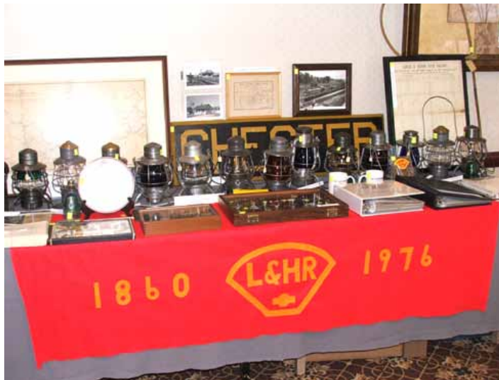
One of the many excellent displays of railroad memorabilia at the 2011 Key, Lock & Lantern Annual Convention.