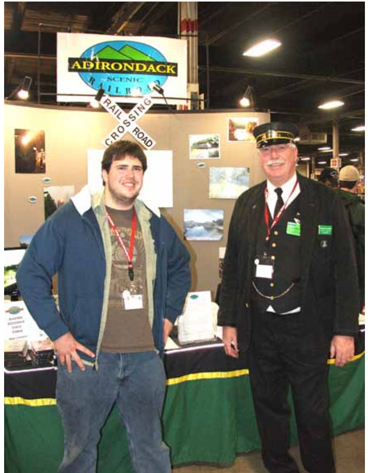
The Adirondack Scenic Railroad was among the dozens of tourist railroads and museums that set up displays.

With national model distributors and publishers displaying their products, this show has a more commercial atmosphere than most train meets. Scenic railroads and historical societies from throughout the northeast also set up booths, along with