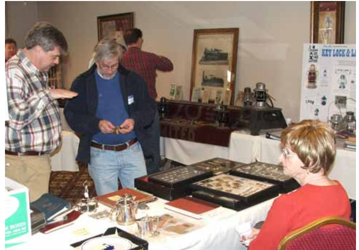
The KL&L Convention provides collectors with a forum to share their knowledge of railroad history & memorabilia.

This year, the 40th Annual Key, Lock & Lantern Convention will be held at the Comfort Inn in Glenmont, NY, over the weekend of May 4th, 5th & 6th. The name of the hotel has changed several times over the years, but the convention has