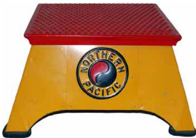
A high bid of $685 took home this nicely restored and painted Northern Pacific Monad logo step box.