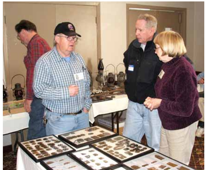
There is always plenty of time to visit with fellow collectors and discuss railroad history at the KL&L convention.

Full advance registration is open to current (2011-2012 membership year) Key, Lock & Lantern members. This year, a number of different registration packages are available to KL&L members: a full display table for $20, a half table