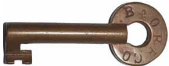
A long-barrel Baltimore & Ohio RR Co switch key by FS Hardware, with moderate wear, sold for $45.