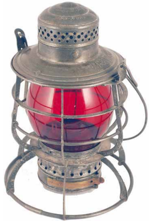
A bid of $220 took home this M&IRY Armspear lantern, with a red etched "M&IRY Safety Always" globe.