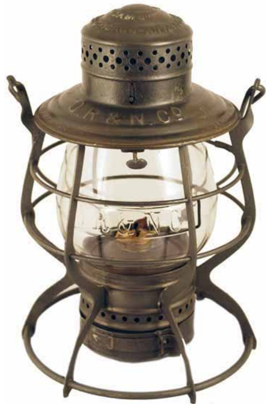
This Armspear Oregon Railway & Navigation Company lantern with clear cast globe brought a high bid of $1595.