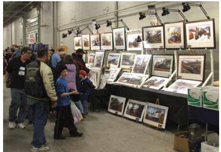
From models to photos & artwork, there was something for every railroad enthusiast at the Springfield show.

With huge model layouts, hundreds of vendors, historical groups, and live music (railroad songs, of course), this year's show will be a tough act to follow. Those who attended are no doubt already looking forward to next year.