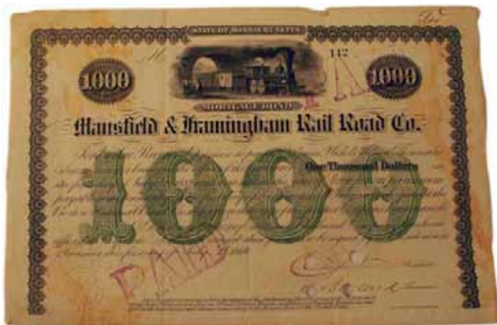
A Mansfield & Framingham Railroad bond certificate with a nice early steam locomotive vignette sold for $50.

Send in Railroadiana Auction & Show Reports for Publication in