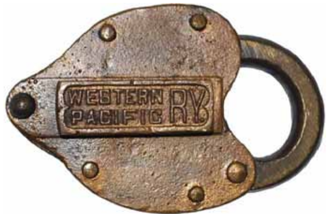
This Western Pacific Railway brass heart lock with the name cast on both sides went to the high bidder for $1650.