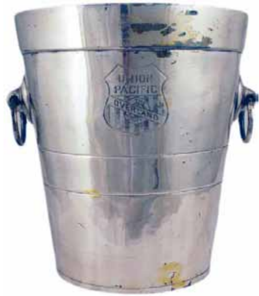
Despite several areas of silver plate loss, this Union Pacific Overland Route champagne bucket still brought $1295.