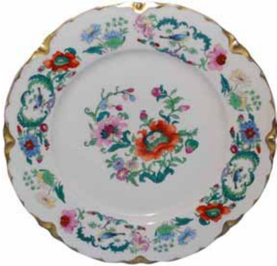
A Terrace Gardens dinner plate by Fraunfelter China marked "Great Northern Railway Co." sold for $740