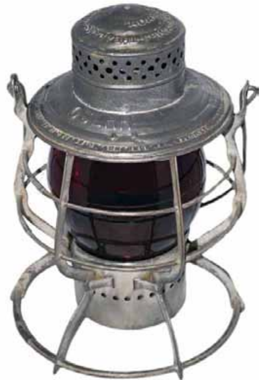
A high bid of $1000 took home this Oregon Short Line "Adams" model lantern with a red cast "OSL" globe.

Some of the higher end items included a Denver & Rio Grande Railway six-lever car lock, which brought $3300, and an MM Buck bellbottom lantern from the same line that went for $2750. Some interesting china in the sale included a Great Northern Terrace Gardens dinner plate, which sold for $740, and a D&RG Curecanti pattern butter pat for $650. A good selection of keys, lanterns, and other hardware was also offered. A full online catalog with a prices realized list is available at www.railroadmemories.com .