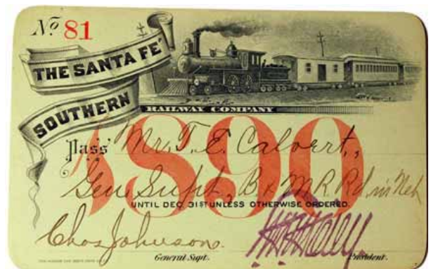
A Santa Fe Southern Railway annual pass with a nice steam locomotive vignette brought a top bid of $550.