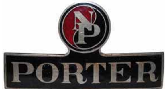
A scarce Northern Pacific Railroad "Porter" cap badge with a color monad logo sold for just over $300