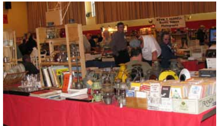
Many of the dealers at the Clark, NJ show offered a variety of authentic railroad memorabilia.

Most new collectors are introduced to railroadiana at train shows, so it is encouraging to see that the Clark, NJ show continues to offer a good selection of memorabilia. If this year's show is an indicator, we can look forward to the tradition continuing in the future.