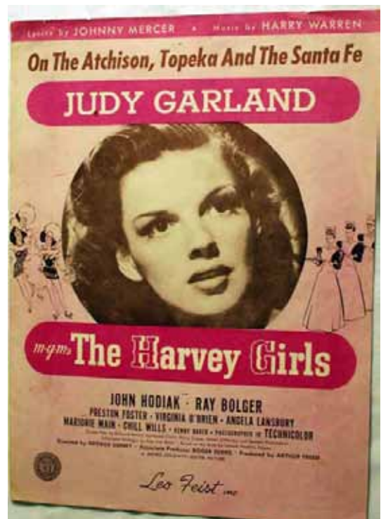
Sheet music from Judy Garland's Harvey Girls performance of "On the Atchison Topeka & the Santa Fe" sold for $35.