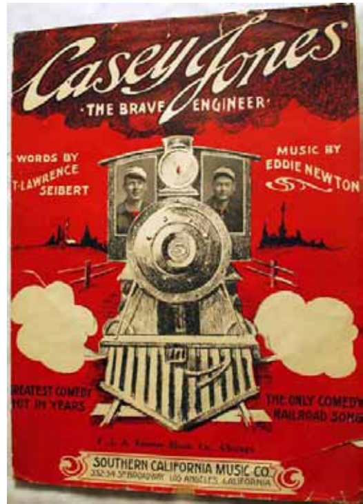
Sheet music for "Casey Jones" by T. Lawrence Seibert and Eddie Newton sold for a reasonable $10 bid.