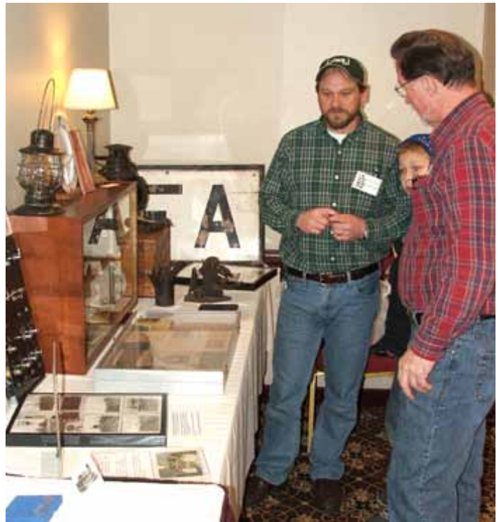
Railroad history buffs and collectors enjoy a display of memorabilia from the Delaware & Hudson Railroad at the 2011 Key, Lock & Lantern Annual Convention in Albany.

Unlike the big hobby shows, the KL&L convention is a smaller gathering where serious railroad historians are able to meet, share information, and trade memorabilia in a more relaxed atmosphere. A variety of activities that are open