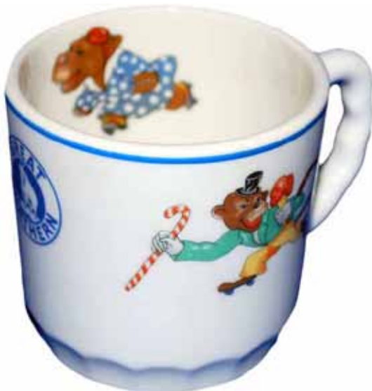
A nice side-marked Great Northern child's cup made by Syracuse China brought a high bid of $650.