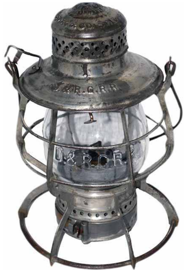
This Denver & Rio Grande RR lantern by MM Buck, with a nice clear cast globe brought a high bid of $2200.