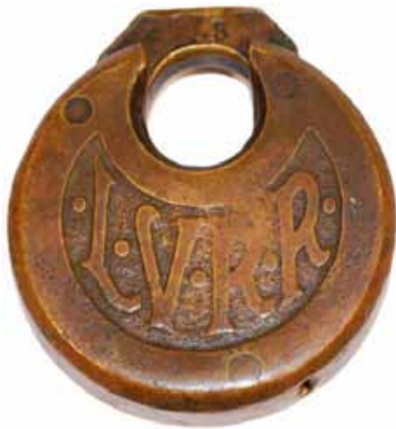
A brass six-lever lock from the Lehigh Valley Railroad, with some wear to the lettering, sold for $1210