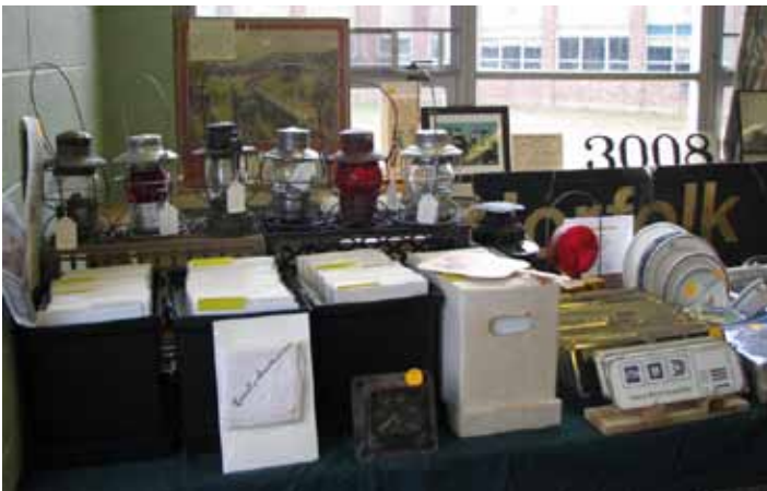
Some of the lanterns, locomotive builders plates, dining car china, and paper that were offered for sale at Clark.