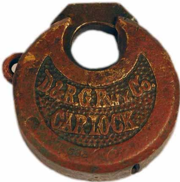
A $3300 bid was needed to take home this Denver & Rio Grande Railway six-lever brass car lock.