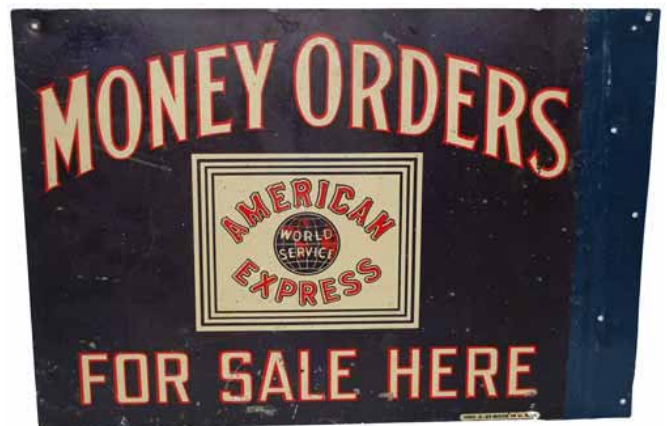
A nice 19 1/2" x 13 1/2" enameled metal sign from the American Express Company brought a high bid of $156.