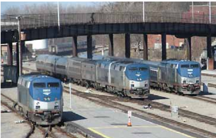
Convention attendees will find plenty of railroad action at the nearby Albany-Rensselaer, NY Amtrak station.

to non-members are scheduled for Saturday, May 5th. The exhibit hall will be open at 10:00 am (9:00 am for registered KL&L members), with railroad history displays and a railroadians swap meet.