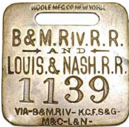
This Hoole baggage tag for use on the Burlington & Missouri River, Kansas City, Fort Scott & Gulf, M&C, and Louisville & Nashville railroads sold for a high bid of $83.