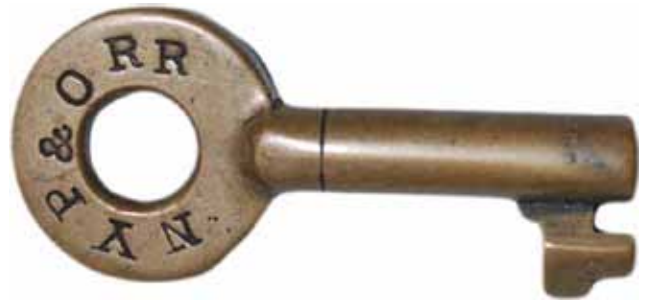
A $143 bid took home this New York Pennsylvania & Ohio Railroad switch key manufactured by W. Bohannan.