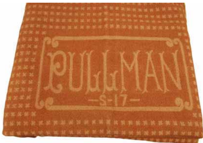
Several small tears didn't stop collectors from bidding this circa-1923 Pullman blanket up to $80