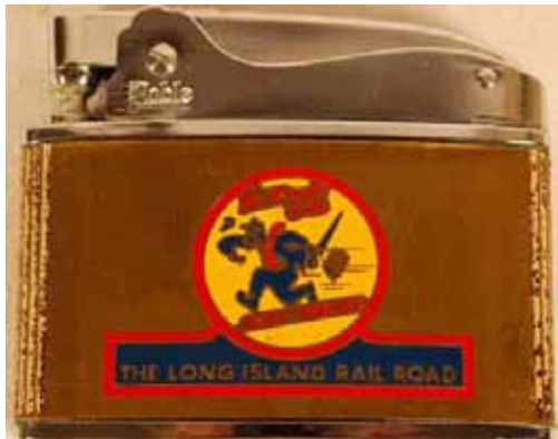
A high bid of $40 took home this Long Island Rail Road "Dashing Dan" logo lighter, made by Zippo.