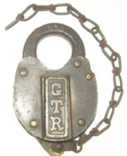
A high bid of $275 was needed to acquire this nicely marked Grand Trunk Railway brass switch lock.