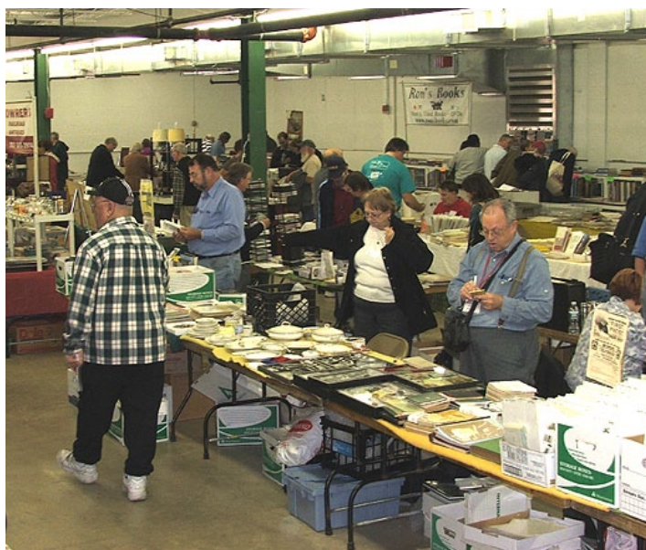
The Gaithersburg show is the place to find unusual items on any collector's "want list."