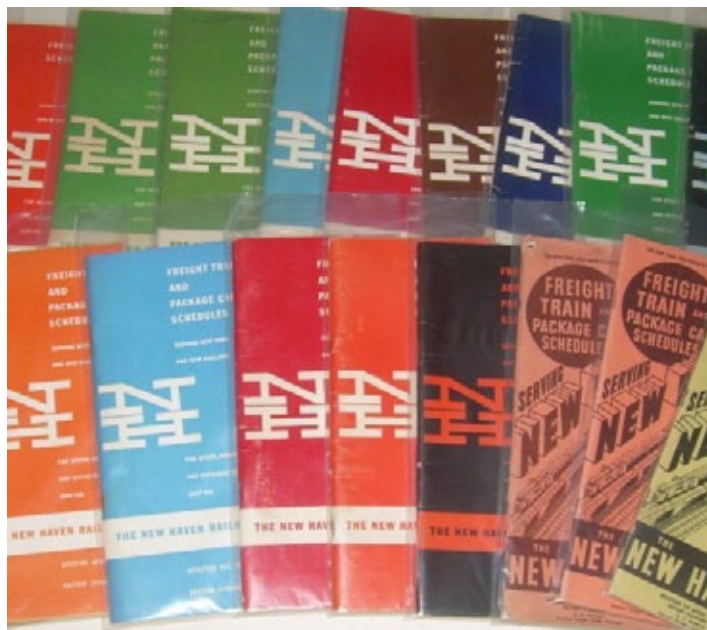
A variety of public timetable lots were sold at the auction, including southern and western lines, and several large groups of New Haven RR employee timetables.

distance customers would appreciate. Starting with the Fall 2013 railroading auction, Brookline began offering online bidding through the LiveAuctioneers service.