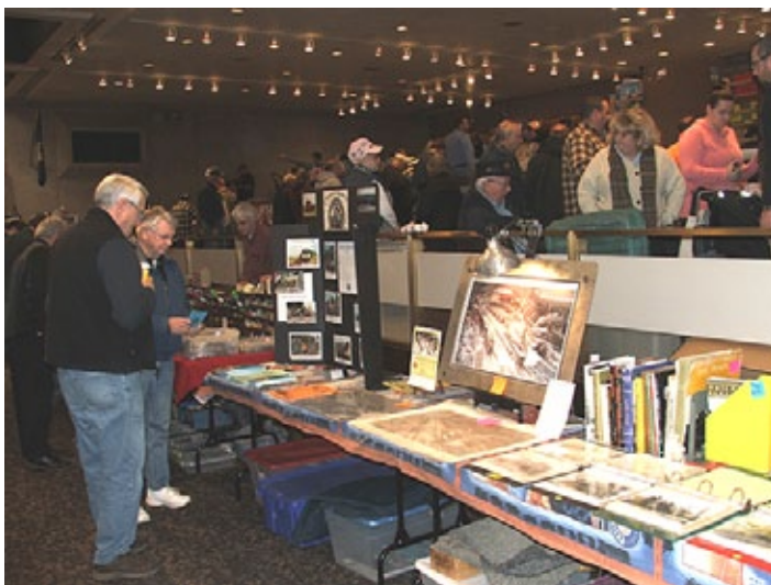
Local train shows often serve as fundraisers for railroad clubs and historical groups, and purchases at many tables support preservation projects.