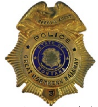
Several rare & seldom offered Police badges including this Great Northern Special Agent