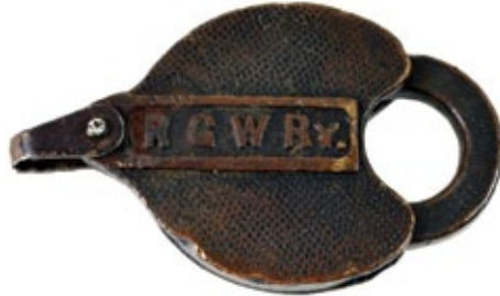
Over 40 brass cast locks including this rare Rio Grande Western Ry