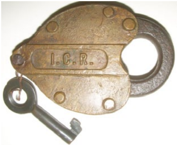
An Intercolonial Railway cast panel brass heart lock and key went to a new home for a high bid of $170.

In recent years, though, the expansion of high speed internet service has allowed many auction houses to offer the best of both worlds. Live online auction services now give internet users the ability to follow advances in price as they