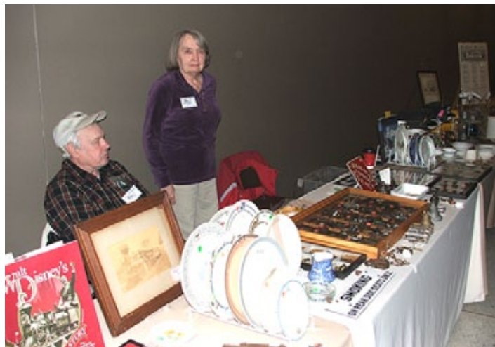
Railroadiana vendors offer a wide variety of memorabilia at the Great Train Extravaganza railroad hobby show, held each December in Albany, NY.

for many years, as has been the Great Train Extravaganza show in Albany, NY. From Buffalo to Poughkeepsie, every major upstate New York city hosted a train show during the holiday season. The “First Frost” train meet took place in Allentown, PA, as it does each November, and the annual New Haven RR Technical & Historical Society convention included its usual public railroad show.