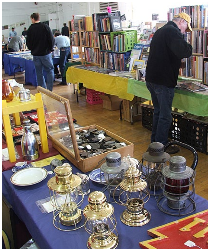
From lanterns, locks, and hardware to books, timetables and advertising, there was something of interest to every collector of railroadiana.

As always, the Gaithersburg railroadiana show was well worth the trip, and those who attended are already looking forward to next year. Photos continued on Page 8.