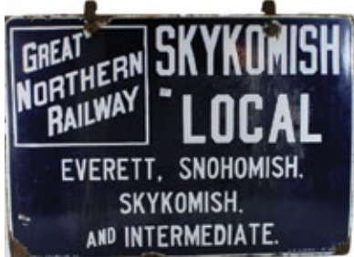
Porcelain signs including this extremely rare Great Northern

We are proud to showcase some upcoming highlights for AUCTION 88 scheduled to close January 12, 2014. Catalogs will be mailed the week of December 20, 2013. This issue features over 500 lots which will include Advertising, Books, Badges, Dining Car China & Silver, Depot, Keys, Lanterns, Locks, paper including passes, TimeTables and Brochures. This promises to be a great start to 2014! Check out our website: www.railroadmemories.com