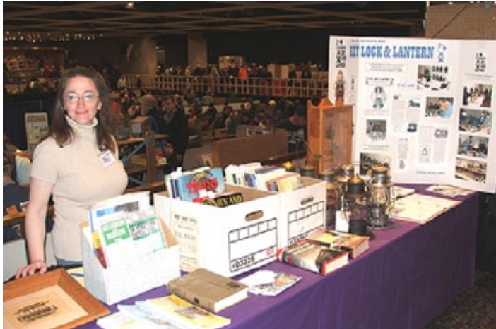
The Key, Lock & Lantern display made its usual appearance at Albany's Great Train Extravaganza.