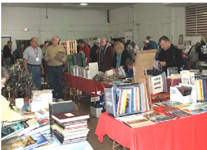
From "top shelf" artifacts to one dollar bargain boxes, there was something for every collector's budget at this year's Gaithersburg show.