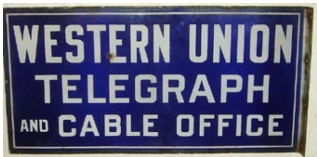
There was a time when a porcelain Western Union Telegraph & Cable Office sign was a common sight in almost every depot. This nice example sold for $160