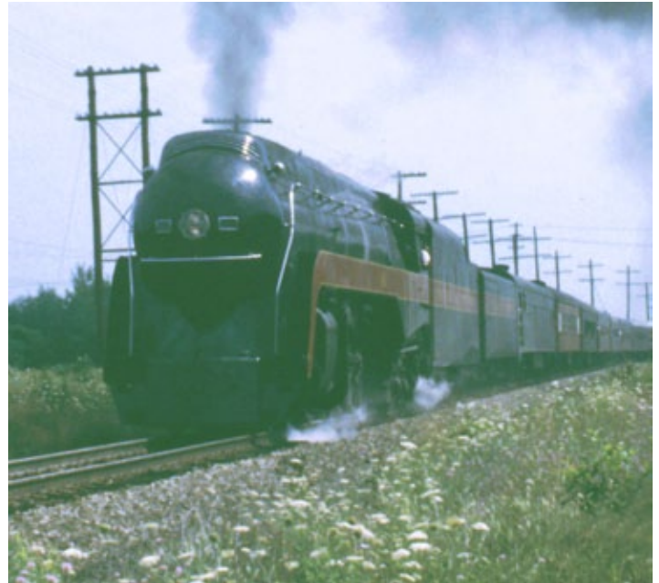
With a generous $1.5 Million donation by Norfolk Southern, N&W J-Class steam locomotive No. 611 is another step closer to pulling excursions again.

The 611 plan contemplates making it available for service in NS’ 21st Century Steam program in 2014. In this program, several vintage steam locomotives from NS’ past give people