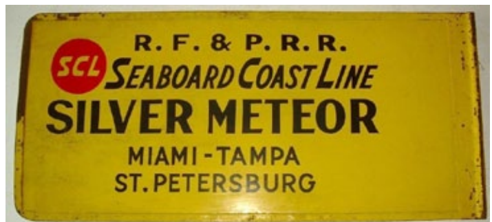
Perhaps the chill in the air had auction attendees thinking of heading south, as this metal gate sign for the Seaboard Coast Line Railroad's Silver Meteor sold for $375.

With railroad memorabilia from across the country consigned to its sales, the Brookline Auction Gallery decided that live online bidding was an option that its long