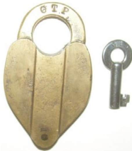
A Grand Trunk Pacific Railway brass heart lock with a Grand Trunk Railway key sold for a high bid of $210.