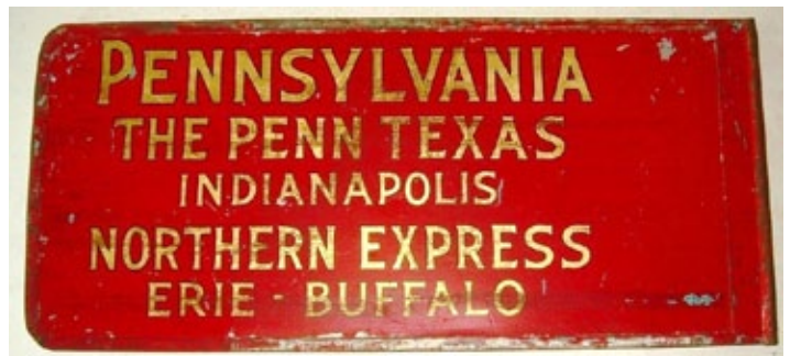
A Pennsylvania Railroad gate sign that includes trains to Washington, Pittsburgh, Indianapolis, and the Northern Express to Erie and Buffalo brought a high bid of $400