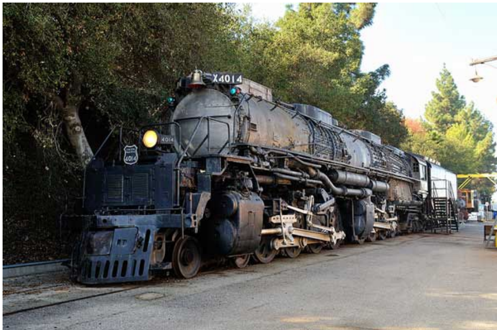
Union Pacific Railroad Big Boy locomotive No. 4014 begins its journey from the RailGiants Train Museum in Pomona, California, enroute to UP Colton Yard and eventually to Cheyenne, Wyoming for restoration as part of UP's Heritage Fleet.

Following a 20-year operating career, the Union Pacific delivered No. 4014 to the RailGiants museum in January of 1962. The locomotive was one of 25 Big Boys built for Union Pacific and was used primarily for freight service on the transcontinental railroad route. The locomotive and tender weigh more than 1.2 million pounds and were delivered to Union Pacific in 1941. The travel schedule for No. 4014 will be published in the coming weeks at www.upsteam.com . News & photo courtesy of Union Pacific.