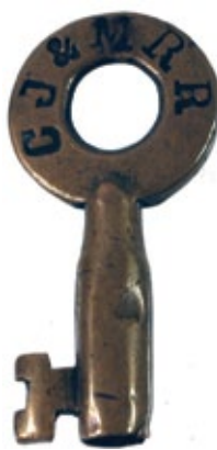
Over 90 Keys including: Chicago Santa Fe & California RR Detroit Grand Haven & Milwaukee & Grand Trunk Ry & Cincinnati Jackson & Mackinaw RR