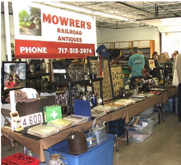
Railroadiana dealers from around the country offer a wide variety of memorabilia at the annual Gaithersburg show.