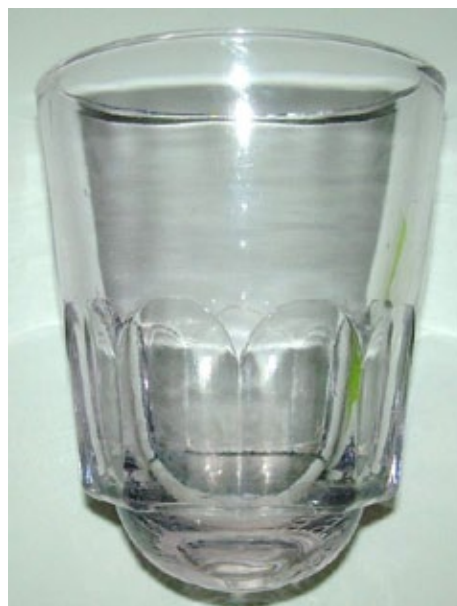
A high bid of $100 took home this round bottom New Haven Railroad parlor car drinking glass.