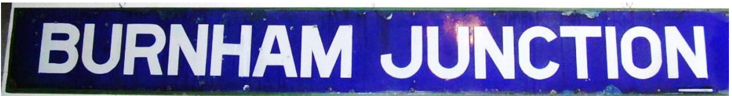
Station signs can vary in price, but all it takes is two bidders with an interest in a location to get things rolling. There were obviously some Maine Central collectors at the auction, with North Anson bringing $625 and $725 for Burnham Jct.