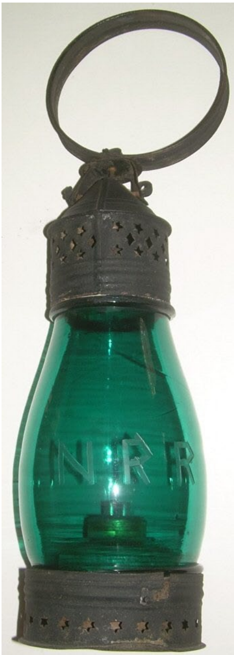
A nice green cut fixed globe lantern from the Northern Railroad of New Hampshire sold for $2100.