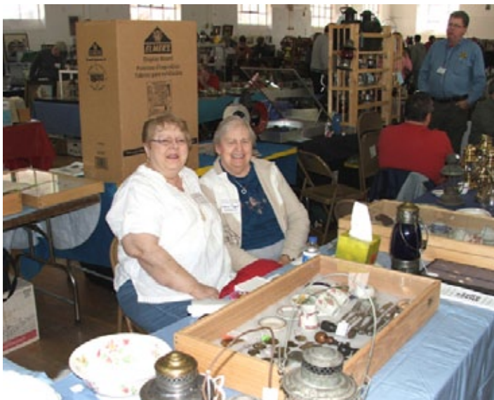
While internet auctions have changed how railroadiana sales transactions take place, nothing beats visiting with fellow collectors in person.