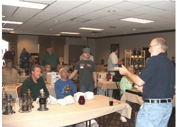
KL&L members enjoy the displays, swap meet, and annual railroadians fundraiser sale at the 2013 Key, Lock & Lantern Convention in Albany, NY.

As always, the convention schedule will include "members only" trading sessions, a railroadians exhibit and swap meet open to all collectors, and railroad history programs. Photos of past conventions are available at www.klnl.org .