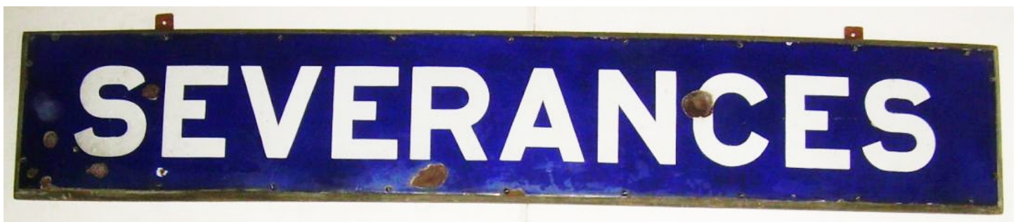
One of several station signs in the auction, this one from Severances on the Boston & Maine Railroad sold for $400.