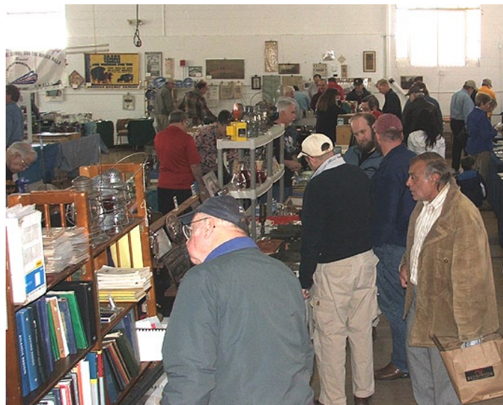
Many collectors came for early admission on Friday and Saturday, but there was still a steady crowd for the "public" show all day on Sunday.