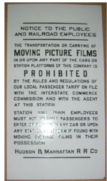
An interesting porcelain sign from the Hudson & Manhattan RR went to a new home for a reasonable $65.