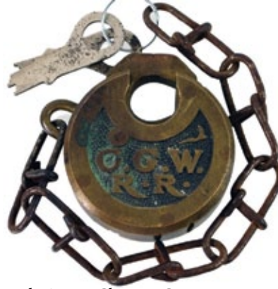
Early & rare Chicago Great Western Railroad round brass six lever