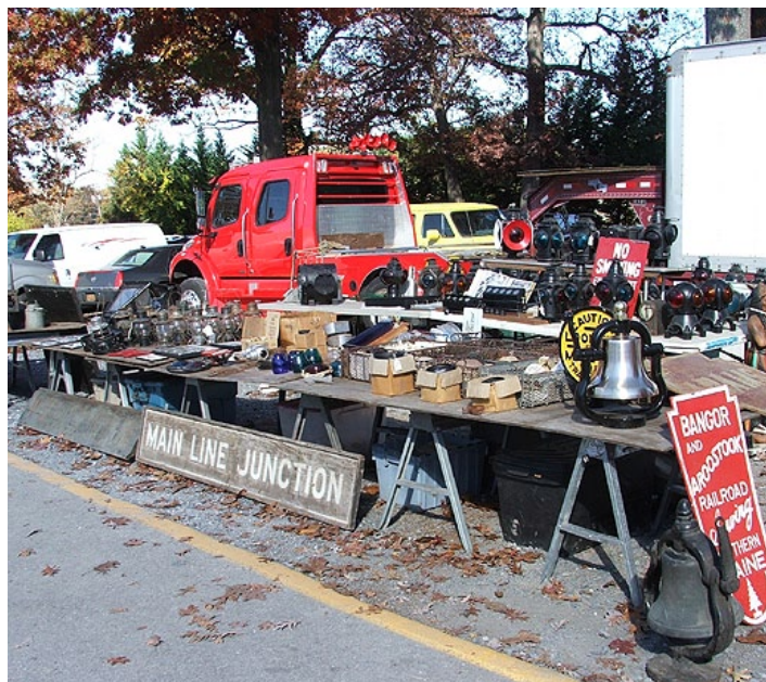
The outdoor display of signals, signs, and other large hardware is a traditional fixture at the show. Clear (but chilly) weather allowed for comfortable browsing.