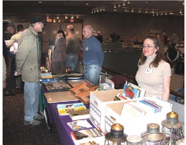
Train shows provide serious collectors with the opportunity to introduce railroadiana to new participants in this aspect of the general railroad hobby.

The northeast must be filled with railfans, as an abundance of shows take place in this region. The New England Model Train Expo has been a regular event in Marlborough, MA