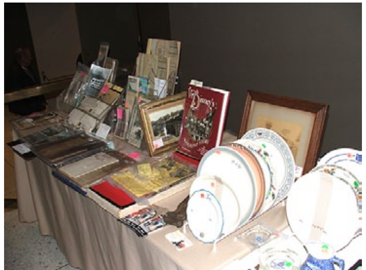
Looking for the first chance at new dealer stock before the next railroading event? The local railroad hobby show often provides a preview.