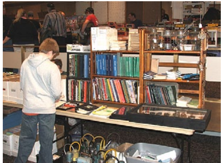
A younger collector peruses some of the employee timetables and locomotive operating manuals offered at Albany's Great Train Extravaganza.

Additional train shows are scheduled throughout the winter season, for those who are experiencing "cabin fever" in the colder climates, and for railfans who need a break from the typical routine in the south. Many events serve as fundraisers for railroad clubs and historical societies, so they support railroad preservation projects, as well. Be sure to check out the railroad event calendar in the KL&L News , and online at www.klnl.org , for listings of train shows and related events. Participation in a train show is an excellent way to promote the railroading collecting aspect of the hobby, and is always an enjoyable way to spend an afternoon. See you at the show!