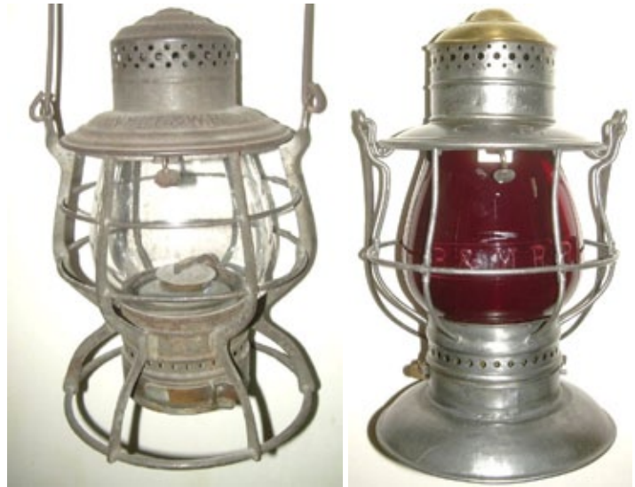
An Adams & Westlake lantern marked for the New York, Lake Erie & Western RR, with an unmarked globe, sold for a reasonable $190, while a Concord Railroad brass top with a red cast Boston & Maine globe sold for $425.

take place, and to submit updates to their bids in real time. Instead of leaving bids and hoping for the best, absentee bidders can participate directly in an auction, almost as if they were bidding from the floor.