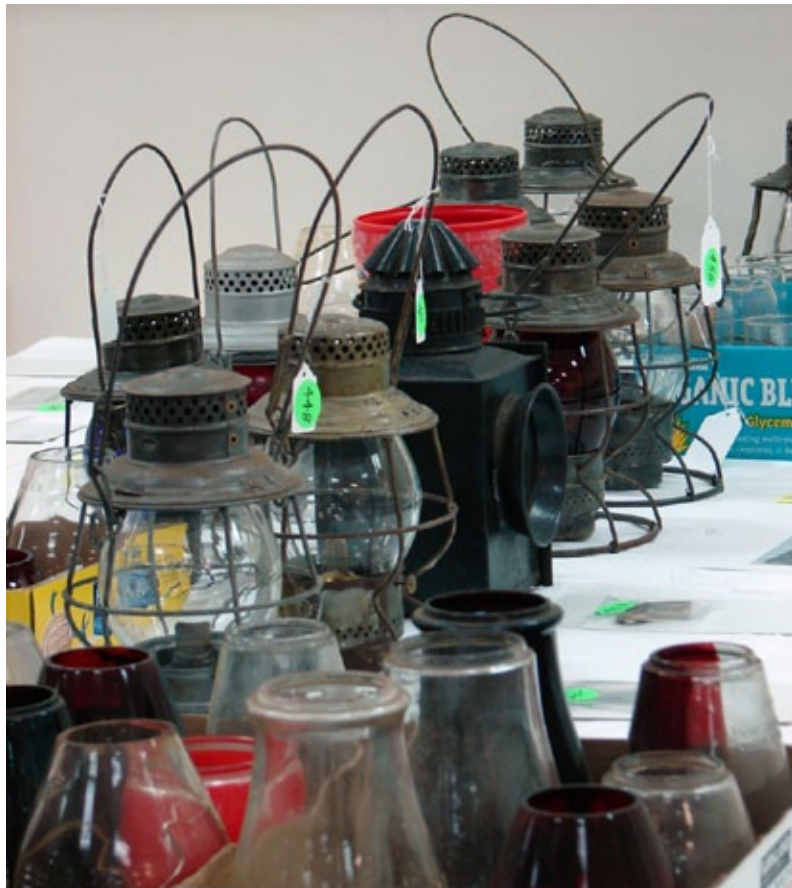
While Brookline has recently added live online bidding for its auctions, many collectors still prefer to attend in person and inspect the lots first hand.

photos in his online catalogs, many collectors still like to inspect the lots first hand. There is also the opportunity to size up the competition, and judge the pace of the sale, when it comes to deciding whether or not one more bid might take home that scarce artifact. The internet may have changed the auction environment, but being there in the gallery is still the way to go for many collectors.