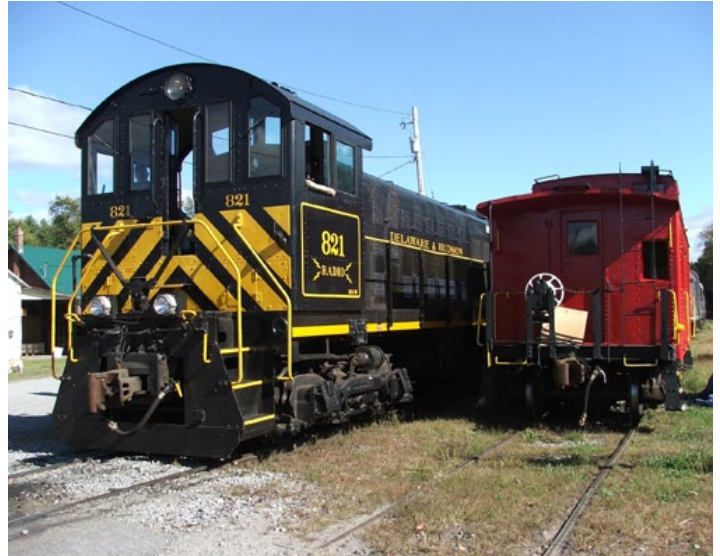
A variety of historic equipment will be on display at the North Creek Depot's 2014 Rail Fair.