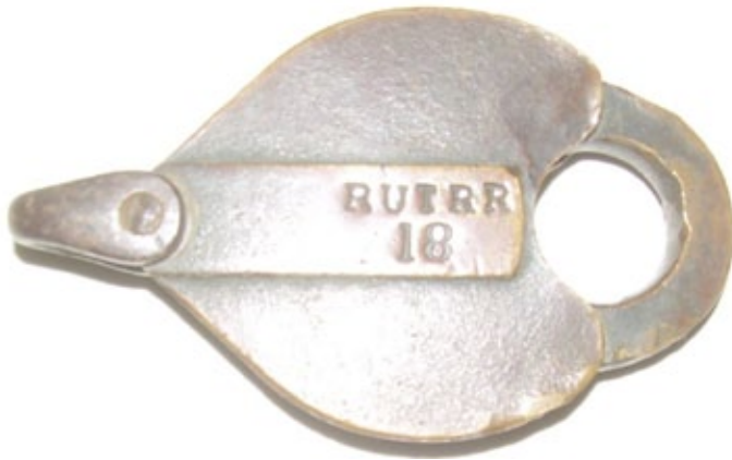
This Rutland Railroad brass heart lock made by the somewhat scarce (and old) manufacturer T.M. Motley went to the high bidder for $450.