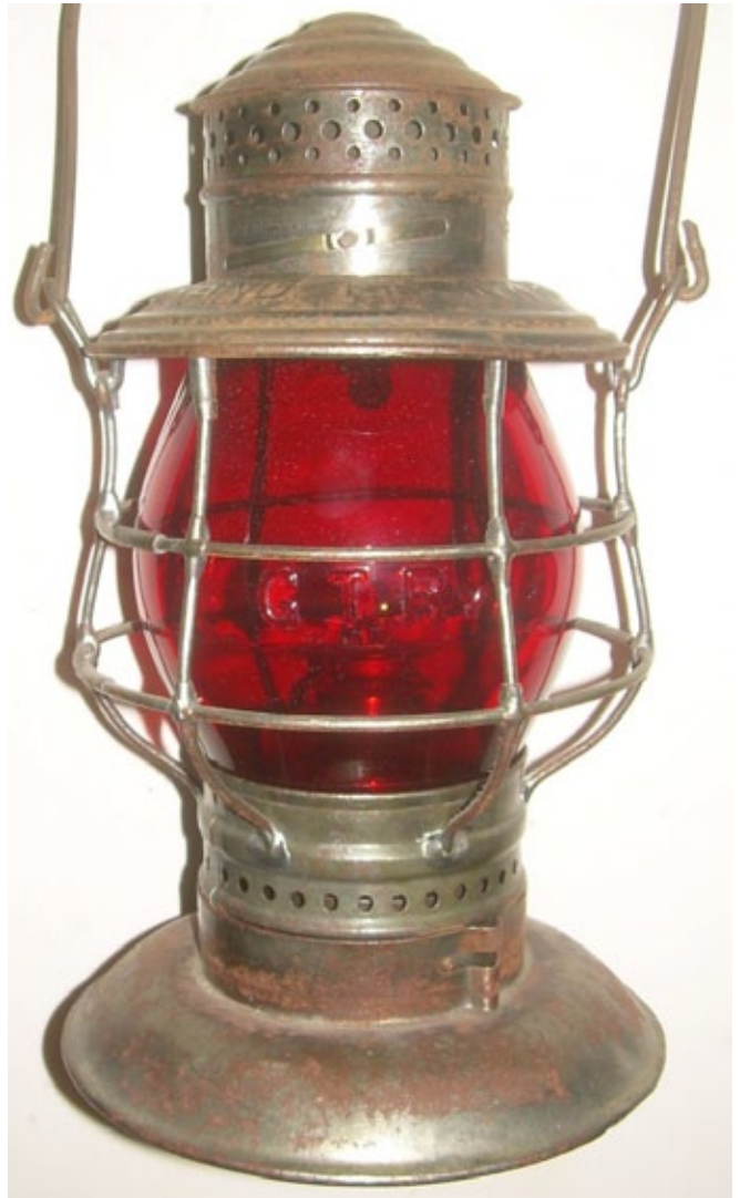
A nice Grand Trunk Ry Adams & Westlake bellbottom lantern, with a little surface rust, and matching red cast globe sold for a reasonable $325.