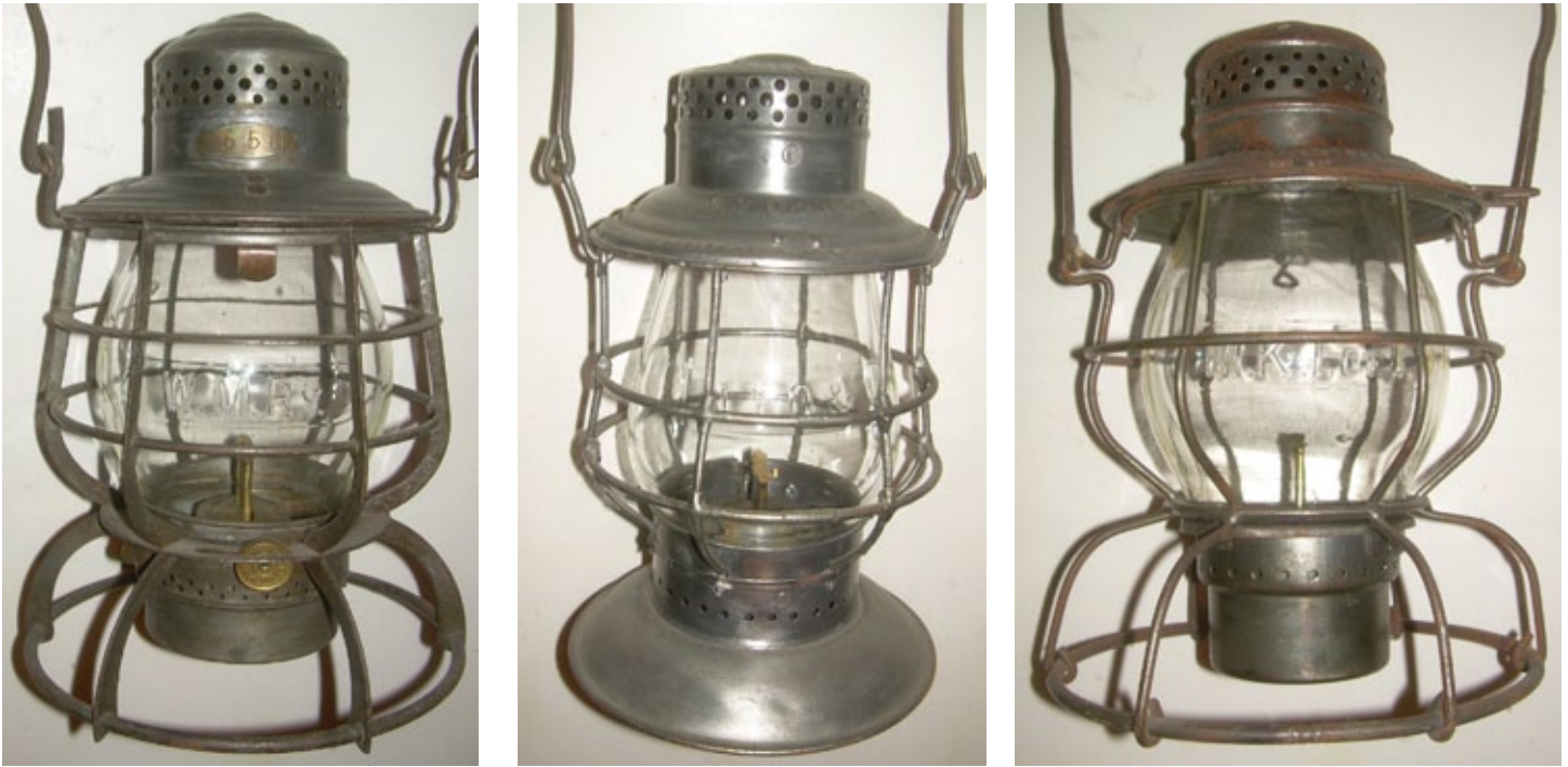
Several extensive lantern collections have been consigned to Brookline and have been offered in recent sales. From left to right, a Western Maryland Railway with clear cast globe ($350), a New York Ontario & Western with clear cast globe ($350), and Missouri Kansas & Texas with a clear MKT of T cast globe ($190).