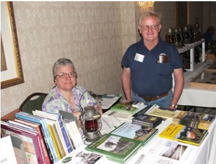
Local railroad history books and related memorabilia were offered by the Utica & Mohawk Valley NRHS chapter.