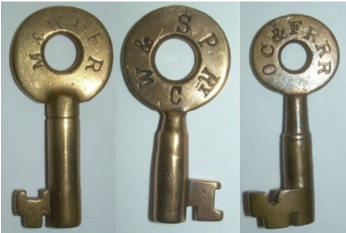
Some of the keys in the auction included a Montpelier & Wells River ($160), a Winona & SP "Car" key ($600), and Old Colony & Fall River ($650).