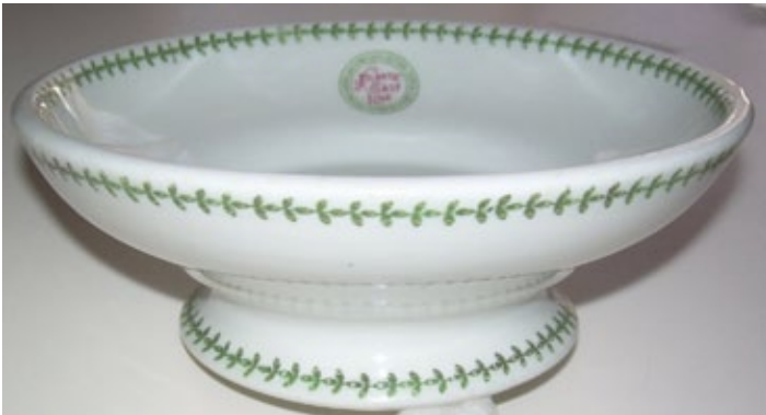
A high bid of $150 took home this Atlantic Coast Line Railway Palmetto pattern footed compote, produced by Liberty China.