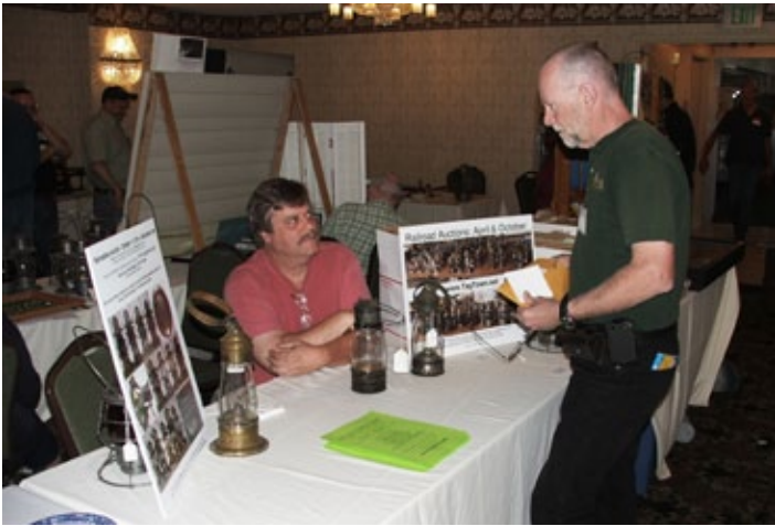
The KL&L Convention provides the opportunity to network with other railroadiana collectors and railroad history buffs.