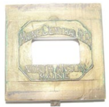
Dater dies from Waukegan, IL on the Chicago, North Shore & Milwaukee ($170) and North Anson, ME on the Maine Central Railroad ($260).