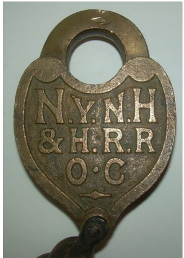
This rare New York, New Haven & Hartford, Old Colony Division fancy cast back lock with Old Colony keying went to a new home for $500.