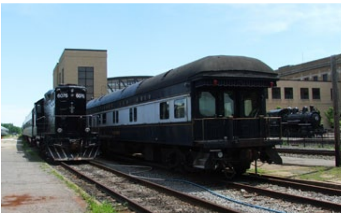
The Adirondack Scenic Railroad excursion train prepares to depart from Utica Union Station, with KL&L members on board for a trip to Remsen on the Utica & Black River line.