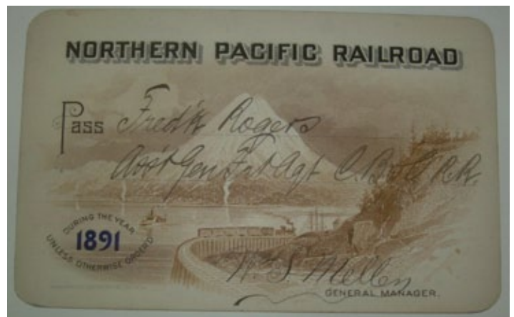
A $130 bid was needed to take home this 1891 Northern Pacific Railroad pass with an ornate vignette of a train passing through the mountains.