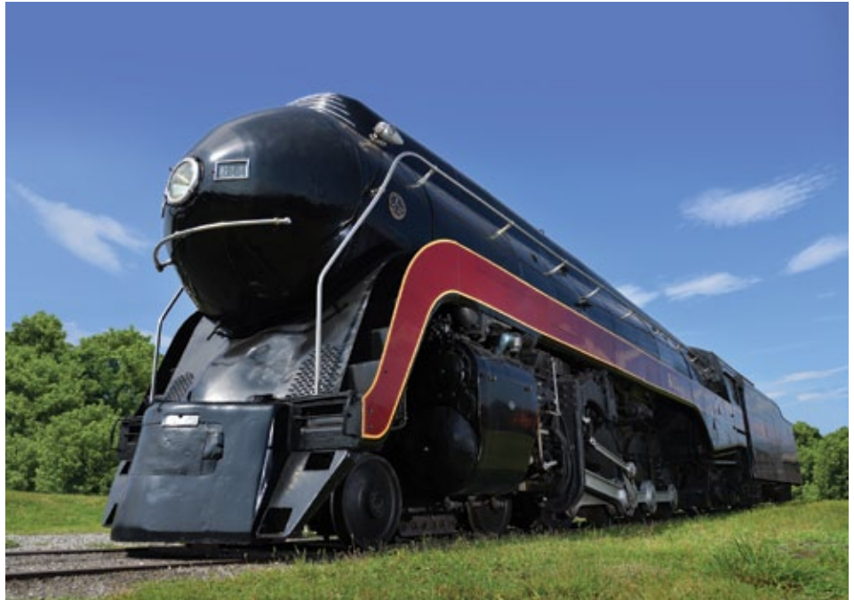
The Virginia Museum of Transportation's Norfolk & Western Railway J-Class steam locomotive No. 611 is undergoing restoration at the North Carolina Museum of Transportation's Spencer shops.