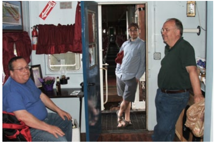
KL&L members take a ride in the Boston & Maine caboose on the Friday night Adirondack Scenic RR excursion.