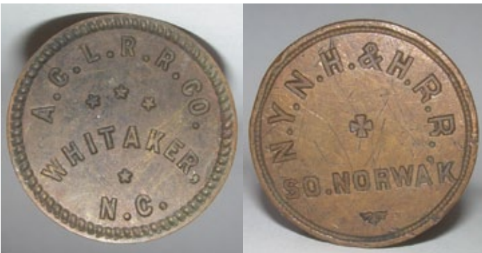
Wax sealers usually command high prices, with an Atlantic Coast Line from Whitaker, NC selling for $325 and South Norwalk on the New Haven for $900.