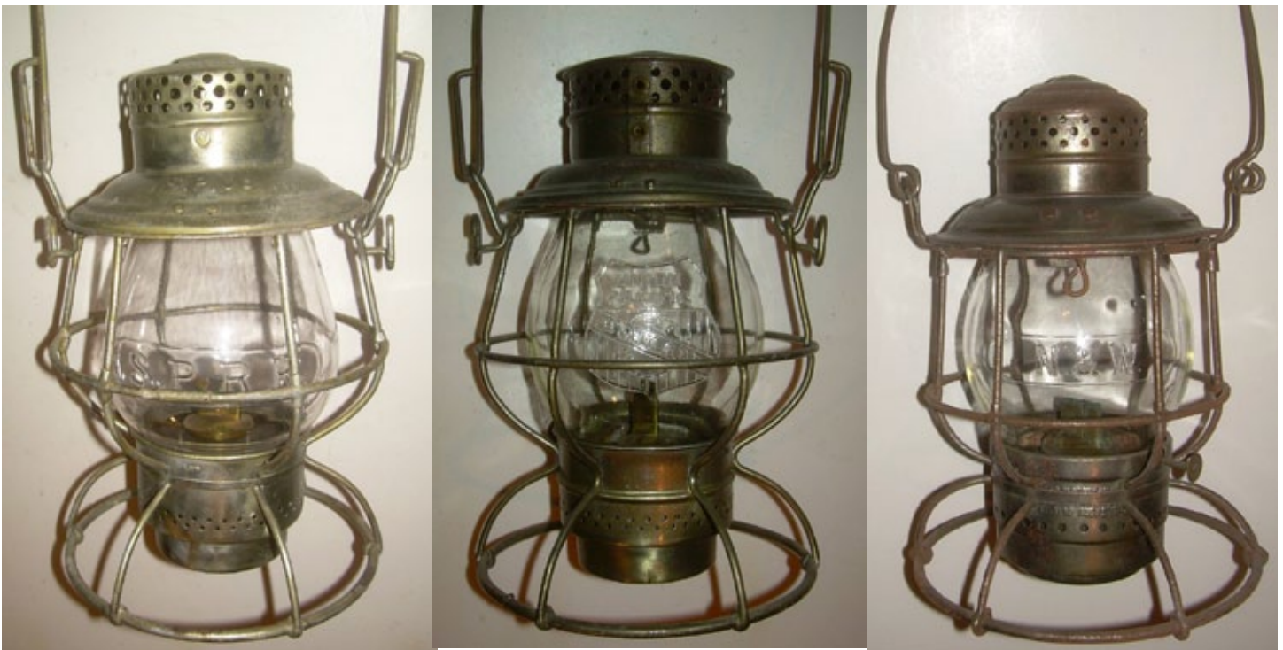
From left to right, a Southern Pacific marked "SP Co" with a clear cast "SPRR" globe ($275), a fancy Union Pacific clear cast shield logo globe in a UP frame ($250) and a Norfolk & Western by Armspear with a clear cast "N&W" globe ($210). In the days before online bidding, a collector could probably walk away with these lanterns for under $50 each at an auction in New England, but these days they don't go unnoticed by bidders in their home states.