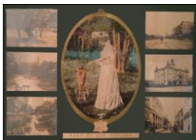
Depot Print Titled 'Katy at San Antonio' with MKT logo