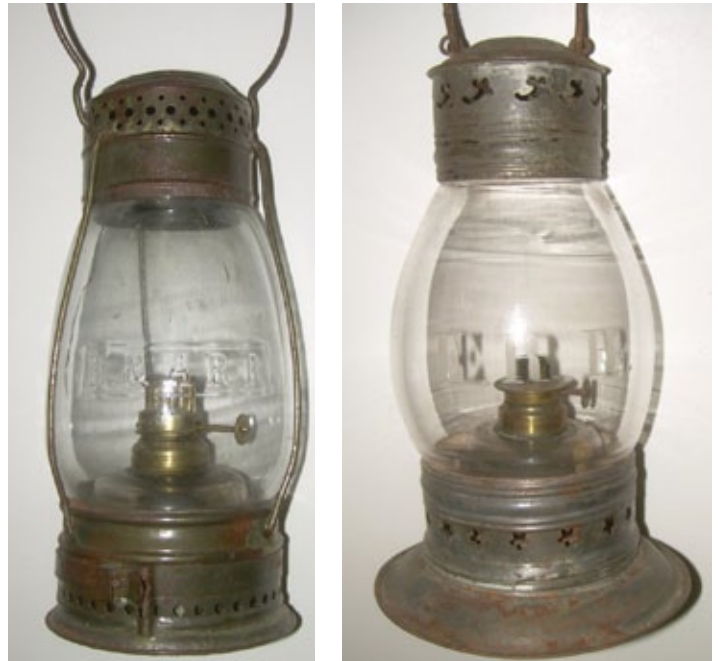
Fixed globe lanterns remain popular, with a later model Boston & Albany (left) bringing $250 despite a cracked globe, and an Eastern Railroad cut globe by New England Glass selling for $425.