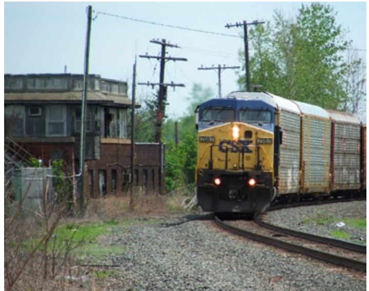
History meets modern railroading: a westbound CSX auto rack train passes New York Central Signal Station 30 at Utica Union Station during the 2014 KL&L Convention.

A brief membership meeting was held in the morning, and after exhibitors were given time to take a lunch break at the hotel pub, the annual fundraiser auction was held in the early afternoon. Thanks to many generous donations from KL&L members, which included all types of railroadiana, auction participants were able to take home some interesting items for their collections (some at bargain prices) and the organization raised funds for future projects.