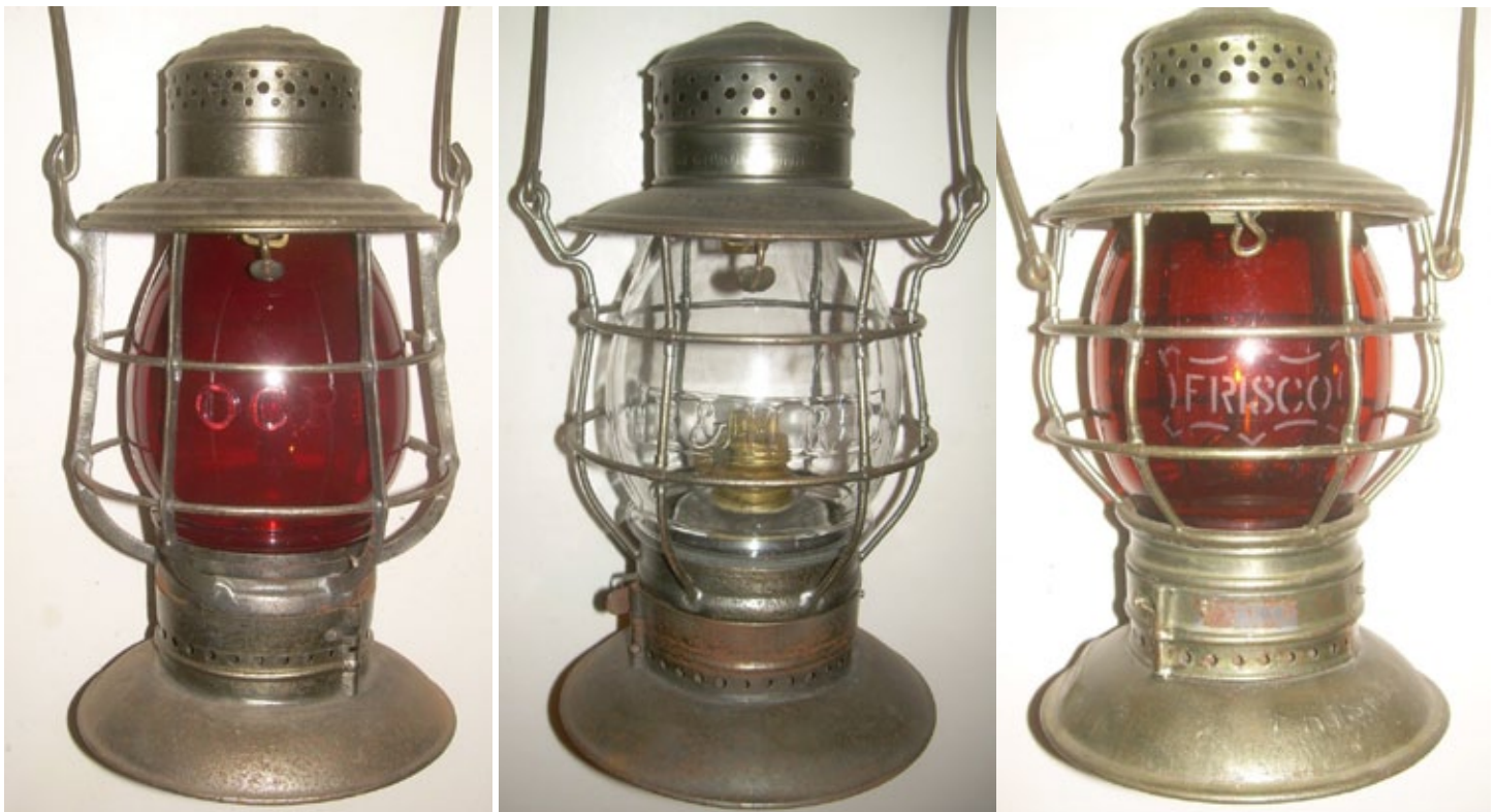
From left to right, Old Colony Railroad with matching 6" red cast "OC RR" barrel globe ($600), scarce Star Headlight Company marked for the Boston & Maine, with clear cast "B&M RR" barrel globe ($375), and Frisco marked on the bell bottom with amber etched "Frisco" logo globe ($400).