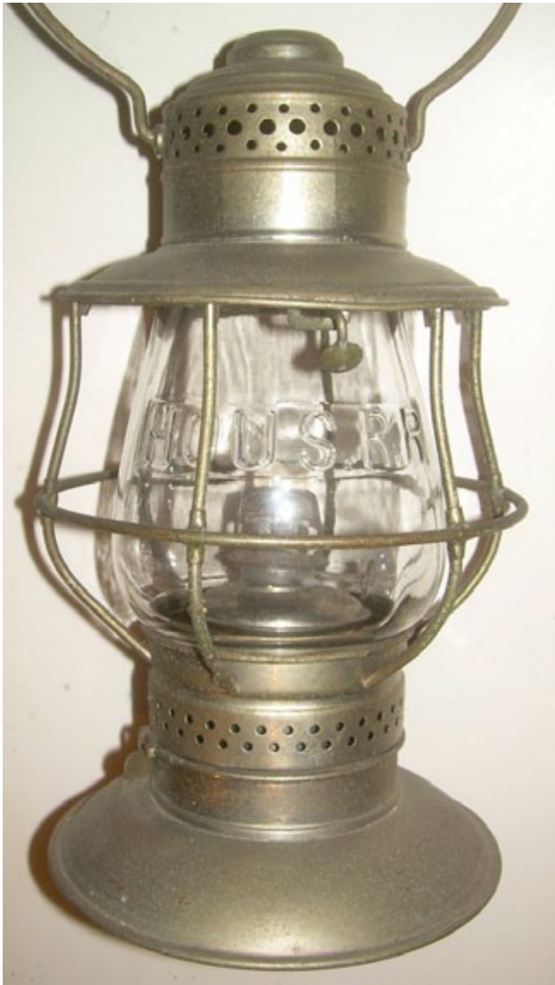
How often do you find a cast "HOUS RR" globe from the Housatonic Railroad in near perfect condition? Almost never. The cost to take one home if you do? $950 in an unmarked Dietz frame.