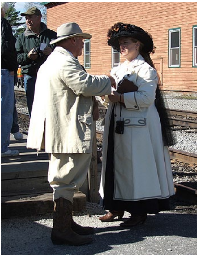
Teddy Roosevelt greets visitors to the North Creek Depot Museum at the 2013 Rail Fair.

and the mines at Tahawus. Food and craft vendors, along with activities for children, will also be part of the festival, making it an event that the entire family will enjoy.