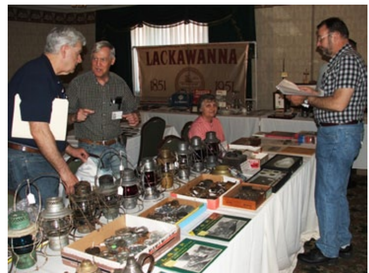
Railroadiana exhibits and sales tables filled the 2400 square foot meeting room at the Hotel Utica, during the Saturday railroadiana show and swap meet.

After packing up the displays, many KL&L members headed out for some local railfanning, or to visit the many historic railroad sites in the area. From the former New York Central signal station that once controlled train movements in Union Station to the remnants of the O&W branchline, there was plenty to see. A constant parade of CSX and Amtrak trains on the mainline (visible from many members' hotel rooms) provided non-stop entertainment for the entire weekend, and a variety of other photo locations were found within a half hour drive.