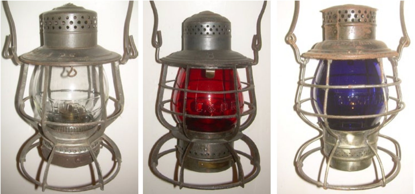
From left to right, a Hocking Valley Railway Keystone Casey lantern with "HV Ry" clear cast globe ($300), a nice Chesapeake & Ohio Railway by Armspear with a red cast "C&O Ry" extended base globe ($250), and a scarce New York, New Haven & Hartford Railroad by Adlake with a "NYNH&HRR" blue cast globe ($2600).