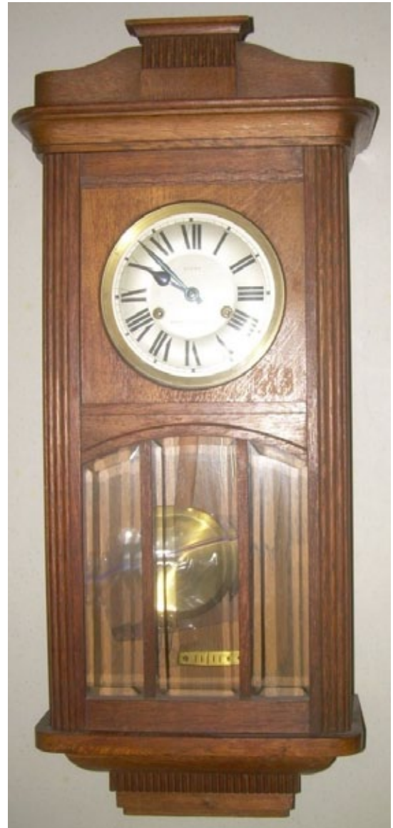
The wall clock from the Maine Central agent's office in Portland, ME sold for $1050.