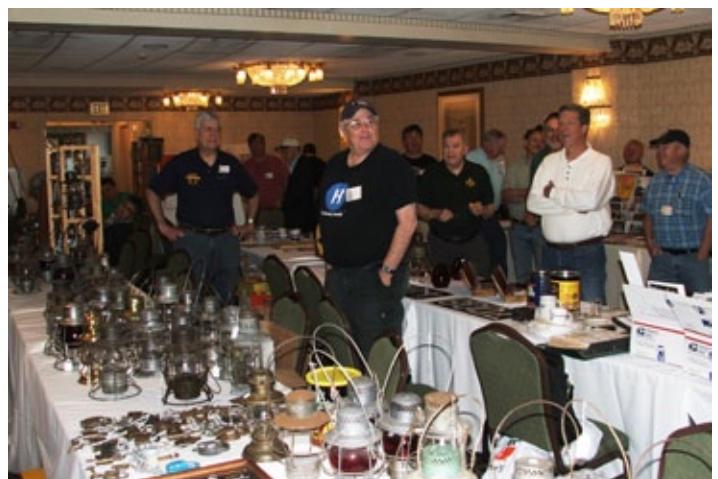
With the forty tables of railroadiana packed into one room, there was plenty of time to see everything and still visit and share stories with fellow collectors of railroad memorabilia.