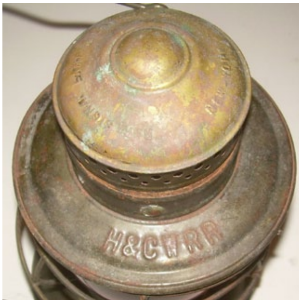
A rare brass top lantern by the Railroad Signal Lamp & Lantern Company, marked for the Hartford & Connecticut Western RR sold for $600.