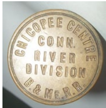
Two examples of wax sealers in the auction included Peterborough, NH on the Boston & Maine ($400) and an interesting Chicopee Centre from the B&M Connecticut River Division ($500).