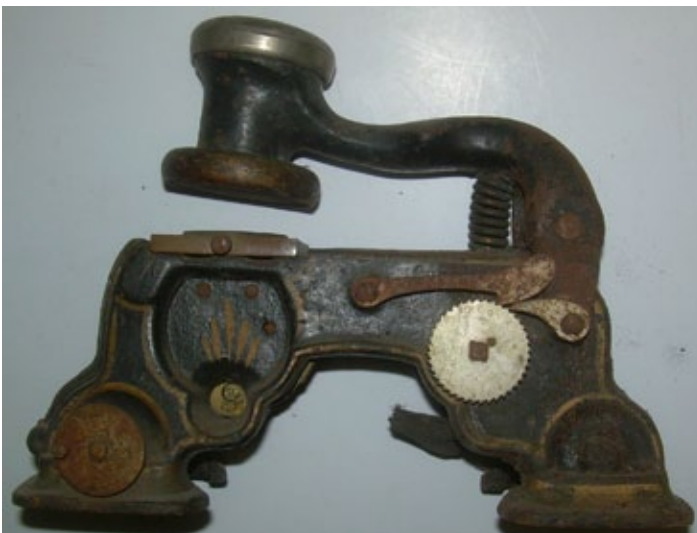
The $180 high bid for this ticket validator machine was due to the fact that it contains the Sacandaga, NY die from the Fonda, Johnstown & Gloversville.