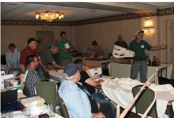
The annual fundraiser sale is always an entertaining event, with the chance to take home something new for the collection and raise money for Key, Lock & Lantern.