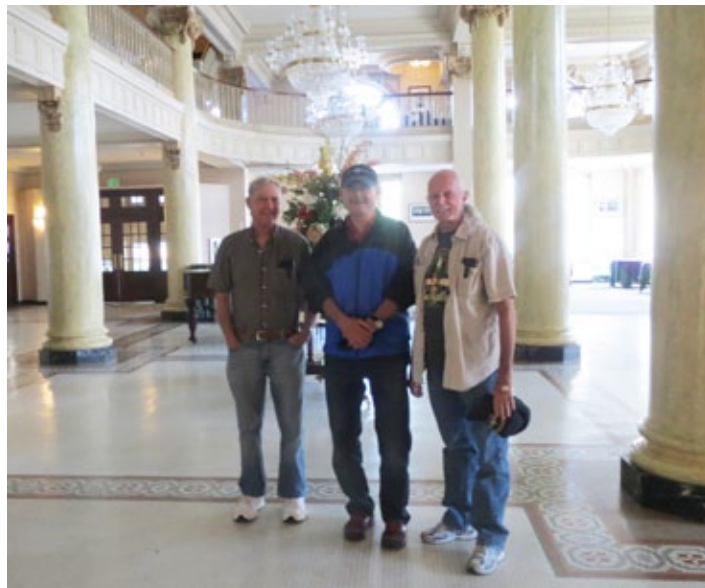
The beautifully restored historic 1912 Hotel Utica provided the perfect setting for the 2014 Key, Lock & Lantern Convention.

After packing up the displays, many KL&L members headed out for some local railfanning, or to visit the many historic railroad sites in the area. From the former New York Central signal station that once controlled train movements in Union Station to the remnants of the O&W branchline, there was plenty to see. A constant parade of CSX and Amtrak trains on the mainline (visible from many members' hotel rooms) provided non-stop entertainment for the entire weekend, and a variety of other photo locations were found within a half hour drive.