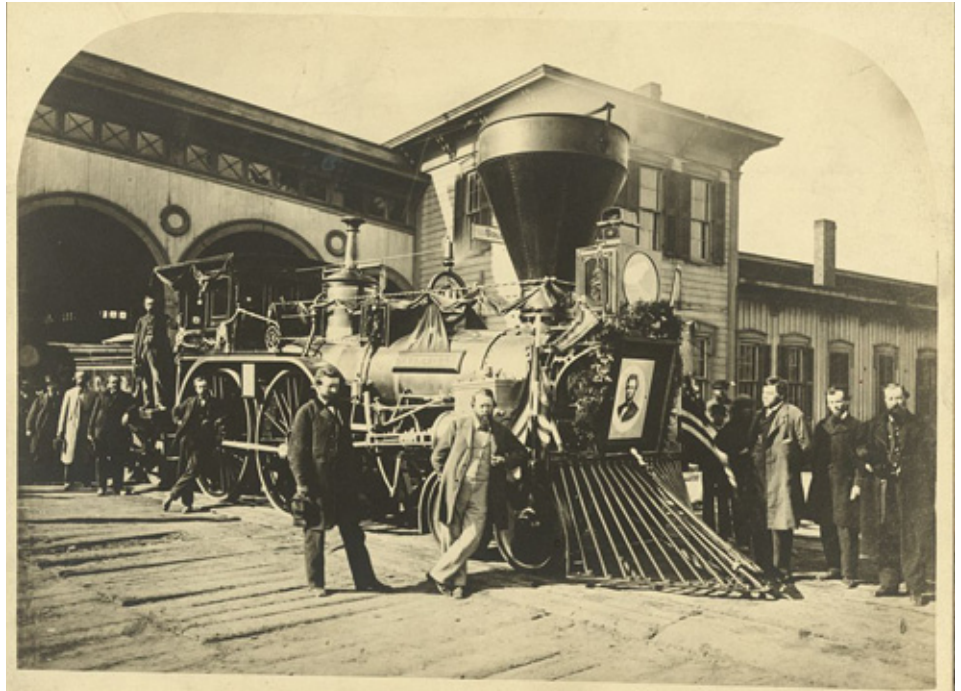
Lincoln funeral train steam locomotive "Nashville" on the Cleveland, Columbus & Cincinnati Railroad. Library of Congress collection. LC-USZ62-11964

For more information about the Lincoln funeral train, to learn how arrangements can be made to bring it to a specific community, and to find current tour schedules, visit the group's website at www.the2015lincolnfuneraltrain.com or look for their page on Facebook.