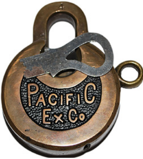
A high bid of $2050 was needed to take home this six lever "pancake" lock from the Pacific Express Company.