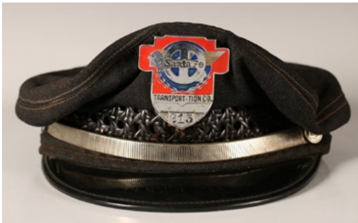
An unusual “Santa Fe Transportation Co.” uniform cap by Eagleson with enameled badge sold for a $300 bid.