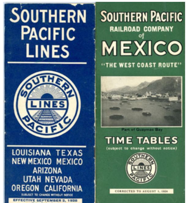
There were several large lots of timetables in the auction, with a group of 60 from the 1920’s & 30’s selling for $200.