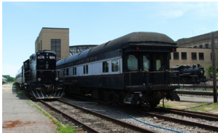
The 2015 KL&L Convention will feature another Adirondack Scenic Railroad excursion, this year to Boonville, NY.

plenty of time throughout the weekend to visit with fellow KL&L members, meet other collectors and railroad history buffs, and trade stories about railroading. The Key, Lock & Lantern Convention is not a public "train show" in the traditional sense, but it is a gathering of people who have a sincere interest in railroad preservation. It is this social and educational aspect of the event that makes it unique.