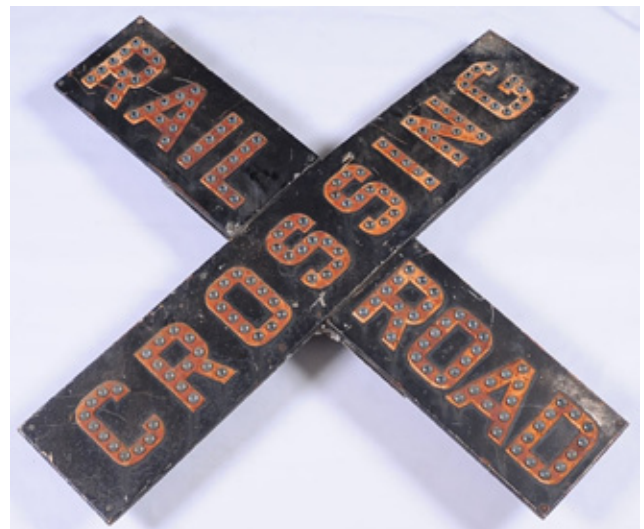
This nice "Railroad Crossing" sign with original cats eye reflectors attracted some interest, selling for $550.