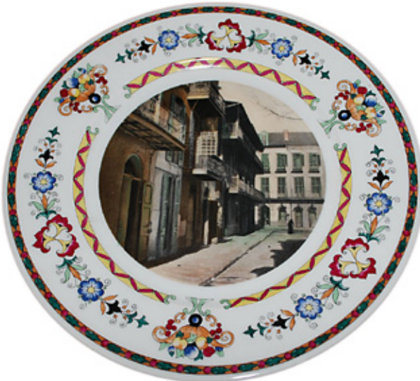
Illinois Central French Quarter service plates are always popular. This example of "Pirate Alley" sold for $1150.