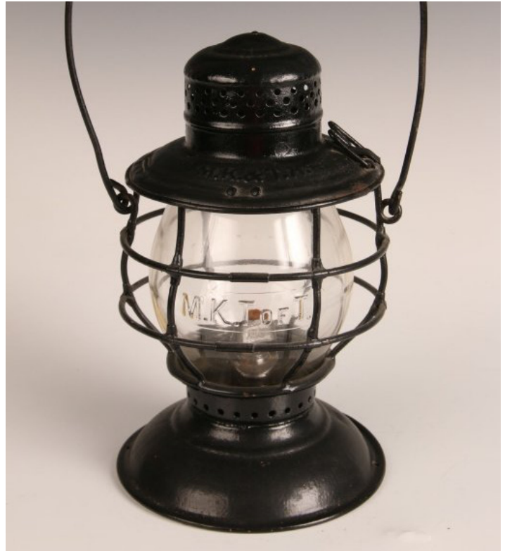
A nice Katy bellbottom lantern marked “MKT” with a clear cast “MKT of T” globe sold for a high bid of $475.

Lanterns, timetables, and paperwork were included in the many lots sold, along with a large selection of dining car china and railroad silver. Dale Falk’s collection also contained much scarce memorabilia from hotels run by Fred Harvey, and some unusual early items from area railroads. With online bidding, artifacts from eastern lines brought in many bids, as well. All photos, lot descriptions, and prices realized are courtesy of Dirk Soulis Auctions and do not include buyers premiums or shipping costs.