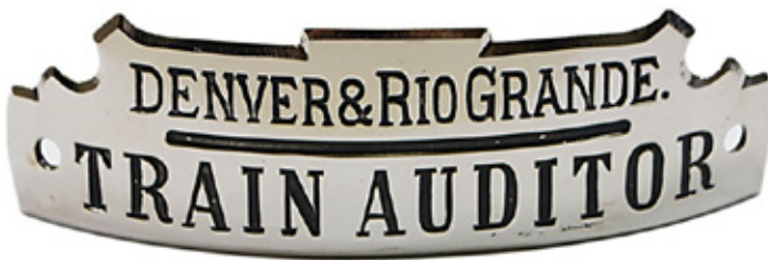
A $1050 bid took home this unusual occupation Train Auditor badge from the Denver & Rio Grande Railroad.