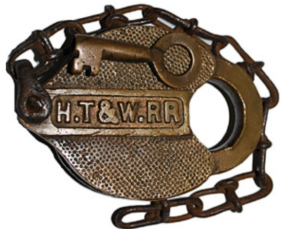
A $480 bid purchased this Hoosac Tunnel & Wilmington RR lock by Fairbanks Co. with an unmarked matching key.