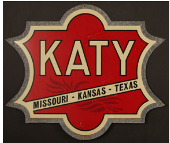
A $650 high bid was required to take home this 30"x36" Katy logo decal mounted on a steel backing.