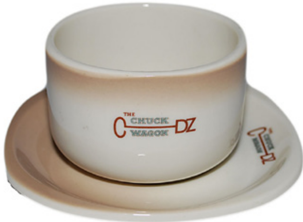
A CB&Q Zephyr Chuck Wagon pattern bouillon cup & saucer by Syracuse China sold for a high bid of $400.

Railroad Memories online & catalog auction #91 closed on January 11, 2015, with their usual selection of rare western railroad memorabilia, and a few nice artifacts from eastern lines sprinkled in between. As usual, it was evident that there were plenty of “heavy hitters” among Colorado collectors, as railroadiana from several popular lines in that region were the high ticket items in the auction. All photos, prices, and descriptions are courtesy of Railroad Memories.