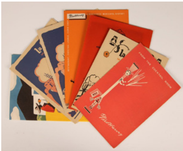
A $100 bid was needed to purchase this small group of Fred Harvey menus, one of several Harvey lots in the sale.