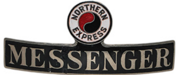
Another interesting occupation, this Northern Express Messenger monad logo cap badge went for $675.