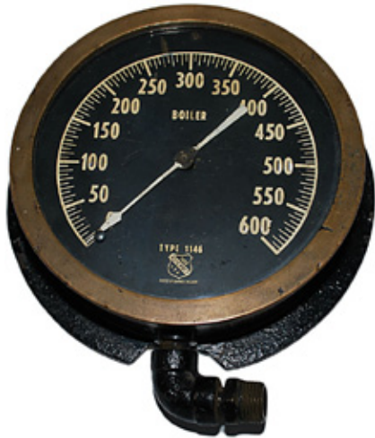
A $340 bid purchased this Ashcroft steam gauge, that was reportedly used on Union Pacific locomotive #3954.