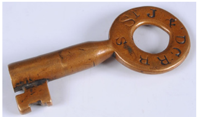
This scarce tapered barrel switch key marked for the Saint Joseph & Denver City Railroad (of Texas) sold for $225.