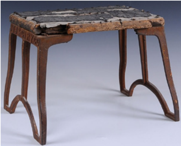
This unusual step stool marked for the St. Joseph & Grand Island Railway on its cast iron legs sold for a $300 bid.