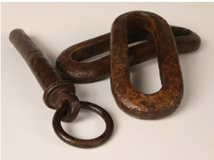
Artifacts from an early era in railroading history, this link and pin coupler set sold for a high bid of $140.