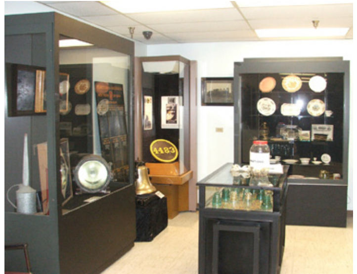
The former office building of the National Aniline plant on Lee Street in Buffalo now houses the library and exhibits of the Western New York Railway Historical Society.

The Nickel Plate Road Historical & Technical Society has been involved with the development of the museum from the start, and artifacts from its collection are on display there. With the expansion of the Heritage Discovery Center's