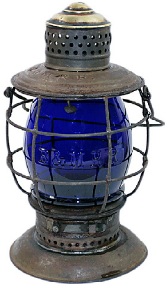
While the lantern frame had some issues, the blue Boston & Maine globe inside commanded a $675 high bid.