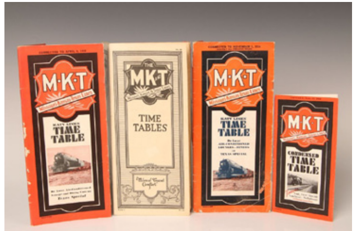
This lot of four nice Missouri, Kansas & Texas Railway public timetables went to the high bidder for $110.