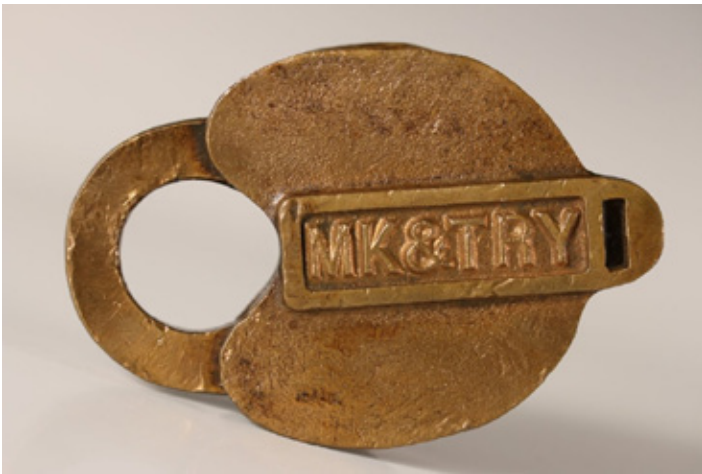
A nice "MK&TRY" marked brass heart lock for $250 was one of many artifacts from the Katy in Dale Falk's collection