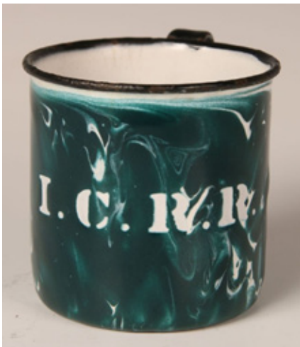
A $200 bid was needed to purchase this Illinois Central RR graniteware cup, with minor chipping on the rim & handle.