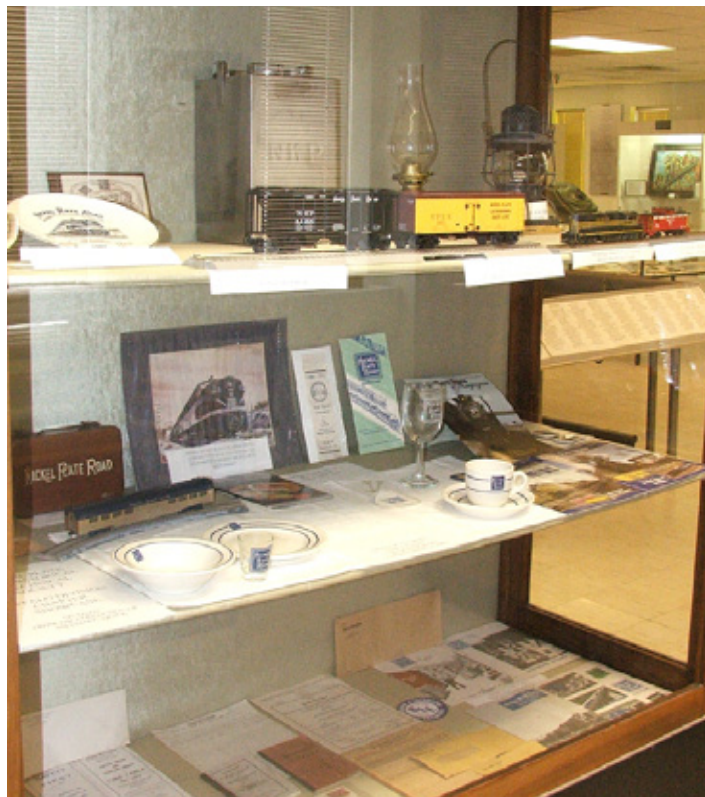
The Nickel Plate Road Historical Society has been a participant in the development of Buffalo's Heritage Discovery Center, and it now houses the group's archives.

library, it was a logical step to relocate the organization's archives there from their former home in Cleveland. The move of the Nickel Plate society's records, documents, and memorabilia took place during 2014.