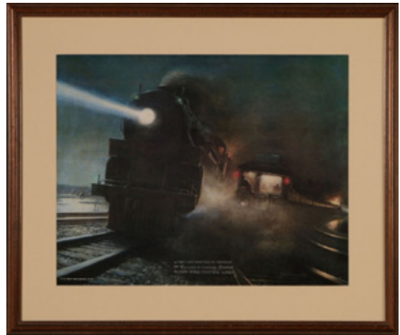
Not everything in the sale was from western roads. Several NY Central calendar prints were sold, this one for $90.