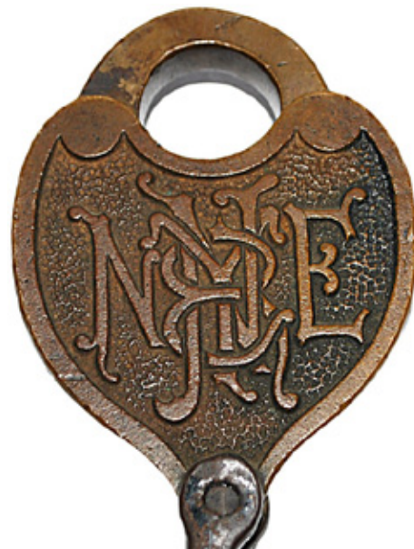
A $775 bid purchased this fancy cast brass heart lock for the New York & New England, made by the S&M Mfg. Co.