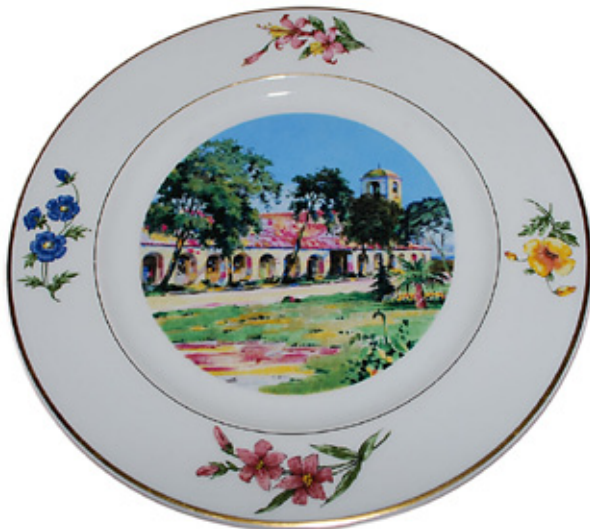
Another piece of rare china, this Southern Pacific "Mission San Juan Bautista" service plate brought a $2450 bid.