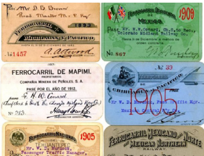
A collection of two dozen passes from early Mexican lines went to a new home for a high bid of $350.