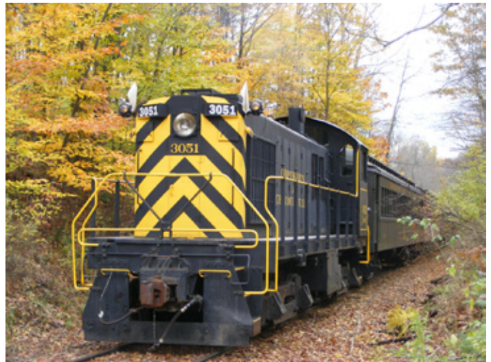
An excursion train on the Cooperstown & Charlotte Valley Railroad between Milford & Cooperstown, NY.