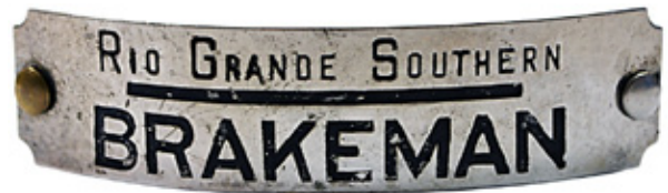
This Rio Grande Southern Brakeman cap badge by Kauffman of Denver sold for a high bid of $1850.