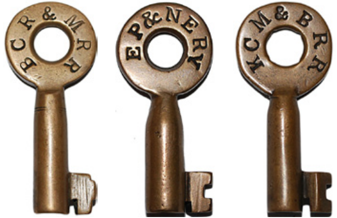
Some of the many keys sold: Burlington, Cedar Rapids & Minnesota RR ($550), El Paso & North Eastern RY ($320), and Kansas City, Memphis & Birmingham RR ($775)