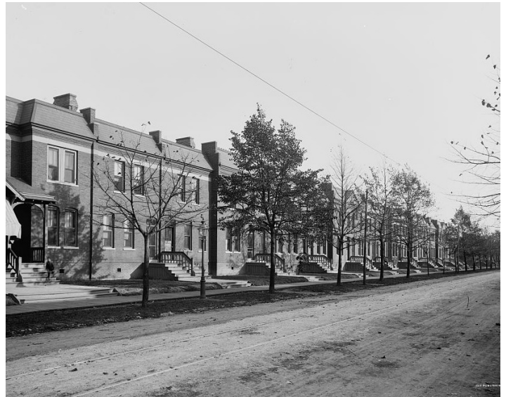
Workmen's houses in Pullman, IL, circa 1895, from the Detroit Publishing Co. US Library of Congress collection.

Pullman engaged young architect Solon Spencer Beman and landscape architect Nathan F. Barrett to plan the town and design its buildings and public spaces to be both practical and aesthetically pleasing. Beman designed housing in the simple yet elegant Queen Anne style and included Romanesque arches for buildings that housed shops and services. Though he strove to avoid monotony, Beman imbued the town with visual continuity. The scale, detailing, and architectural sophistication of the community were unprecedented. Barrett broke up the monotony of the grid of streets with his landscape design. Trees and street lights enlivened the streetscape. Unified, orderly, and