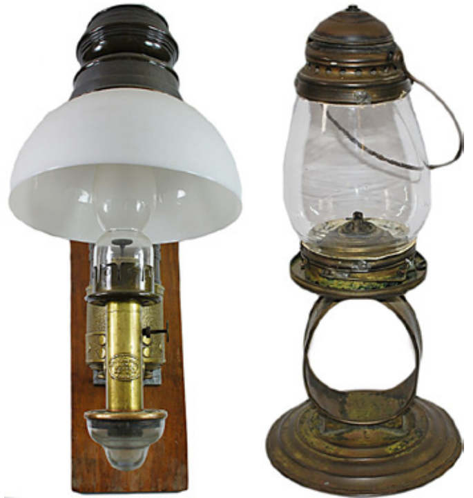
A nicely complete Adams & Westlake wall lamp brought a $500 high bid, while a Blake's Patent lantern sold for $800