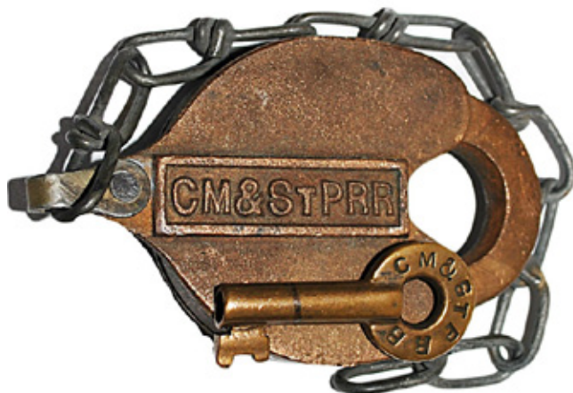
A Chicago, Milwaukee & St. Paul RR "Freight Car" brass heart lock with matching "FC" key sold for a $635 bid.