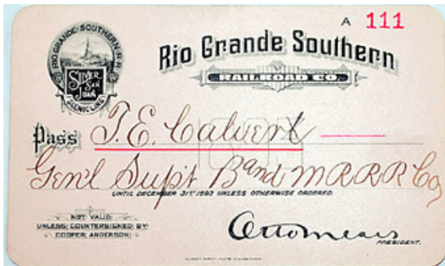
A $2300 bid sent this Rio Grande Southern 1893 annual pass with ornate Silver San Juan logo to a new home.