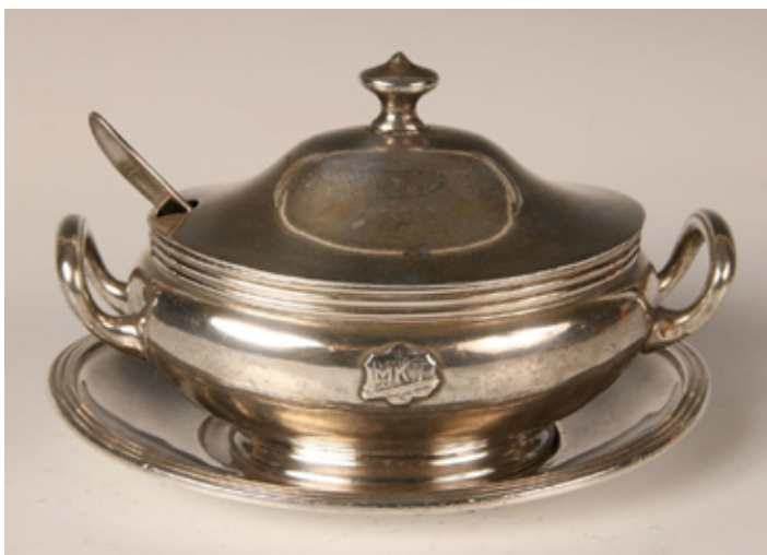
A $140 bid took home this Missouri-Kansas-Texas silver sauce tureen from the Ford Hotel Supply Co.