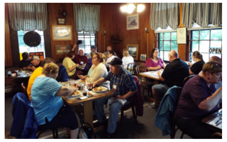
Many KL&L members enjoyed a buffet lunch in the Big Moose Station Restaurant.

After delicious lunches were enjoyed in the station or cafe car, the crew briefly posed the train for photos before the passengers reboarded during a break in the rain. The KL&L Adirondack Express also had the distinction of