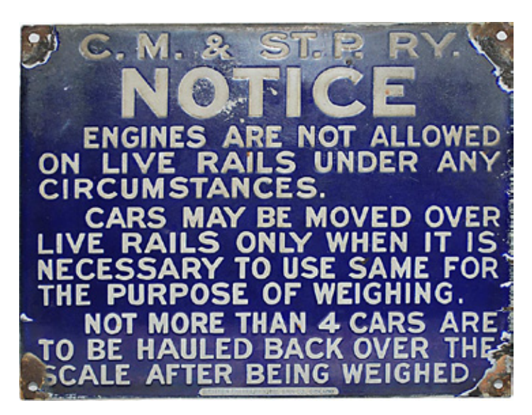
Typical wear on this scale house sign from the Chicago, Milwaukee & St. Paul Railway by the Western Enameled Steel Sign Co. didn't stop it from bringing a $400 bid.