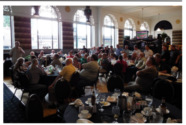
The Key, Lock & Lantern annual banquet returned at this year's convention, with a buffet dinner and railroad history programs at the Trackside Restaurant in Union Station.

tire marks on her dress came from, but this writer disavows all knowledge of it). A few members headed down to the tracks for some photos, while others made their way down to Union Station for a 5:00pm cocktail hour.