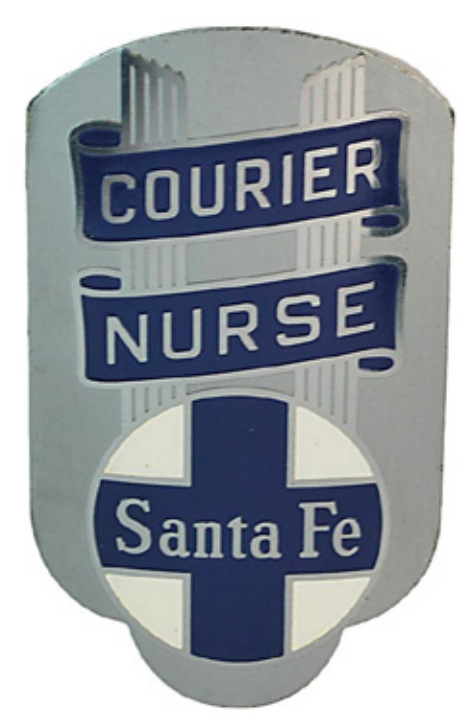
A rare silver with blue enamel Santa Fe logo "Courier Nurse" badge brought a high bid of $1000.