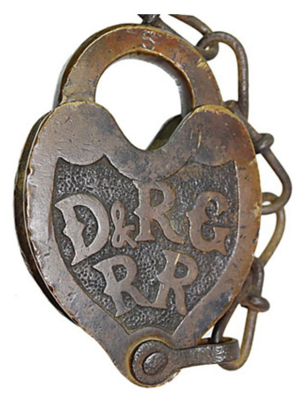
This rare Denver & Rio Grande Railroad fancy cast brass heart lock by Slaymaker sold for a high bid of $2700.