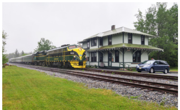
The KL&L Adirondack Express train arrives at Big Moose station, the highest point on the line.

Despite the rainy weather, a photo stop was made on the northbound run, with Adirondack Scenic RR F-unit 1502 on the head end. Arriving at Thendara, the train crew had