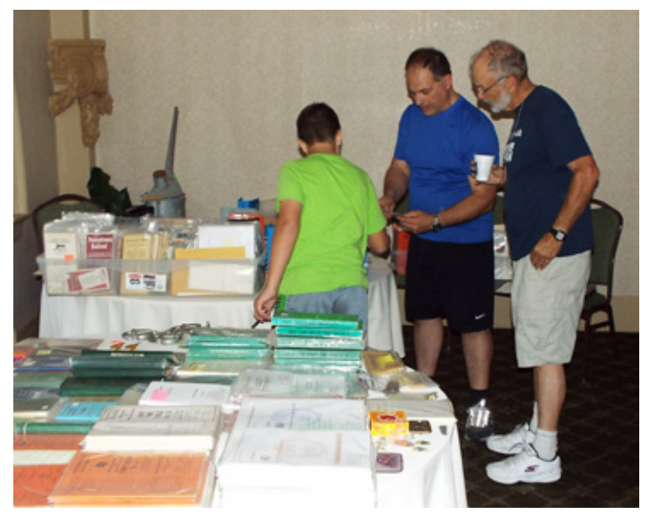
The Key, Lock & Lantern Convention isn't just about hardware. Several dealers of paper and the National Association of Timetable Collectors exhibited at the show.

Loosely termed an "auction," the fundraiser is a fun and lighthearted event where members bid on railroadiana, some good and some that would probably never otherwise change hands. This year's event included more on the "good" side, with several lots bringing relatively high prices. When the good-natured competition ended, collectors went away with some good deals, and the organization had raised several hundred dollars for future projects.