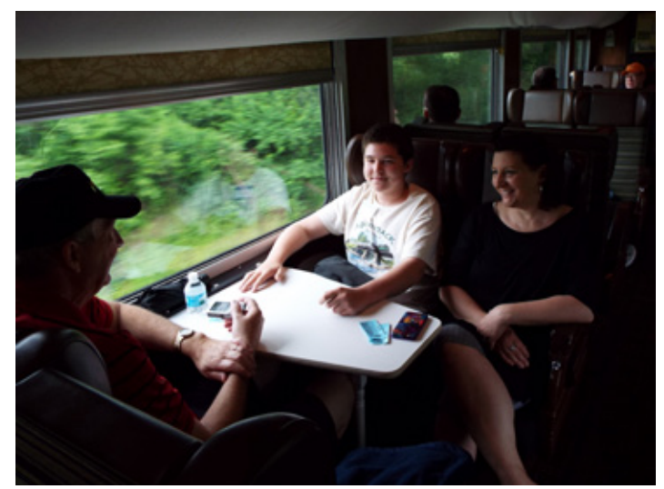
Coach passengers enjoyed the company of fellow KL&L members in former CN equipment.

short delay resulted. The skies began to clear as the train crossed Kayuta Trestle and switched back to the rails of the Mohawk, Adirondack & Northern RR at Snow Junction.