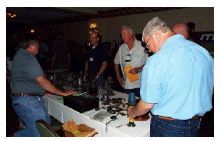
Several members were downsizing, resulting in plenty of new material at the show.