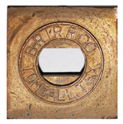
A $340 bid was needed to purchase the Tomball, Texas ticket dater die from the Burlington Rock Island Railroad.