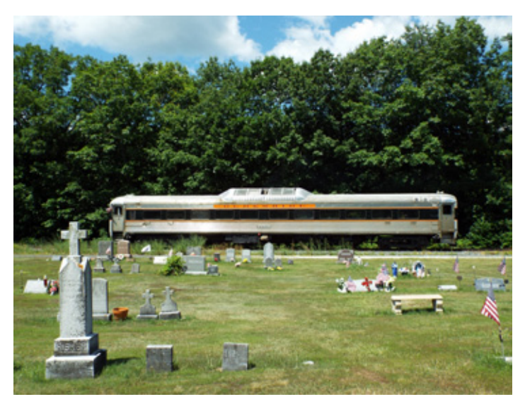
The Hoosac Valley train passes through historic Southview Cemetery in North Adams, MA.

When the museum began planning this new service, it seemed natural to recreate the "Beeliner" train that last ran on the branch. New York Central fans and purists probably won't mind that the BSRM's Budd car was actually built in 1955 for the Boston & Maine Railroad, where it likely made