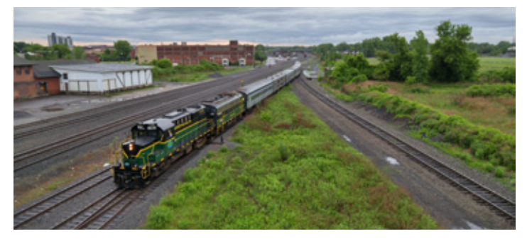
The KL&L Adirondack Express arrives back at Utica Union Station in time for Amtrak connections.

The train's arrival back in Utica was only slightly later than planned, allowing members who were connecting to Amtrak train #288 plenty of time to get over to the track 2 platform. Many convention attendees who were spending the night in Utica headed across the tracks to Babe's Grill for dinner, where several hours of discussion on railroad topics took place. After seeing off the passengers who were making a