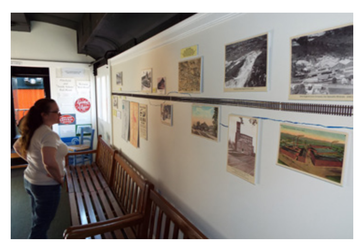
Displays about local railroad history are housed in a remodeled coach in North Adams.

At a leisurely 10mph, passengers have plenty of time to enjoy the passing scenery, which consists of imposing mountains (the Hoosac Tunnel is only a short distance away on the B&M mainline), meandering rivers, and historic buildings. Enthusiasts of modern railroad operations have the opportunity to view current Pan Am freight customers,