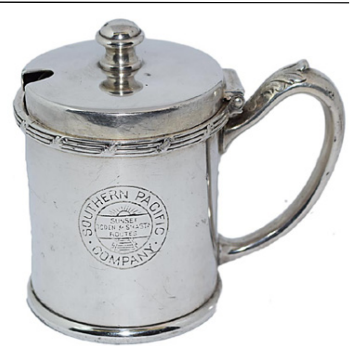
A $625 high bid took home this Southern Pacific Company sunset logo International Silver mustard pot.