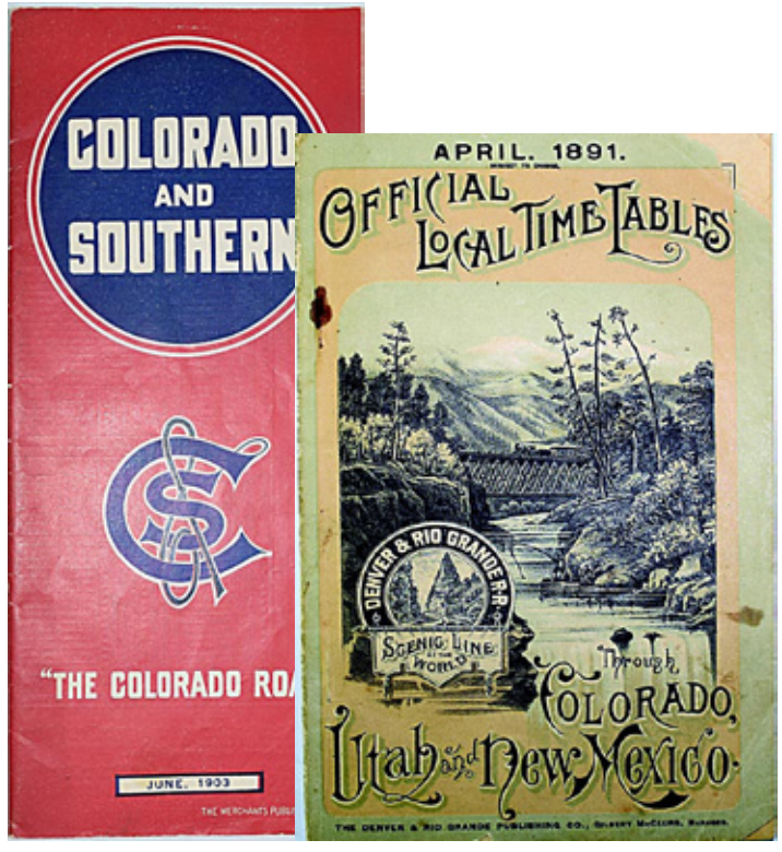
The auction also included several lots of scarce paper, such as a 1903 Colorado & Southern timetable ($675) and Denver & Rio Grande 1891 timetable & guide ($1050).

KEY LOCK & LANTERN Can Help Promote Your Auction, Show or Event Contact KL&L at transportsim@aol.com