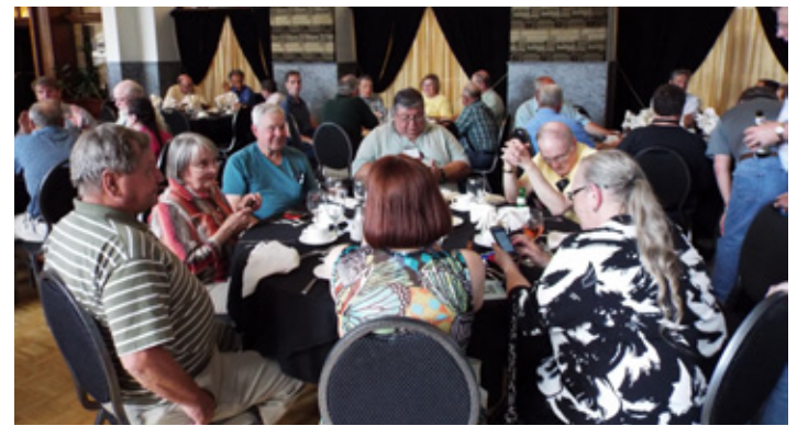
Delicious food and good company at the 2016 Key, Lock & Lantern Convention annual banquet..

Last year's convention saw the return of a Saturday evening dinner event, as a stop on the KL&L Boonville Dinner Express train on the Adirondack Scenic Railroad. This year, the convention committee brought back the annual banquet dinner, holding it at the Trackside Restaurant in the historic Utica Union Station. An ample buffet meal was served, as Amtrak and CSX trains rolled by outside the window.