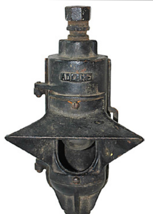
Something a little different - this 10" Adlake cast iron electric gauge lamp sold for a high bid of $360.