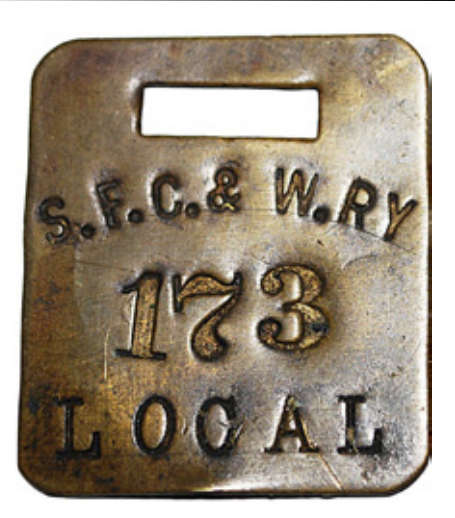
A high bid of $230 was needed to buy this Salem Falls City & Western Railway "Local" brass baggage tag.