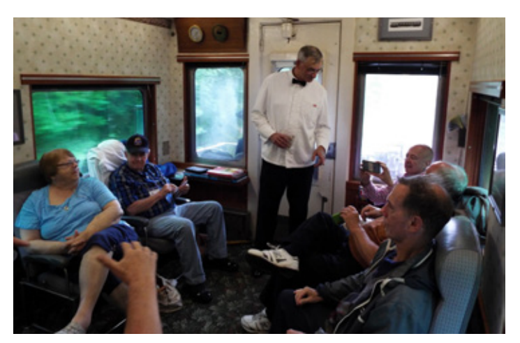
First Class passengers enjoyed observation lounge seating and Pullman-style service.

Following the Moose River, the train passed through remote areas of the Adirondack wilderness, over high trestles and through rock cuts. Many original New York Central stations