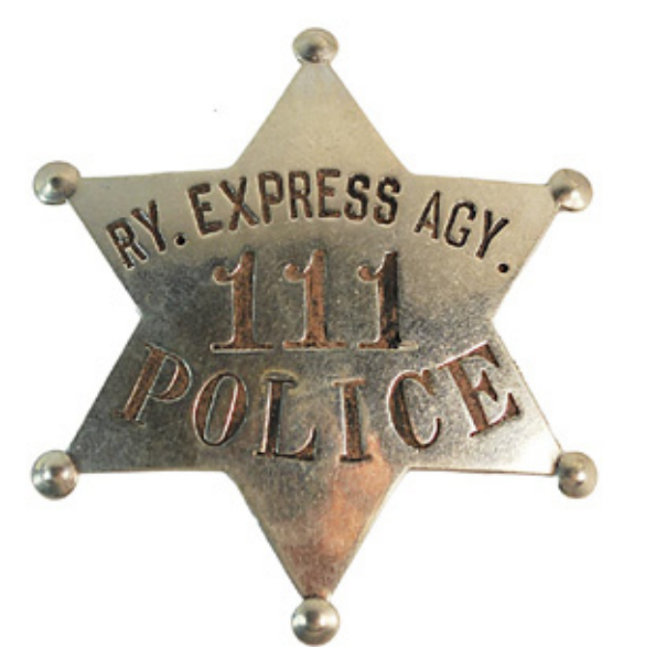
A $320 bid was need to purchase this Railway Express Agency Police badge by Meyer & Wenthe of Chicago.

The Railroad Memories catalog & online auctions always include a nice selection of memorabilia, with a focus on western roads, and the recently held sale #95 was no exception. As usual, scarce railroadiana from Colorado was the star of the show, but other lines from around the country were well represented as well. Auction #96, which closes on September 11th, has many more excellent lots, so it will be interesting to see the results of that sale. All photos, prices, and descriptions courtesy of Railroad Memories Auctions. Prices do not include buyers premiums or shipping.