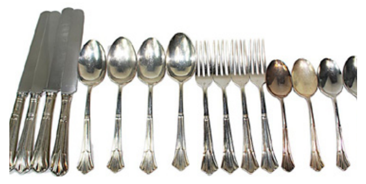
A $210 high bid took home this place setting for four of Santa Fe Albany pattern silverware by International.