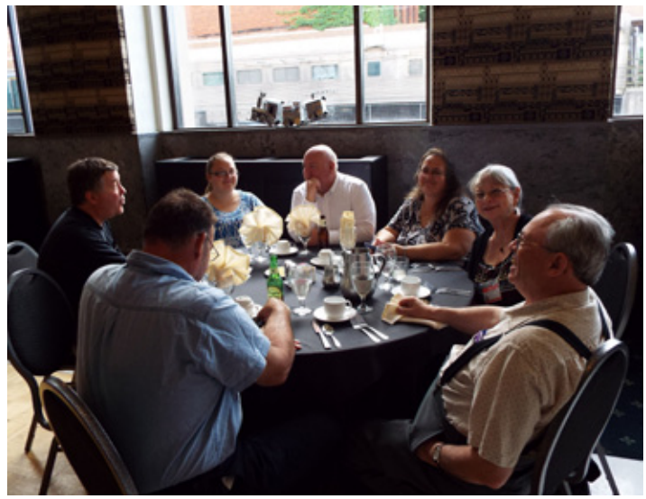
KL&L News - Page 24

Back east, the Penn Central Railroad Historical Society will hold its annual convention at Buffalo's Heritage Discovery Center from September 22-24. In addition to displays and