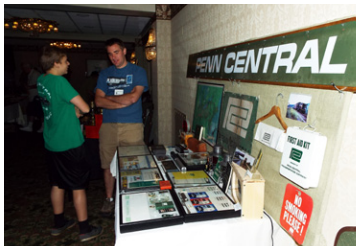
Many exhibits explored specific topics, including this excellent Penn Central display.

Of course, the Railroad History Exposition is more than a railroadiana show - Key, Lock & Lantern members present museum-quality exhibits about transportation and industrial history, and this year's convention included a variety of