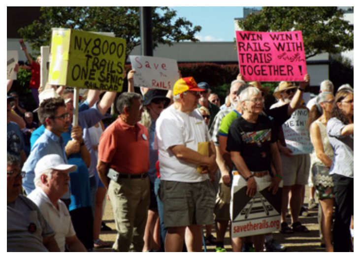
KL&L members attended a Friday afternoon rally in support of the Adirondack Scenic's efforts to restore train service between Utica & Lake Placid.

On Saturday morning, KL&L members who were staying at the Hotel Utica enjoyed an excellent breakfast buffet before preparing for the show. Once again this year, the Saranac Room was filled with exhibitors and over a dozen