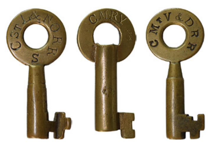
More switch keys: Chicago, St. Louis & New Orleans RR by Slaight ($500), Colorado Midland ($420), Cleveland, Mount Vernon & Delphos RR by Romer & Company ($360).

This Minnesota & Northwestern RR wax sealer from the Dyersville, Iowa station went to a new home for $360.