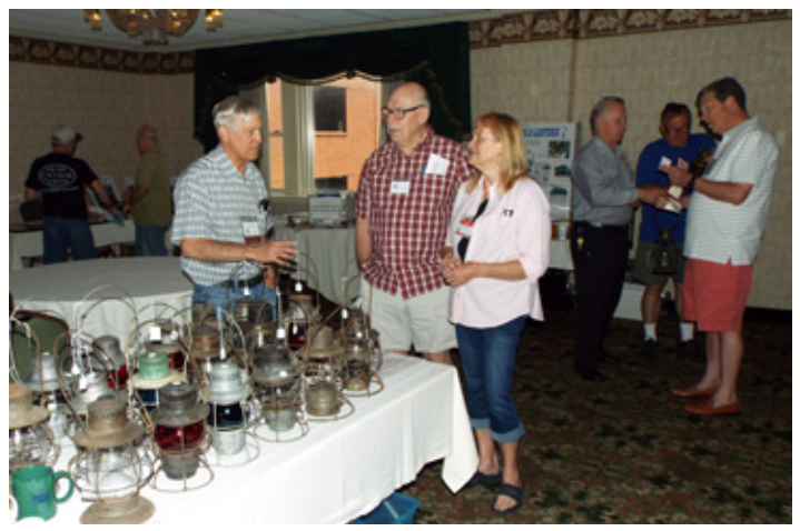
While plenty of memorabilia changes hands, the best aspect of the KL&L Convention is the chance to visit with other historians & collectors.