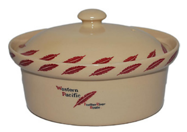
A nice Western Pacific Feather River Route logo casserole dish by Shenango brought a $500 high bid.