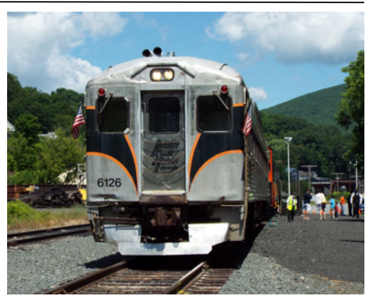
Passengers board the restored B&M RDC car at North Adams, MA for a one hour roundtrip on a former NYC branch to Renfrew Station in Adams.

and entertaining narration by BSRM's onboard volunteers provides extensive background information about railroading and local sights. Numerous round trips and slow speeds also make it easy to both ride the train and chase other runs.