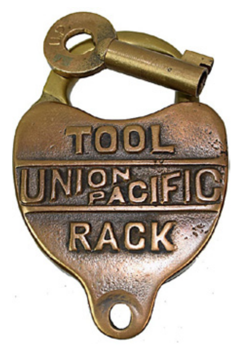
A scarce Union Pacific "Tool Rack" bras heart lock with a UP marked key sold for a high bid of $675.