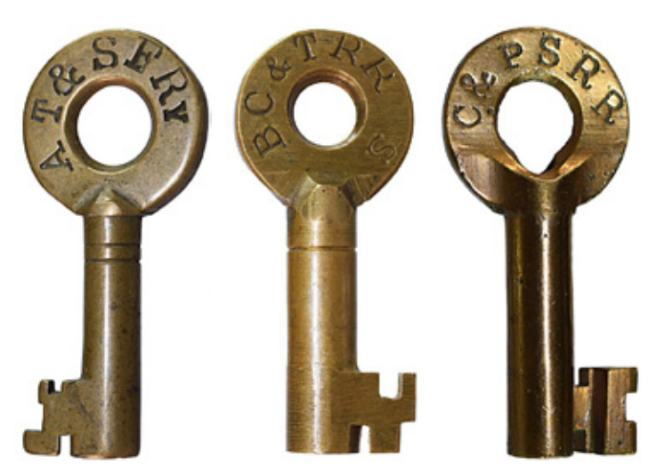
Some of the many scarce & unusually marked switch keys in the sale: Atchison Topeka & Santa Fe ($360), Big Creek & Telocaset ($250), Columbia & Puget Sound ($140)