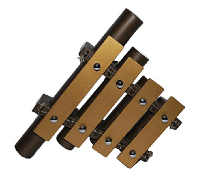
This example of the classic J.C. Deagan dining car chime was missing its mallet, but still brought a $260 bid.