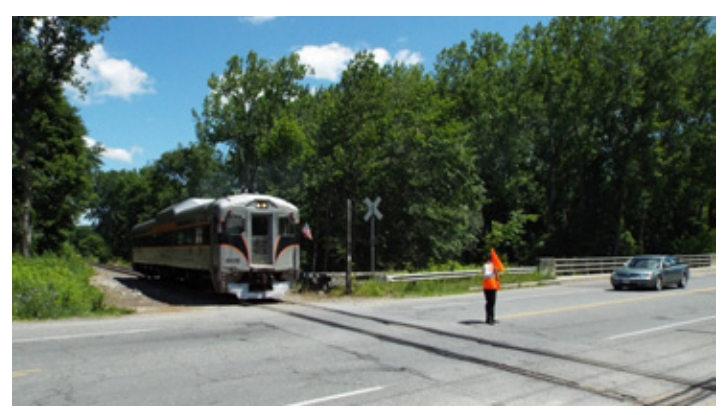
Chasing the train is easy, with slow speeds, stops to flag crossings, and several round trips.

With a relatively short ride through the scenic countryside and historic railroad equipment, this trip is an excellent one to bring along family members, while remaining enjoyable for serious railroad history buffs. Trains operate on weekends