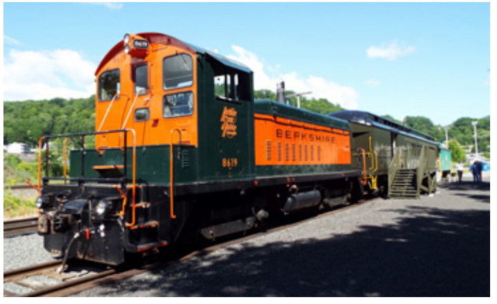
A coach and caboose provide a temporary home for the BSRM ticket office and museum at North Adams, until a recreation of the depot is built.

After several years of work, the Hoosac Valley train made preliminary demonstration runs over Columbus Day weekend in 2015, before opening for regular service in the 2016 season. A refurbished coach provides a ticket office and small museum at North Adams, until a proposed recreation of North Adams Union Station is built. The Beeliner operates on a one hour round trip to Renfrew Station, just outside of Adams. Future plans call for an extension into the heart of