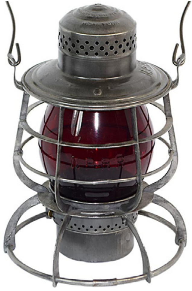
A nicely cleaned Northern Pacific Armspear lantern with "NPRY" markings on the frame and a hard to find red cast "NPRR Safety Always" globe sold for a $420 bid.