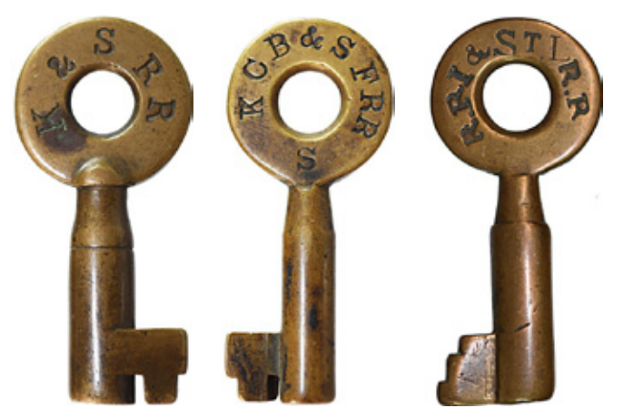
More unusually marked keys: Kansas & Southern RR ($300), Kansas City Burlington & Santa Fe RR ($400) and Rockford, Rock Island & St. Louis RR ($360).