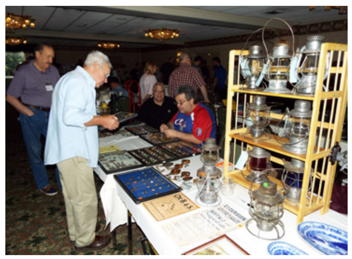
KL&L members found plenty of new material for sale at this year's Railroad History Expo, much of which changed hands before the show opened .

The Railroad History Exposition opened to non-members at 10am, with a large crowd of local collectors and railroad buffs lining up to see the exhibits and look through dozens