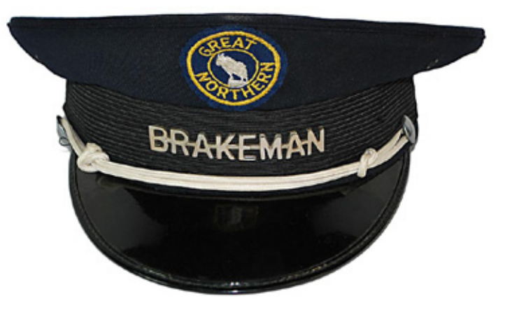
A high bid of $120 took home this Great Northern cap with an embroidered patch and nickel "Brakeman" badge with rope braid & GN buttons, made by Carlson & Company.