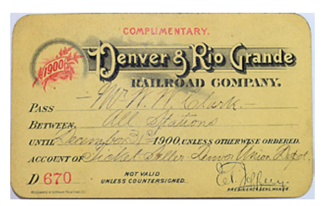
An $800 bid took home this Denver & Rio Grande 1900 annual pass issued to Denver ticket seller WW Clark.