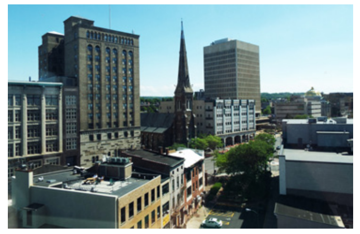
The view of downtown Utica, NY from KL&L Convention headquarters at the Hotel Utica.

Many KL&L members arrived in the area as the sun came up on Friday, to be among the first to enter the showfields at the nearby Madison-Bouckville June Antique Show. There were several railroadiana "finds" reported at the show, which