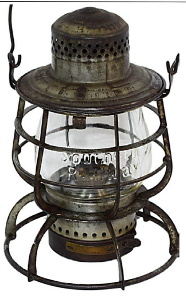
A high bid of $850 was needed to buy this SRY Armspear lantern with a clear cast Southern Railway tall globe.