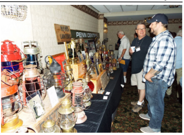
The KL&L Railroad History Expo included many excellent exhibits by KL&L members.

of tables of railroadiana offered for sale or trade. Several collectors were in the process of downsizing, so there was plenty of material that had not been seen at recent shows, including a large collection of keys, a variety of lanterns, and a huge selection of parts.