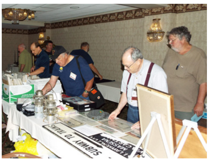
A variety of railroad memorabilia was displayed or offered for sale & trade at the Railroad History Exposition.

Lunch was then served in the mezzanine, sponsored by the New York-Pennsylvania Collector magazine, a long time supporter of Key, Lock & Lantern. After a long morning of making deals and viewing displays, everyone enjoyed a