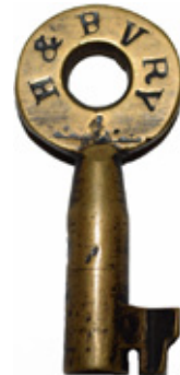
H&BVRY Key Price Realized $1600