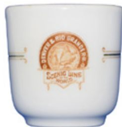
D&RG Demi cup Price Realized $3300