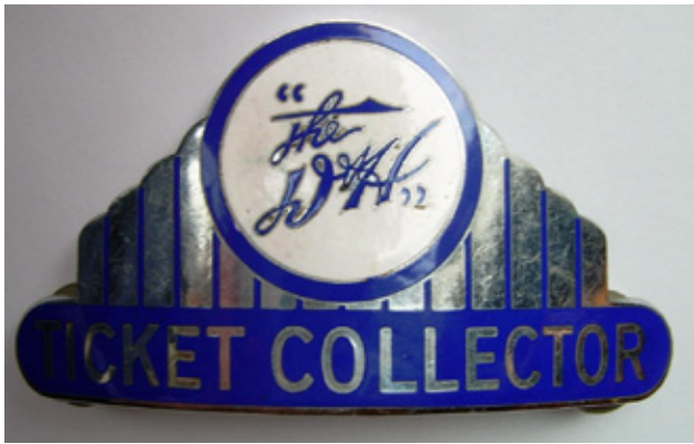
Several Delaware & Hudson badges were sold in the auction, with this Ticket Collector example bringing $150.