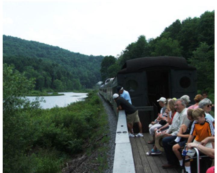
The regular excursion trains on the Delaware & Ulster feature former PRR open-window commuter coaches and open-air cars which offer views of the Catskill scenery.