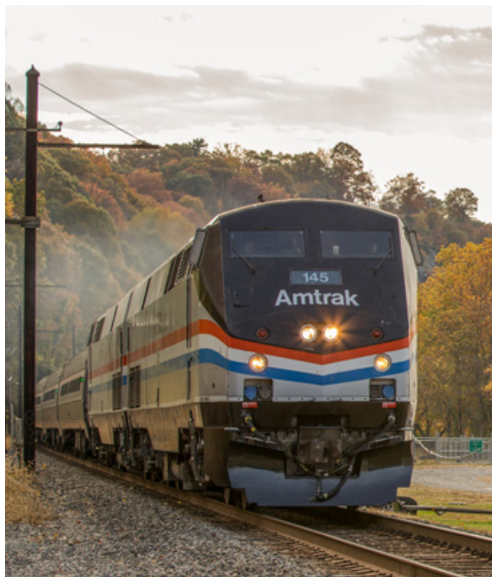
The Amtrak Autumn Express train carries passengers on rare mileage trips each fall.

The train will pass such landmarks as Bear Mountain Bridge, Storm King Mountain, the U.S. Military Academy at West Point, Newburgh, and the Poughkeepsie Bridge. It will head inland, passing through Kingston and smaller communities like Catskill, Athens, and Ravena. After reversing direction again before crossing the Hudson on the Alfred H. Smith Memorial Bridge at Castleton. Once over the bridge, it will descend down onto the Amtrak Hudson line for a scenic 112-mile run down the east shore of the Hudson River on the classic ex-NYC Water Level Route. Highlights include Hudson, Rhinecliff, Pollepel Island (Bannerman's Castle), Break Neck Tunnel, and Peekskill. Finally, the Autumn Express will cross the Spuyten Duyvil moveable bridge and follow the Amtrak Empire Connection the final 12 miles to New York Penn Station.