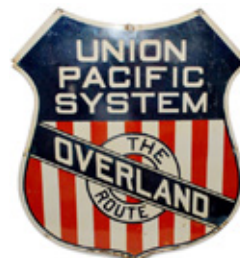
Union Pacific Sign Price Realized $1400