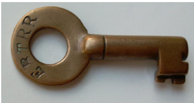
A $230 high bid was needed to purchase this East Broad Top Railroad switch key with a Frain keystone hallmark.