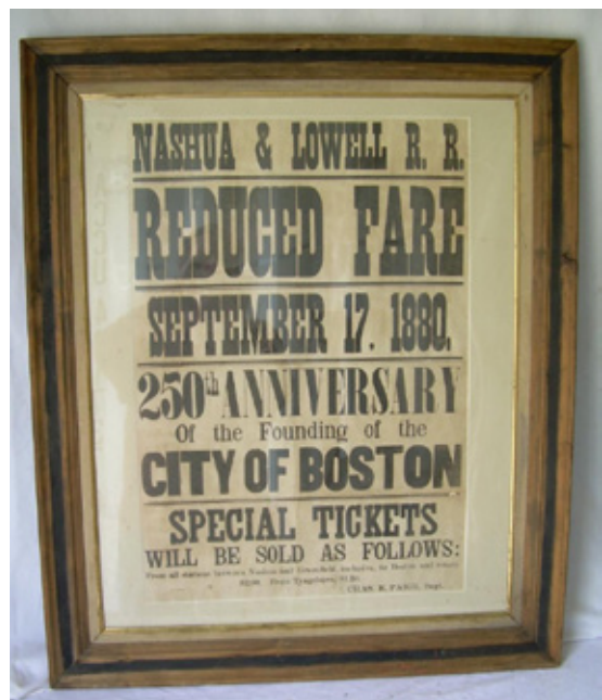
A Nashua & Lowell broadside announcing tickets for the 250th anniversary of the founding of Boston sold for $140.