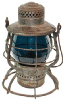
Great Northern Green Cast Globe $4900

I have had the pleasure of selling many amazing pieces over the years and have proudly realized record prices! Below is just a sample of some of the stars sold in my most recent auctions. I am approaching Auction 100 and plan on opening that issue in December 2017 with a closing date in early January 2018. If you are interested in consigning any quality pieces to this historic auction please contact me.