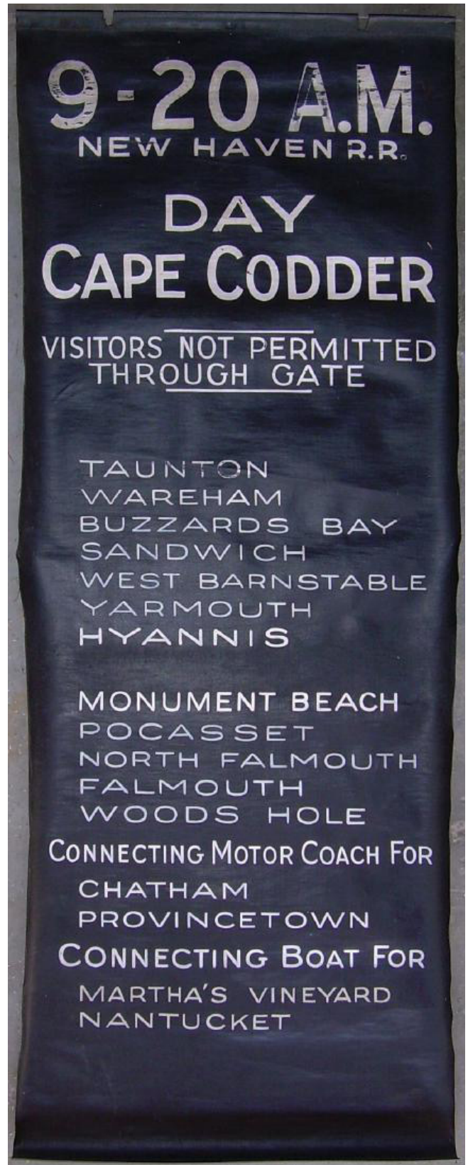
A $325 bid was needed to purchase this canvas gate sign from Boston South Station, announcing the stops on the New Haven Day Cape Codder to Hyannis & Woods Hole