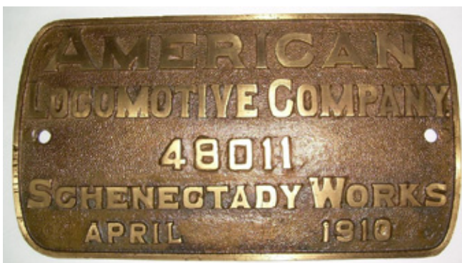
The builders plate from Rutland Railroad 2-8-0 consolidation #14, built by Alco in Schenectady in 1910, went to a new owner for a high bid of $1700.