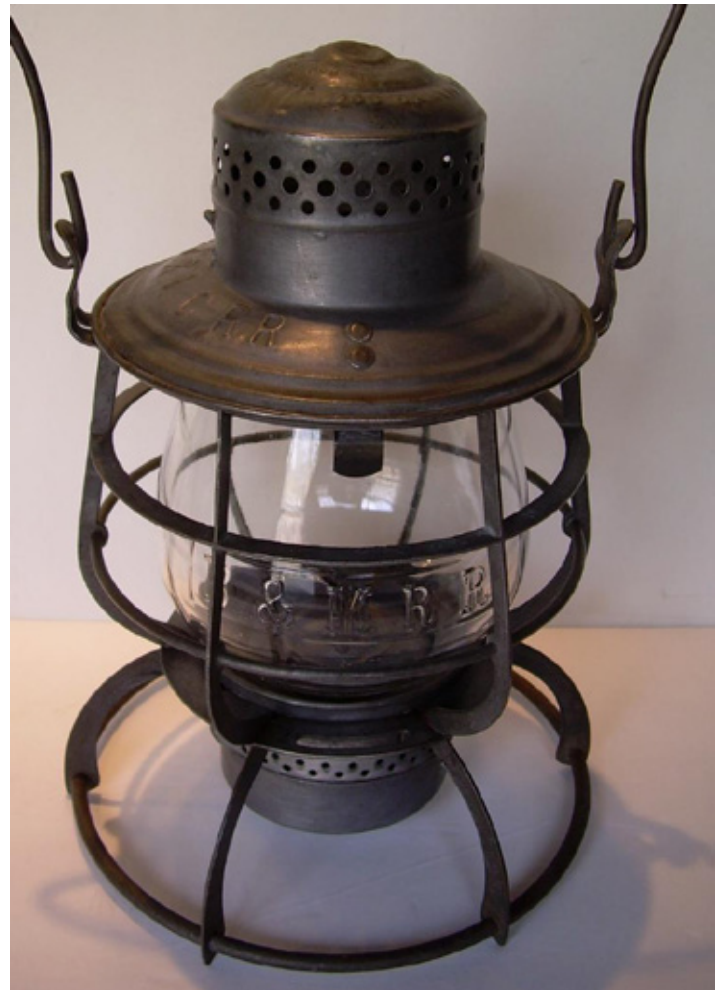
A St. Johnsburry & Lamoille County Railroad lantern with a clear cast Boston & Maine RR globe sold for $1000.