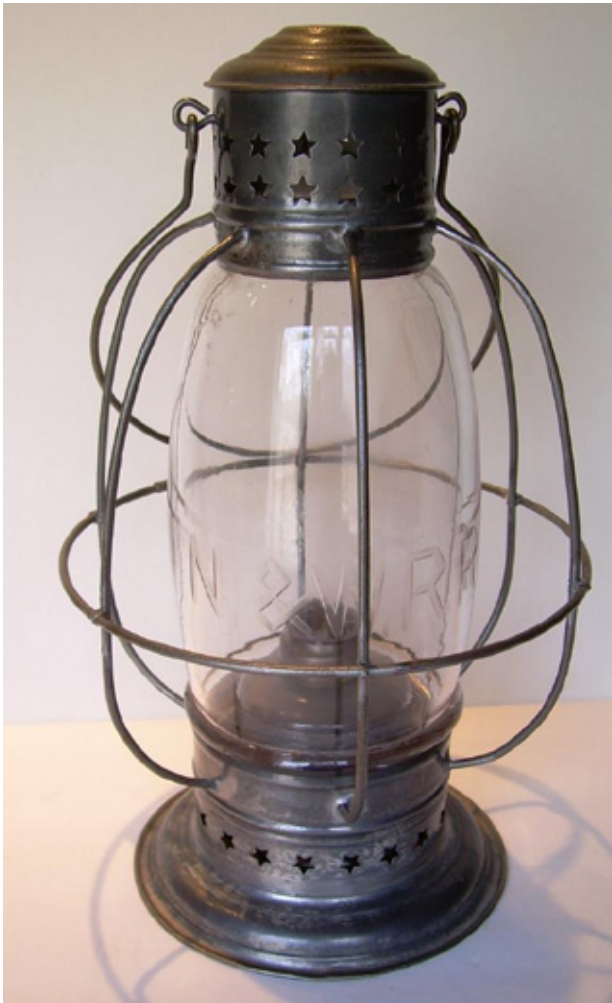
A $700 bid took home this nice fixed globe lantern with wire guards, cut for the Norwich & Worcester Railroad.