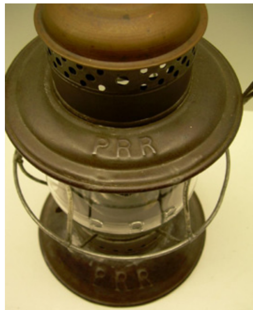
A $600 bid was needed to purchase this triple-marked PRR lantern by Kelly of Rochester, with a clear cast globe.