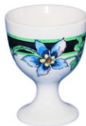
UP Egg Cup Price Realized $3600