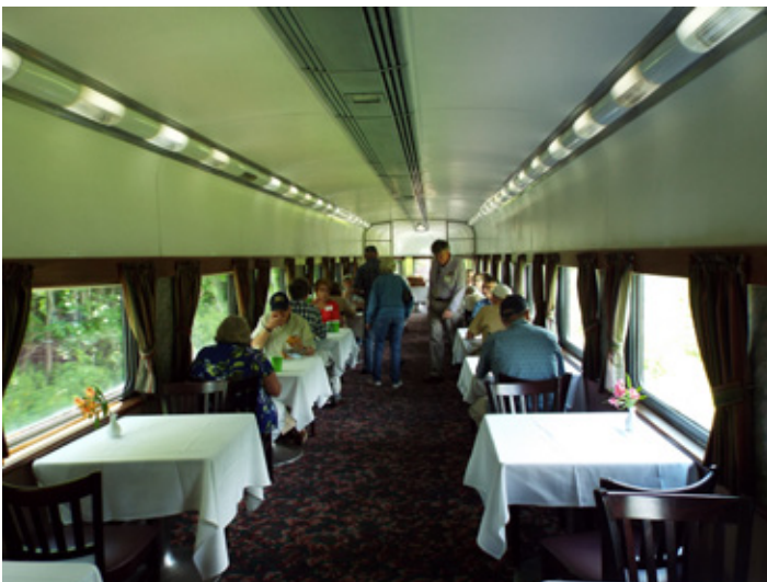
Passengers enjoy a meal in the Rip Van Winkle Flyer trainset's observation lounge car, which has been converted to also include dining car seating.