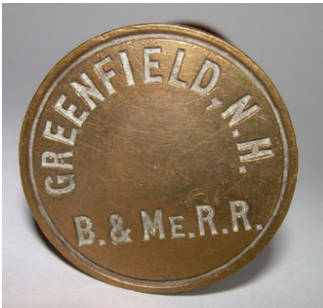
The wax sealer from the Boston & Maine Railroad Greenfield, NH station sold for a high bid of $275.

The Spring 2017 edition of the Brookline railroadiana auction included additional memorabilia from several collections that are being sold in installments, along with a variety of individual consignments. From passes to lanterns, all types of railroadiana were represented, with more to come in the September sale. Scarce artifacts continue to command top dollar, and even the more common collectibles brought strong results, as well. Although the general antiques market seems to remain soft, there is obviously still demand for higher quality railroadiana. All photos, descriptions, and prices realized courtesy of Scott Czaja at the Brookline Auction Gallery.