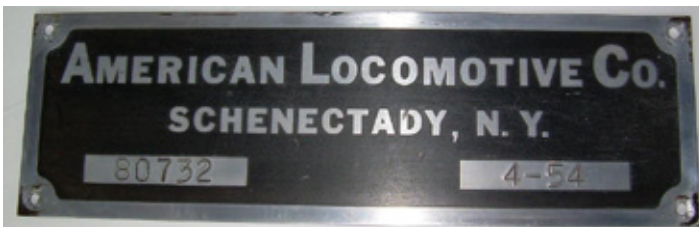
The Alco Schenectady builders plate from a Boston & Maine Railroad RS-3 diesel sold for a $700 bid.