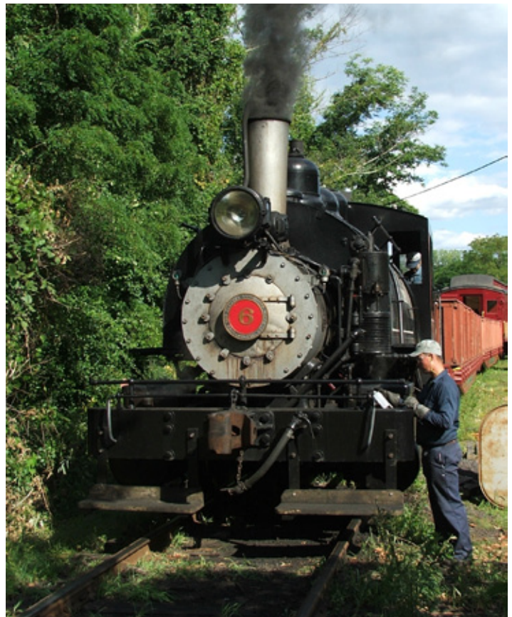
Viscose #6 steam locomotive will pull trains on the D&U over the weekend of September 30th & October 1st.