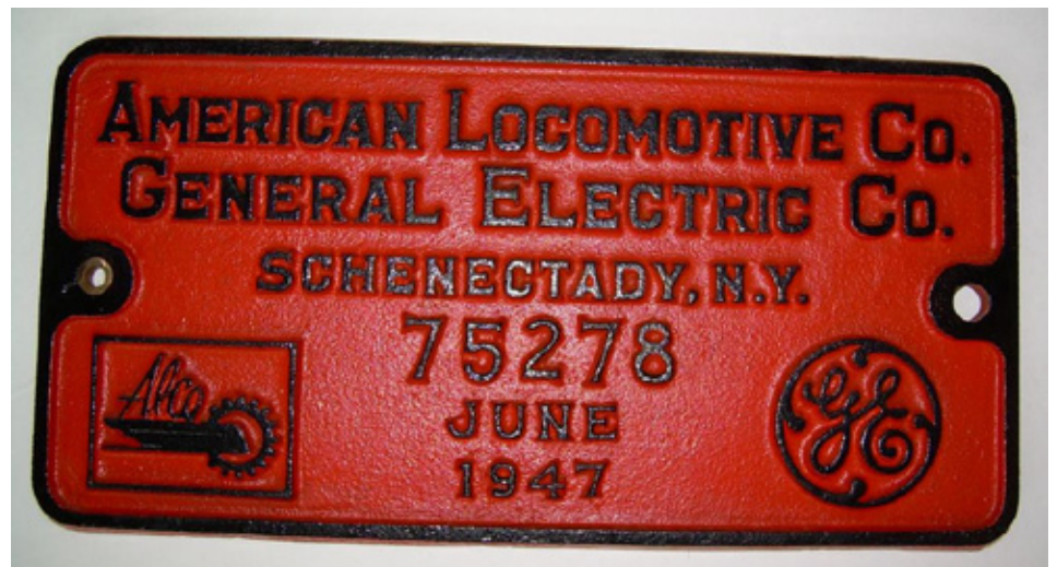
Above, an Alco - General Electric builders plate from New Haven Railroad FA diesel #0403 sold for a $750 high bid. At left, a huge Crosby Steam Gauge & Valve Company 21" high and 6" diameter steam whistle brought $600