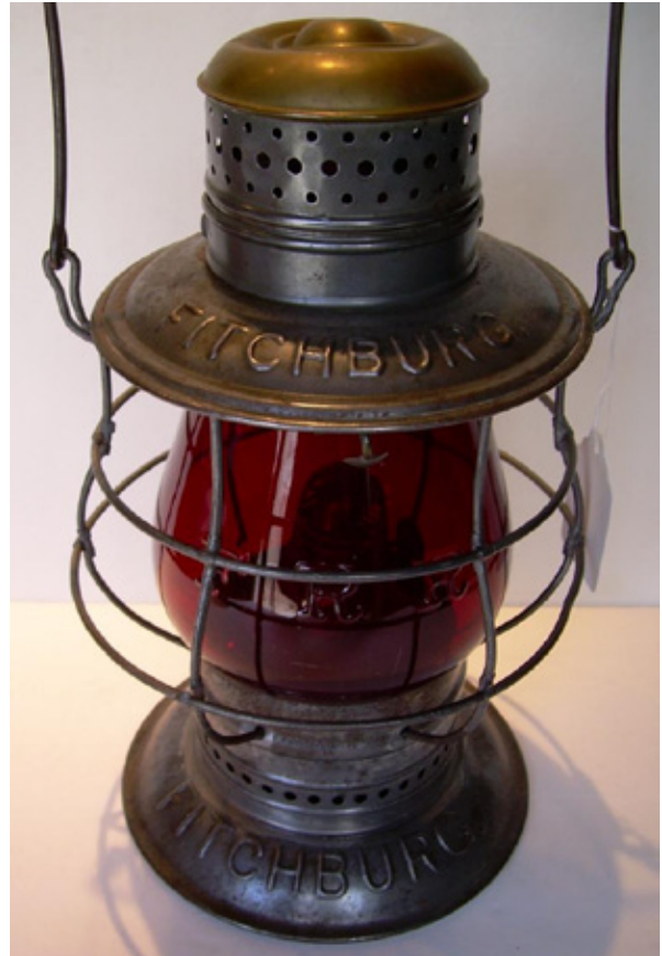
An $850 bid took home this triple-marked Fitchburg Railroad lantern by the Steam Gauge Lamp & Lantern Company with a red flashed globe marked "FRR."