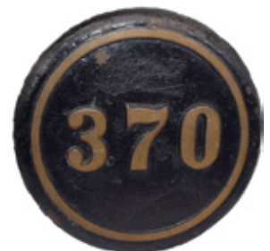
Colorado & Southern- Price Realized $3100