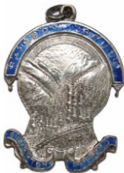
Silver Otto Mears Pass Price Realized $7250