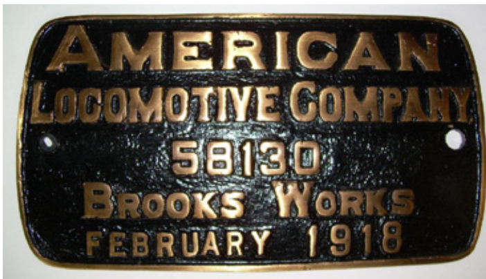
The builders plate from New York Central 4-6-2 steam locomotive #3355, built at the American Locomotive Company Brooks Works in 1918 sold for a $600 bid.