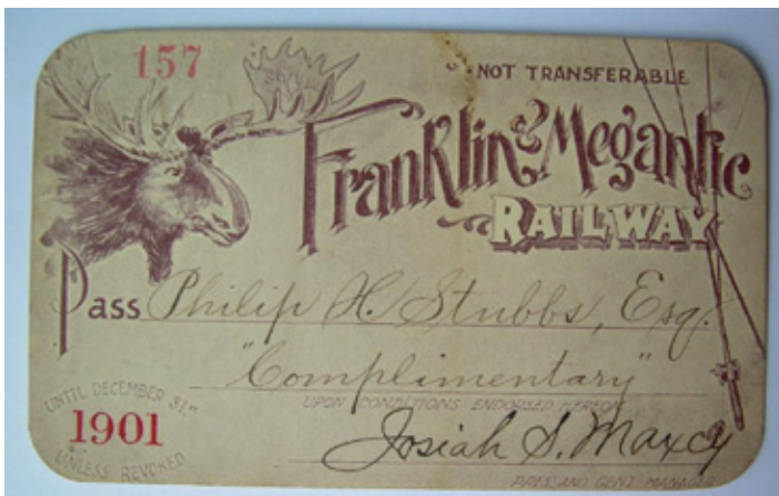
Another nice pass with a "moose and fishing gear" theme, this example from 1901 was issued by the Maine two-foot gauge Franklin & Megantic Railway and sold for $300.