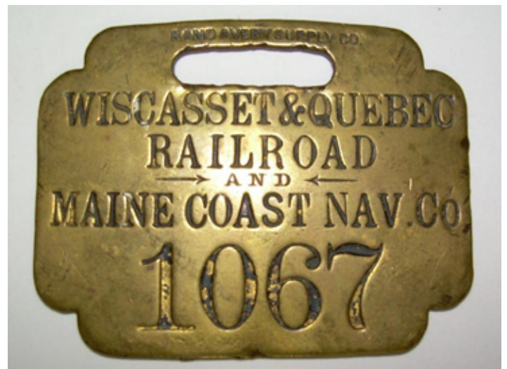
A $200 bid took home this baggage tag for travel between the Maine Coast Navigation Company's steamboat and the Maine two-foot gauge Wiscasset & Quebec Railroad.