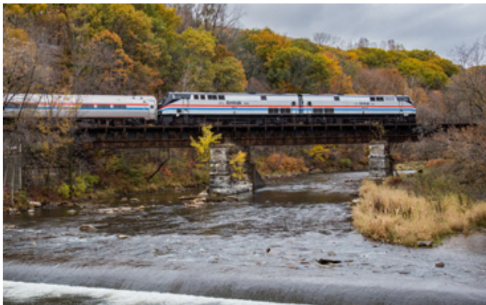
An Amtrak Autumn Express crosses the Hoosac River on the former Boston & Maine Railroad mainline in North Adams, MA.

This year's Autumn Express will travel along one of the best rail journeys on the East Coast as it travels up and down the scenic Hudson River Valley. The excursion train will depart New York Penn Station, passing underneath the Hudson River and stopping in Newark, New Jersey to accept passengers and making a transition from electric to diesel power. After Newark, it will change directions and head toward Jersey City for a quick glimpse of the New York Harbor before heading north. It will arrive on the west bank of the Hudson River just below Haverstraw, where passenger trains have not run in decades.