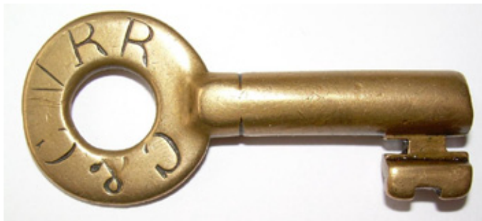
A $130 bid was needed to buy this switch key from D&H predecessor Cooperstown & Charlotte Valley Railroad.