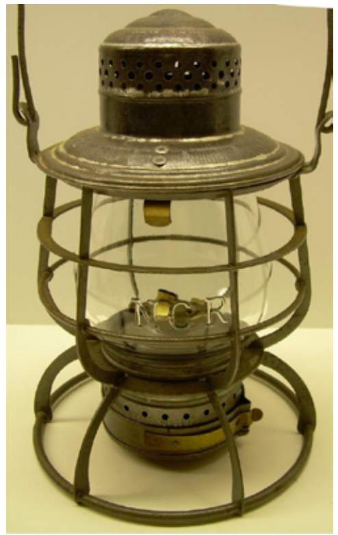
A Concord Railroad brass top bell bottom by Parmelee & Bonnell with red cast globe ($650), Portland & Rumsford Falls Railway A&W with clear cast globe ($950) & Northern Central Railway by Armspear with a clear cast NCR globe ($550).