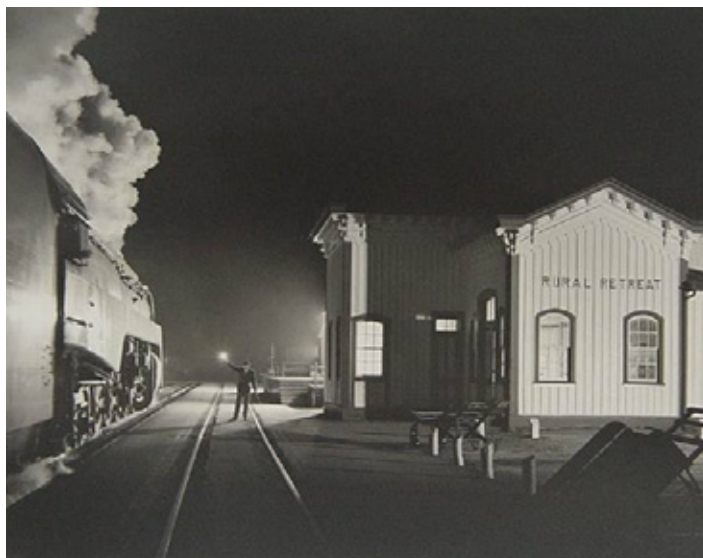
The Rural Retreat, Virginia station was made famous as the subject of one of O. Winston Link's iconic photos.