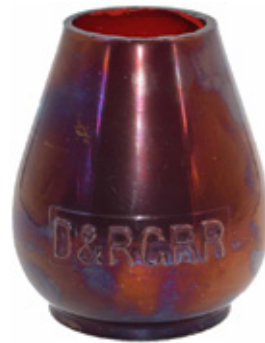
D&RG Red Cast Globe- Price Realized $5750