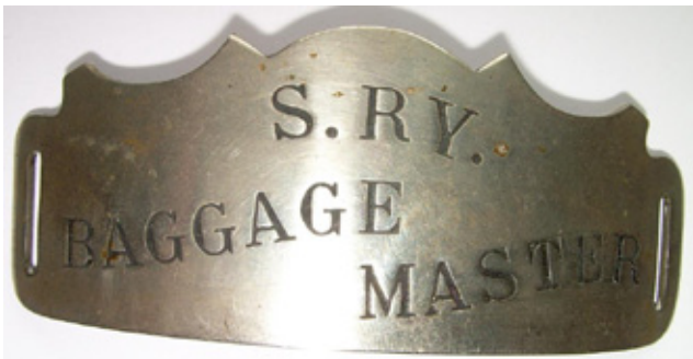
A $140 bid took home this Baggage Master cap badge from the Schenectady Railway electric trolley line.