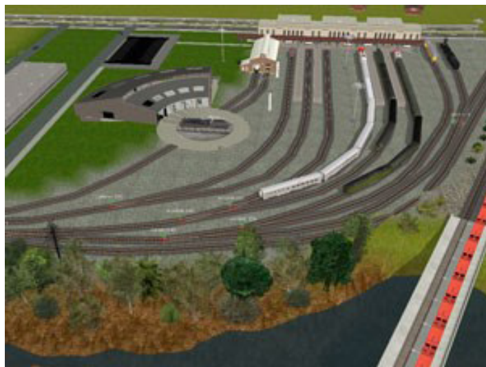
Construction on the new home of the Museum of the American Railroad in Frisco, Texas is well underway.

Frisco Heritage Museum approximately 15 minutes prior to your tour. Visitors can browse the Museum store at the Heritage Museum, which features railroad themed gifts, collectibles, books, and electric train sets for all ages. For more information, call 214-428-0101 or visit the museum website at www.museumoftheamericanrailroad.org .