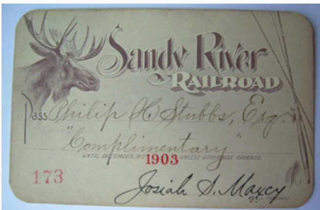
A nice 1903 pass from the Sandy River Railroad with a moose & fishing gear vignette sold for a $300 bid.