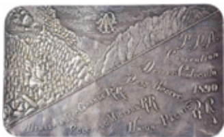
TPA Silver Pass Price Realized $3200