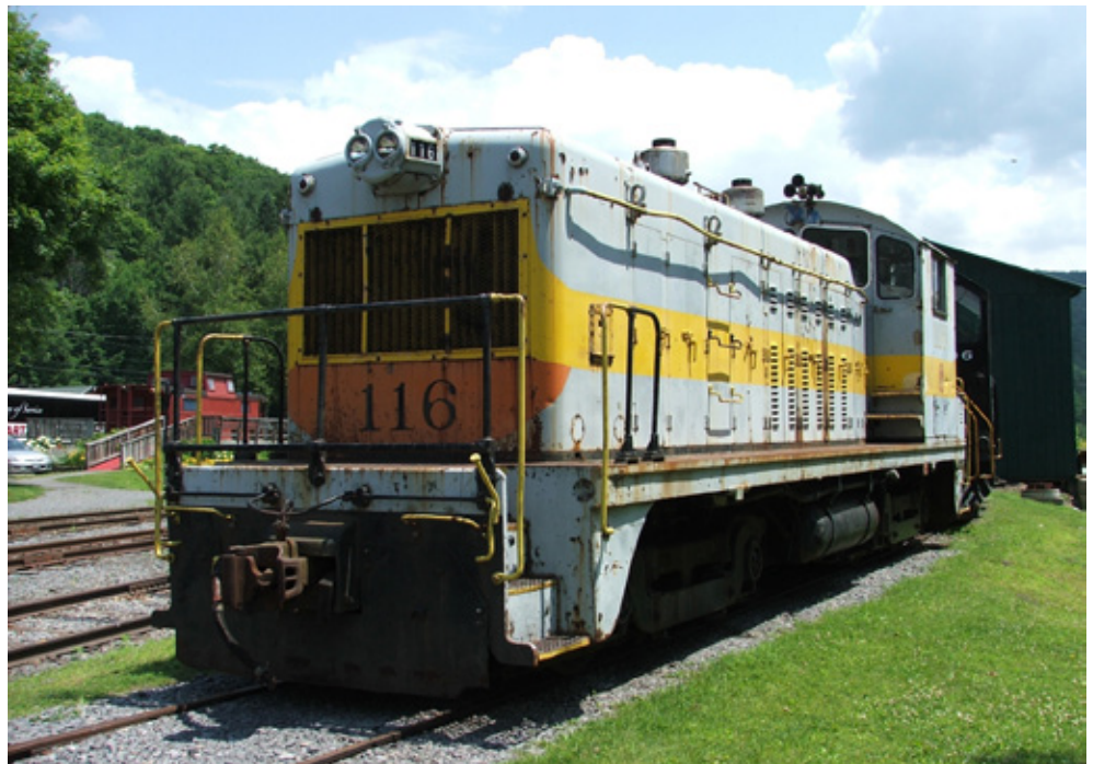
New York Ontario & Western NW2 #116, which had been restored in the 1980's for service on the Susquehanna Railway, has been in retirement at the Arkville museum. After extensive work this summer, the unit will soon return to service on Delaware & Ulster Railroad excursion trains.

The exhibits in the Roxbury depot are also worth visiting during the excursion train's layover. Railroadiana from the Ulster & Delaware Railroad (which is obviously rather