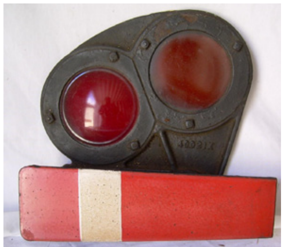
A $275 bid took home this 14" dwarf signal style semaphore blade, complete with lenses.