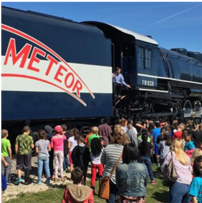
Visitors enjoy guided tours of the museum's collection of rolling stock while construction on the new site continues.

Admission is $8 for adults and $4 for children ages 3-12, and includes the Railroad Museum's 2nd floor exhibits at the Frisco Heritage Museum. Please pay admission at the