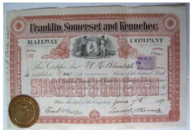
A $240 bid took home this unusual Franklin, Somerset & Kennebec Railway stock certificate from the never completed two-foot gauge railroad in Maine.