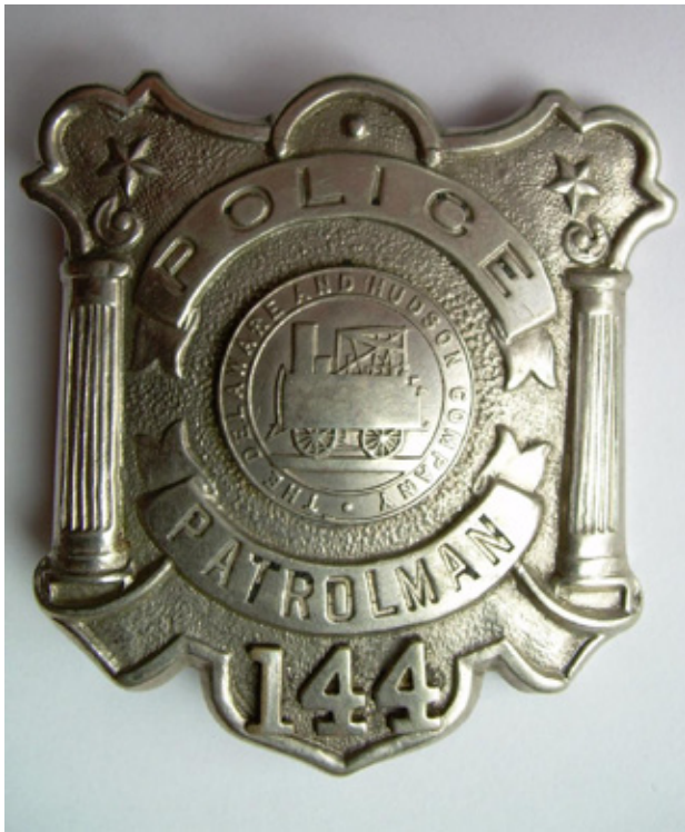
A Delaware & Hudson railroad police Patrolman badge by Braxmar with Stourbridge Lion logo sold for a $180 bid.