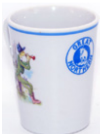
GNRY Dwarf Cup Price Realized $1300