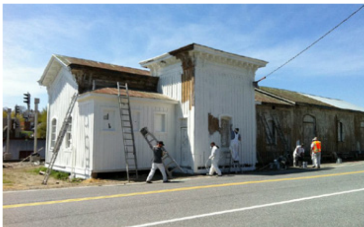
After falling into disrepair over the years, the Rural Retreat, Virginia station has been restored by local volunteers.

The ceremony will be held outdoors, so bring a lawn chair if you wish to sit. Admission is free, and registrants will receive a commemorative ribbon and program. For more information and updates check out the museum website at www.theruralretreatdepot.com or on their Facebook page. The program will be held rain or shine.