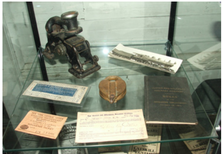
Scarce railroadiana from the Ulster & Delaware Railroad is displayed in the museum inside the Roxbury depot.