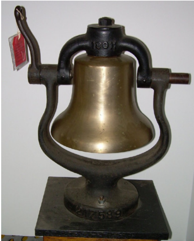
The 16" high (with yoke) bell from a New York, New Haven & Hartford 9100-series gas car built by J.G. Brill in 1926 or 1927 went to a new home for a high bid of $650.