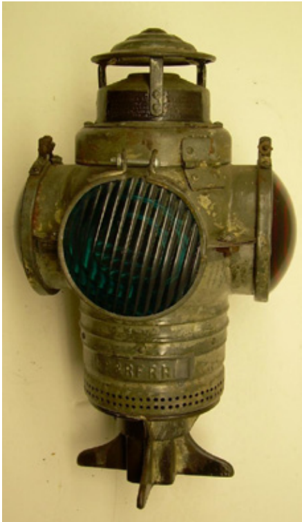
A Portland & Rumsford Falls Railroad (P&RF RR on an applied tag) switch lamp sold for a $300 high bid.