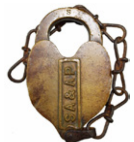
SA&AP Cast Lock Price Realized $1250

P.O. Box 415 Georgetown, Colorado 80444 Phone: 303-569-5185 Fax: 303-569-5186 www.railroadmemories.com email: railroadmemories@gmail.com