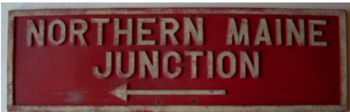
An $800 bid was needed to purchase this 39" cast entrance road sign from Northern Maine Junction on the MEC/BAR.