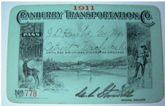
A $45 high bid took home this 1911 annual pass from Adirondack steamboat Cranberry Transportation Co.