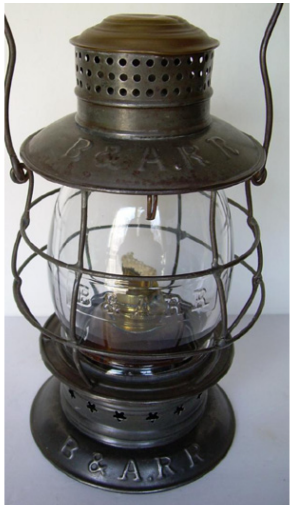
A nice triple-marked Boston & Albany lantern by the New England Glass Company sold for a $1300 high bid.