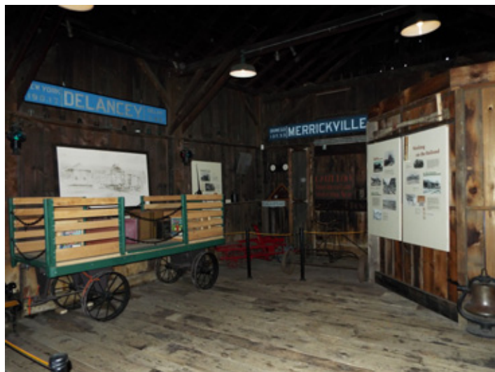
The Arkville Depot Museum contains exhibits of local railroad and historical memorabilia.