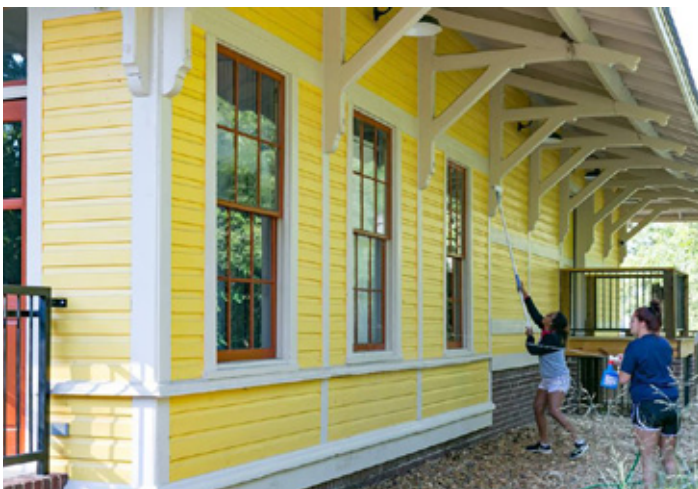
Students from the Tusculum College Museum Studies program joined local volunteers in restoring the Chuckey Depot and installing historical exhibits.

The ribbon cutting will celebrate the contributions of WC Rowe to Jonesborough as well as the opening of the Chuckey Depot Museum. For more information call 423-791-3869 or visit www.facebook.com/chuckeydepot/ . News & photos courtesy of Chuckey Depot Museum.