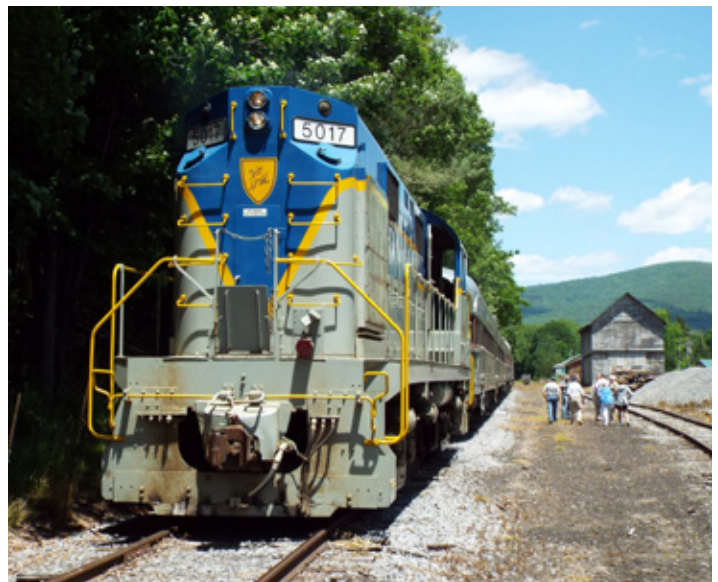
The Delaware & Ulster train lays over at the historic Roxbury, NY station & museum.