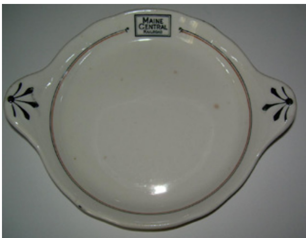
A $300 bid was needed to purchase this Maine Central Bangor pattern 6" dish ( 7.5 inches including the wings).