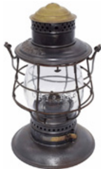
CRI&P BT Lantern Price Realized $4300