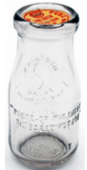
NP Milk Bottle Price Realized $3600