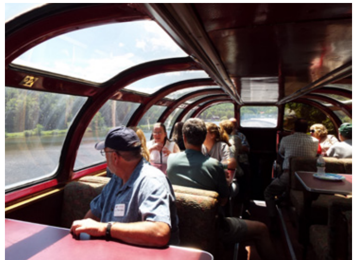
Passengers enjoy the Catskill Mountain scenery from the dome car on the D&U Rip Van Winkle Flyer trainset.

As the fall foliage season approaches, the railroad is ready for the sightseeing crowds to arrive. To kick things off, the Delaware & Ulster will host the Viscose #6 steam locomotive for special trips over the weekend of September 30th and October 1st. The saddle-tank locomotive travels