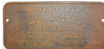
Heisler Builders Plate- Price Realized $4200