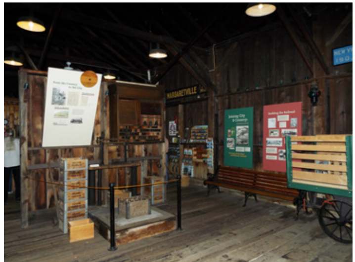
Artifacts from the collection of the late Walter Rich are among the items on display in the Arkville depot.