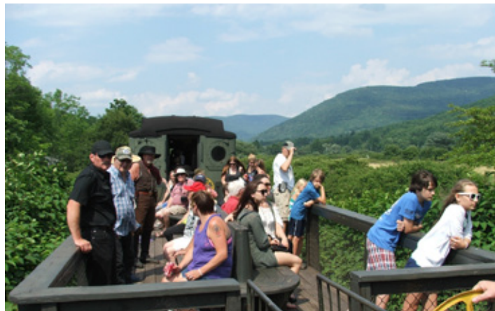
The Delaware & Ulster offers an enjoyable ride for both history buffs and non-railfan family members.