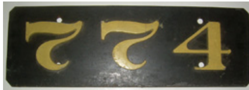
Nickel Plate Road Berkshire #774 Number Board: $2200