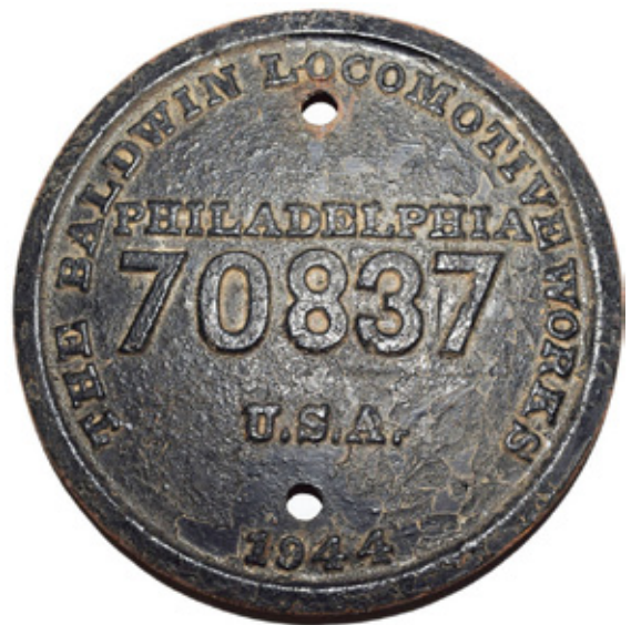
One of several builder's plates in the sale, this example from a Santa Fe Baldwin 2-10-4 sold for $4300.