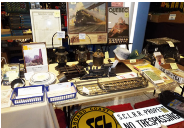
Most railroad hobby and model train shows include several dealers of authentic railroad memorabilia.