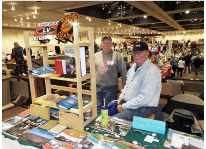
Local railroad hobby and model train shows often feature vendors who are not on the regular show circuit.

For dealers, the schedule gets pretty hectic during the late fall and into the winter, with regional shows scheduled on almost every weekend (some conflicting). Often, the van or truck remains packed for several weeks, with only a couple of midweek days off. It is generally worthwhile, though, in this railroad hobby equivalent of "Black Friday."