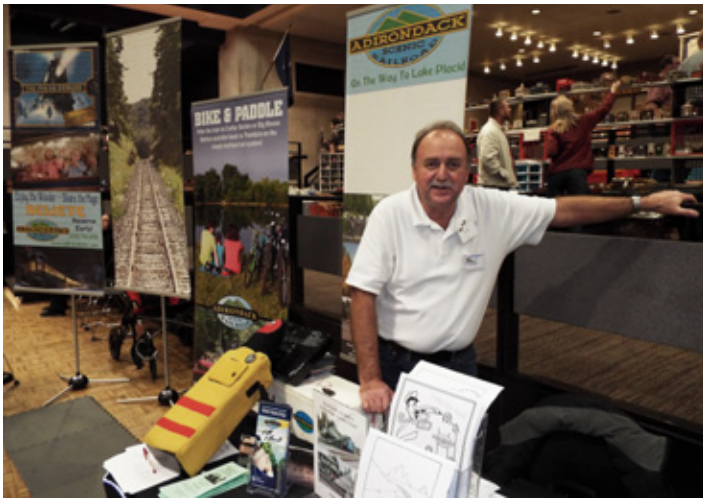
Visitors to the Adirondack Scenic Railroad booth were able to meet the friendly crew of the Polar Express train.