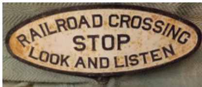
Cast Iron Railroad Crossing Stop, Look & Listen Sign: $400