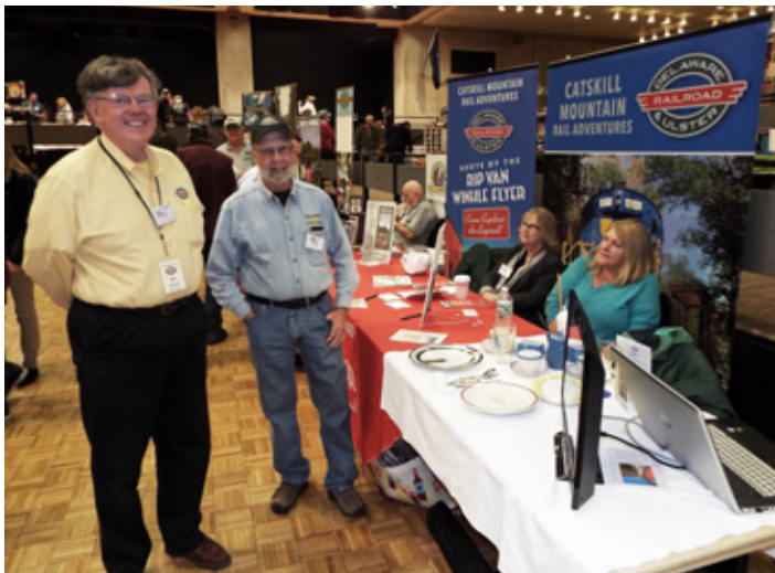
Volunteers from the Delaware & Ulster tourist line greet visitors to their booth at the Great Train Extravaganza.

Dealers at the shows held during November and December around the northeast reported good attendance and sales this year. The photos accompanying this article were all taken at the Great Train Extravaganza at the Empire State Plaza in Albany, NY, where Key, Lock & Lantern is a regular exhibitor. This year, several thousand visitors passed through the doors, many coming from the nearby holiday festival. The train show is alive and well, and we'll be loading up soon for the next one!