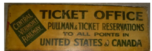
Central Vermont Railway Ticket Office & Pullman Reservations Sign: $675