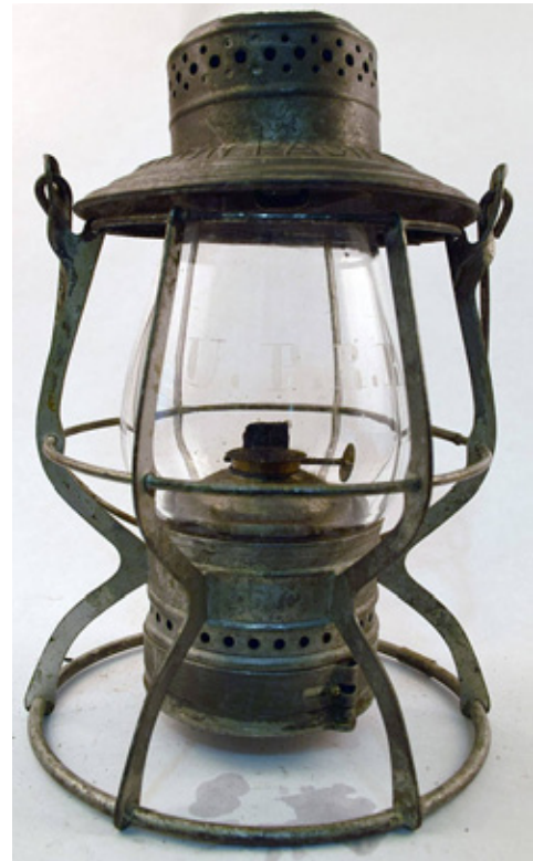
A Union Pacific Adams & Westlake wire bottom lantern with a wheel cut "UPRR" globe brought a $2700 bid.