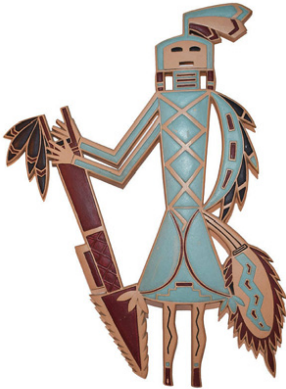
A $5750 bid was needed to purchase this aluminum wall plaque from a 1954 Santa Fe El Capitan train car.