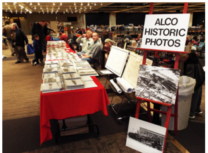
The Alco Historic Photos group offered prints from their vast collection of negatives at the GTE Albany show.