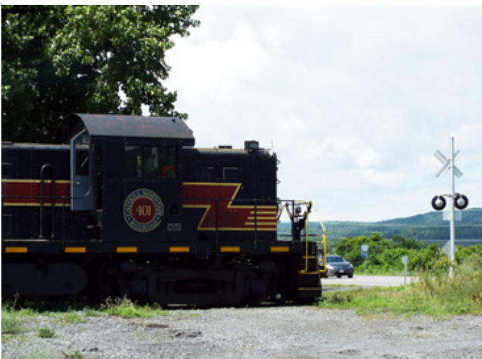
A Catskill Mountain Railroad Kingston run crosses Hurley Flats enroute to the edge of the Catskill Mountains.

With so many national transportation issues on the docket, it is uncertain how quickly the Surface Transportation Board will act on the filing. If no evidence of abandonment can be found, the old Ulster & Delaware Railroad line may be given a reprieve.