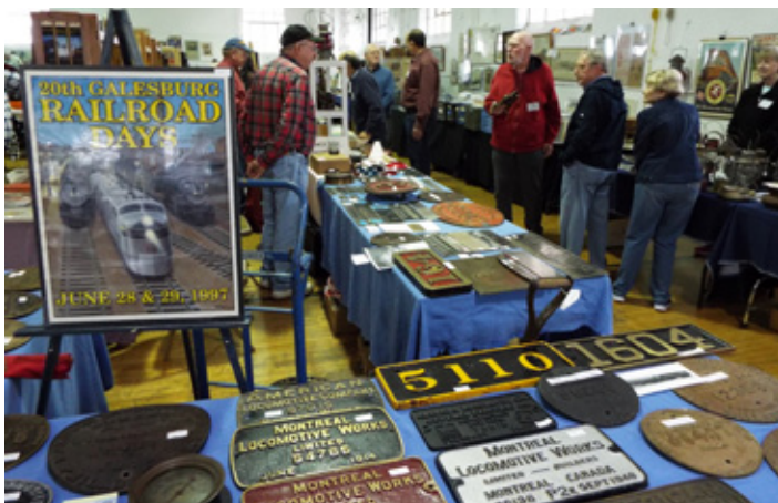
There was a nice selection of locomotive number and builder plates offered by Ron Muldowney.