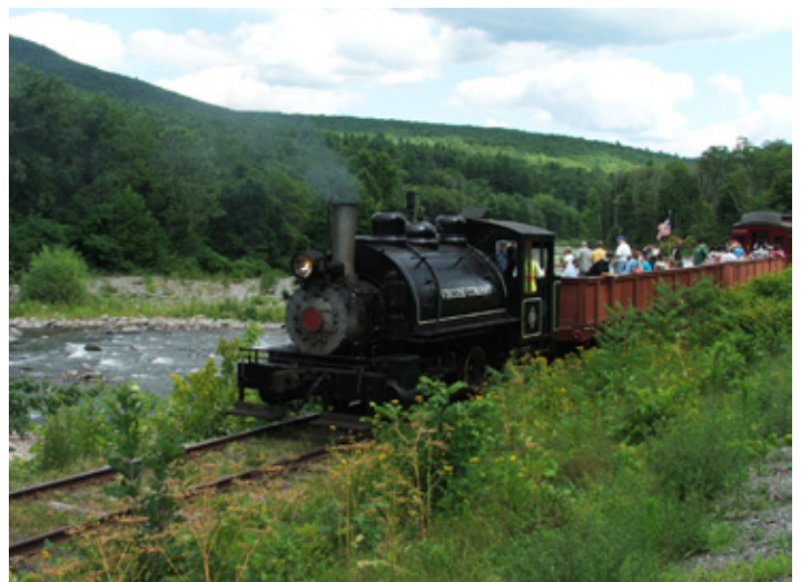
The Viscose #6 steam locomotive has made several visits to the Catskill Mountain RR, pulling special trains.