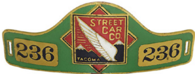
A $260 high bid was needed to purchase this colorful cap badge from the Tacoma Street Car Company