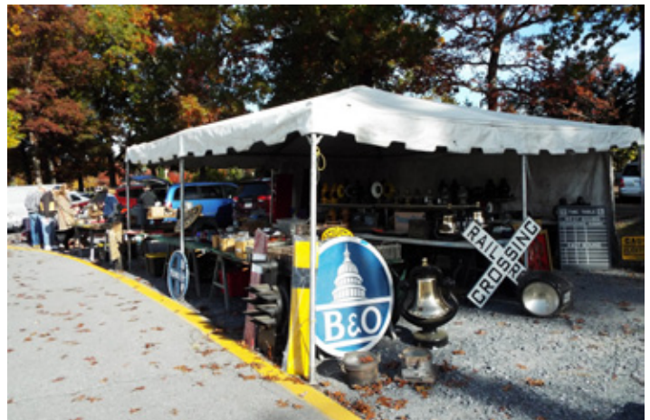
The weather was reasonably nice for visiting the several dealers who set up tents outside on the grounds.