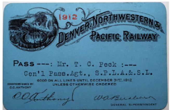
A $260 high bid took home this 1912 Denver Northwestern & Pacific pass with a Yankee Doodle Lake vignette.