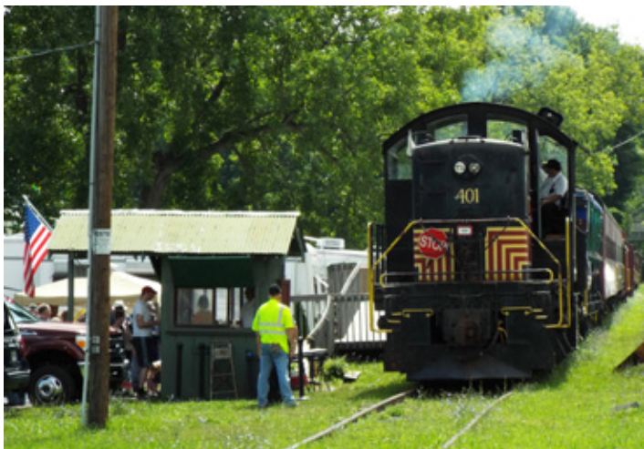
Passengers line up to purchase tickets for the Catskill Mountain Railroad in the Stockade section of Kingston.

In an effort to stop the permanent destruction of this historic railroad line, on January 16, 2018, the parent of the