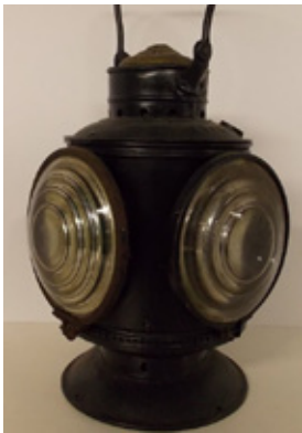
Lehigh Valley RR brass top marker lamp: $700 New England RR Fancy Cast Lock: $1100