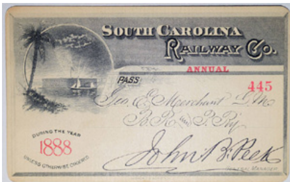
A $300 high bid took home this nice South Carolina Railway 1888 annual pass with palmetto vignette.