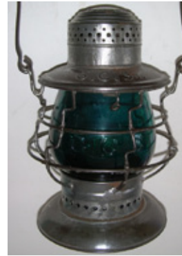
Grand Central Station Lantern with Green Cast Globe: $3100, New York New Haven & Hartford - Hartford Division Thompson: $2500