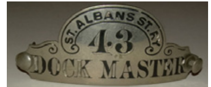
St. Albans Street Railway Dock Master Hat Badge: $625