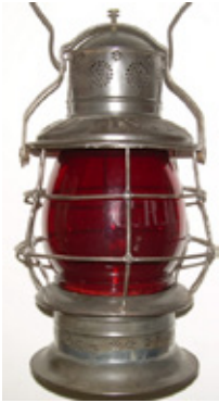
Concord RR Thompson Lantern: $1700, Triple Marked Boston & Albany New England Glass Lantern: $1750