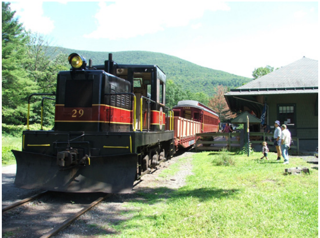
Catskill Mountain Railroad excursion trains from the Empire State Railway Museum in Phoenicia, NY have been discontinued with the refusal of Ulster County to renew the railroad's operating agreement. To add insult to injury, the county failed to perform track maintenance work, also preventing the Rail Explorers railbikes from using the line.

In the meantime, the Catskill Mountain Railroad has just completed another successful tourist train season, with its short trips out of Kingston and its Polar Express and other holiday theme trains. Most Polar Express runs were sold out this year, with many passengers traveling from out of town to ride. While local leaders are attempting to shut down the