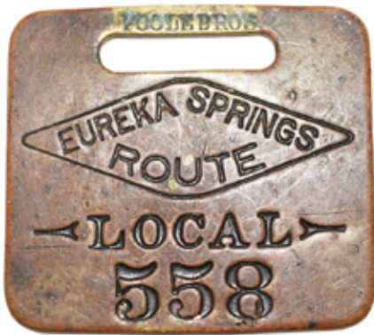
A nicely marked "Local" baggage tag from the Eureka Springs Route sold for a $460 high bid.