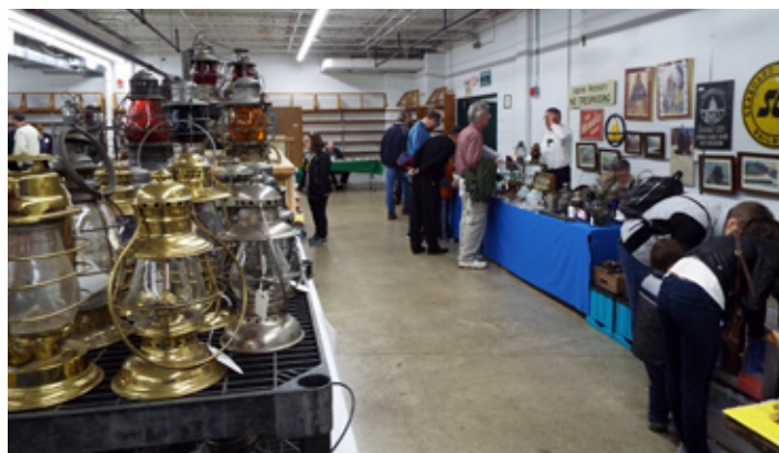
The Gaithersburg show is known for the high quality of the memorabilia that is offered for sale by its dealers.