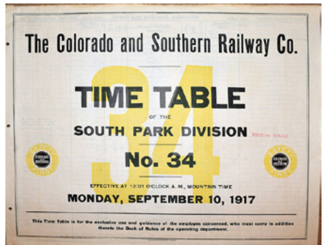
Colorado & Southern Railway Employee Timetable #34 from 1917 went to a new owner for a $575 high bid.