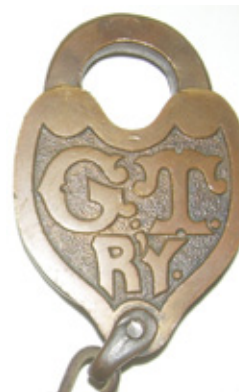
Grand Trunk Railway Brass Lock: $1800 Pennsylvania RR cast fixed globe: $2900