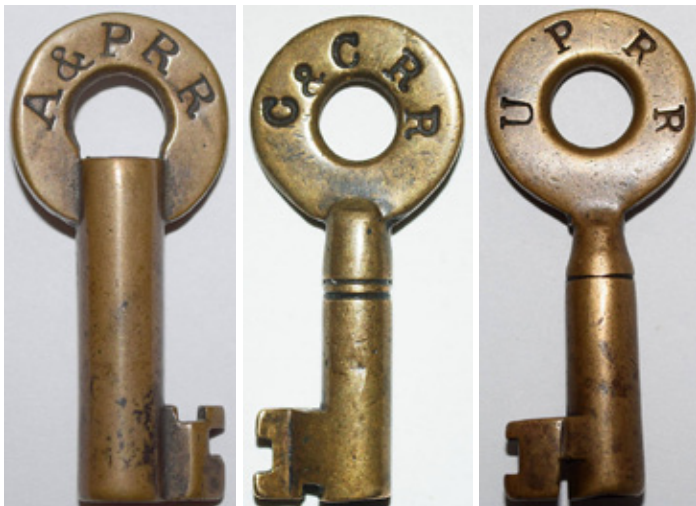
Switch keys from the Atlantic & Pacific RR ($340), the Carson & Colorado ($1000) and the Union Pacific ($525).