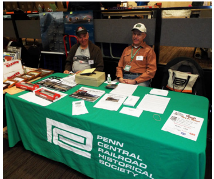
Railroad historical groups, such as the Penn Central Railroad Historical Society recruit new members at shows.