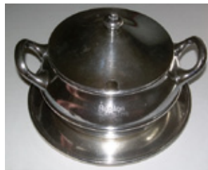
Boston & Maine RR Silver Casserole Dish: $800