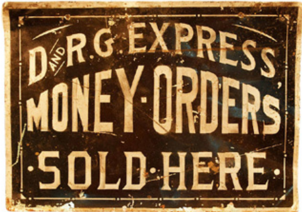
A high bid of $1100 was needed to purchase this rare Denver & Rio Grande Express Money Order sign.

Scarce lanterns and timetables brought high prices, along with some unusual advertising and decorative items. The Railroad Memories auction is without a doubt the place to look for hard to find memorabilia from this region, and the prices realized show that there is a high demand for it. There is plenty of the “good stuff” up for bid in the 100th auction, and it will interesting to see the results of that sale. All photos, prices, and descriptions courtesy of Sue Knous at Railroad Memories Auctions.