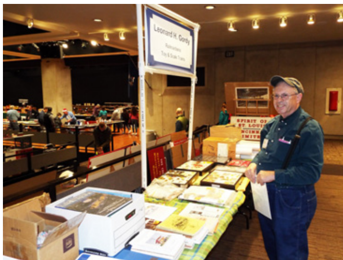
A few familiar faces from the railroadiana show circuit were among the exhibitors at this year's Albany show.