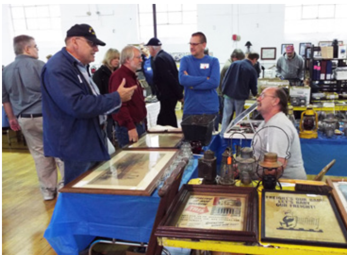
For those with weekend passes, there was some time available for socializing, but not too much!