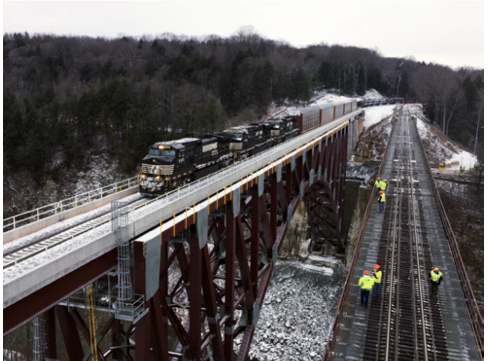
Norfolk Southern train 36T from Buffalo, enroute to Allentown, PA is the first train to cross the new Portage Bridge on December 11, 2017.

With the bridge located within a state park, railroad fans have been able to observe its construction over the last two years, as it slowly took shape. With the track swung to its new alignment,