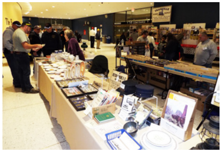
A nice selection of railroadiana was offered by dealer Times Treasures at Albany's Great Train Extravaganza.