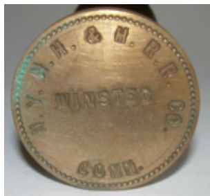
New Haven RR Winsted, CT Wax Sealer: $1100