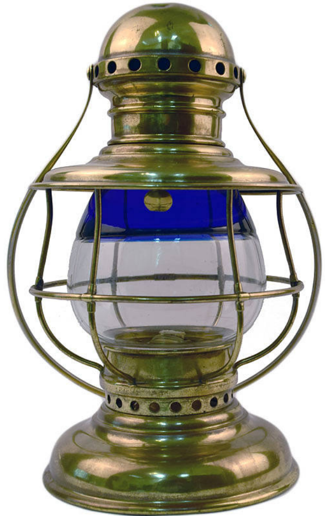
A nice F. Meyrose & Co. brass presentation lantern with a blue over clear globe sold for a high bid of $875.