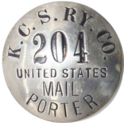
An unusual Kansas City Southern Railway "United States Mail Porter" badge went to a new home for $400.