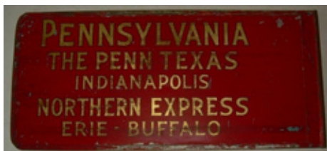
Pennsylvania Railroad Gate Sign: $400