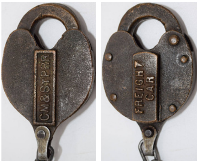
Chicago, Milwaukee & St. Paul “Freight Car” locks are hard to find, with this example selling for a $500 high bid.