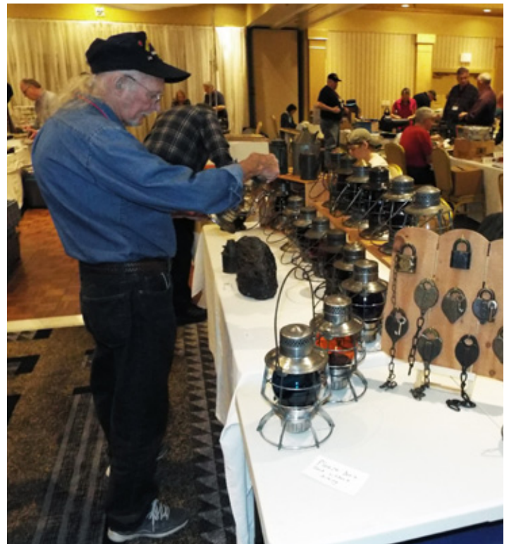
The KL&L Convention includes train excursions, programs, history displays, and memorabilia for sale or trade.

Registration forms will be mailed out soon, and will also be available online at www.klnl.org , once final details have been arranged. An announcement will be made on the KL&L Facebook page and to the digital newsletter e-mail list, once online registration goes live. The Key Lock & Lantern Convention is once again one of the premier events for transportation historians and collectors - make plans today to attend!