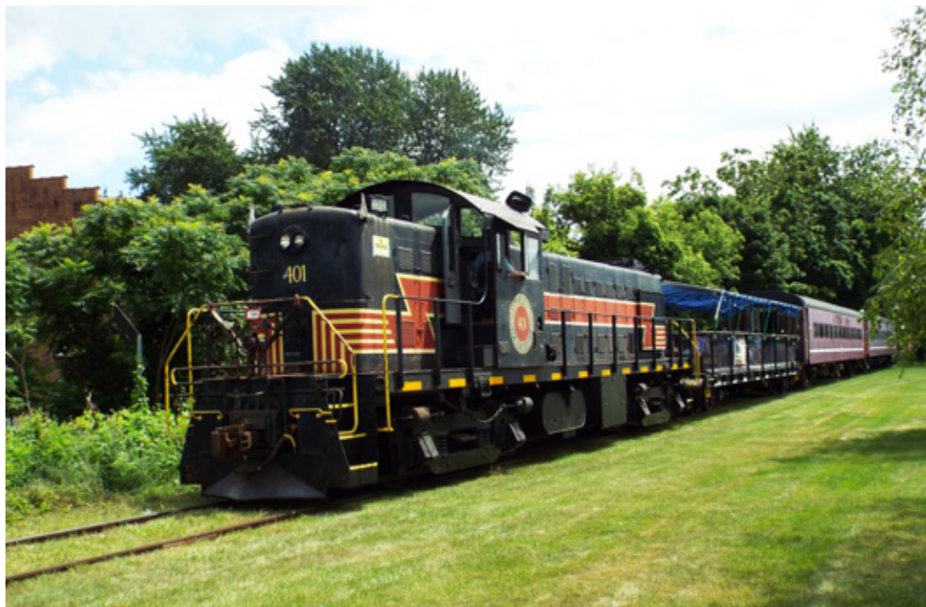
A Catskill Mountain Railroad tourist train departs from Kingston, NY in September of 2017, on a short run to the foothills of the Catskill Mountains. The railroad has retained its operating rights on this section of the former Ulster & Delaware RR.

With several sections of the line out of service due to track conditions, both organizations have worked toward repairing all remaining trackage to create a through route again from Kingston to the end of the rail at Roxbury. Even with limited