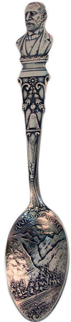
Northern Pacific "Baked Potato" advertising always commands high prices, with this pennant bringing $4100, while an Otto Mears sterling silver spoon sold for $2100