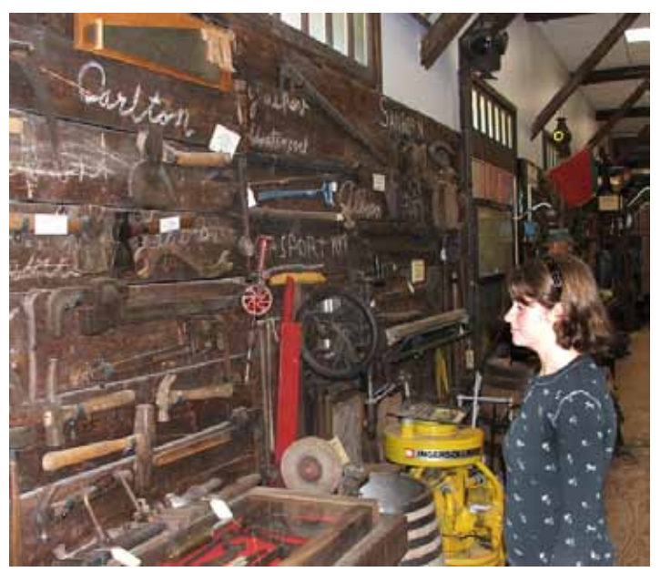
A visitor examines part of the Medina Railroad Museum's large collection of tools and railroad equipment.

railroadiana. Exhibits of smaller items are primarily arranged by railroad company, with separate displays of tools, signals, and larger objects. Most of the artifacts are identified with the donor's name and location of use, so even the more common items have historical significance. Exhibits on famous trains such as the Burlington Zephyr and the 20<sup>th</sup> Century Limited examine those subjects in greater detail. For serious railroadiana collectors, there are some rare gems displayed among the many artifacts, so it is worthwhile to spend time carefully looking through each case.