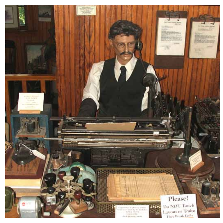
The New York Central freight agent at Medina, NY is once again back at his post in the freight station office.