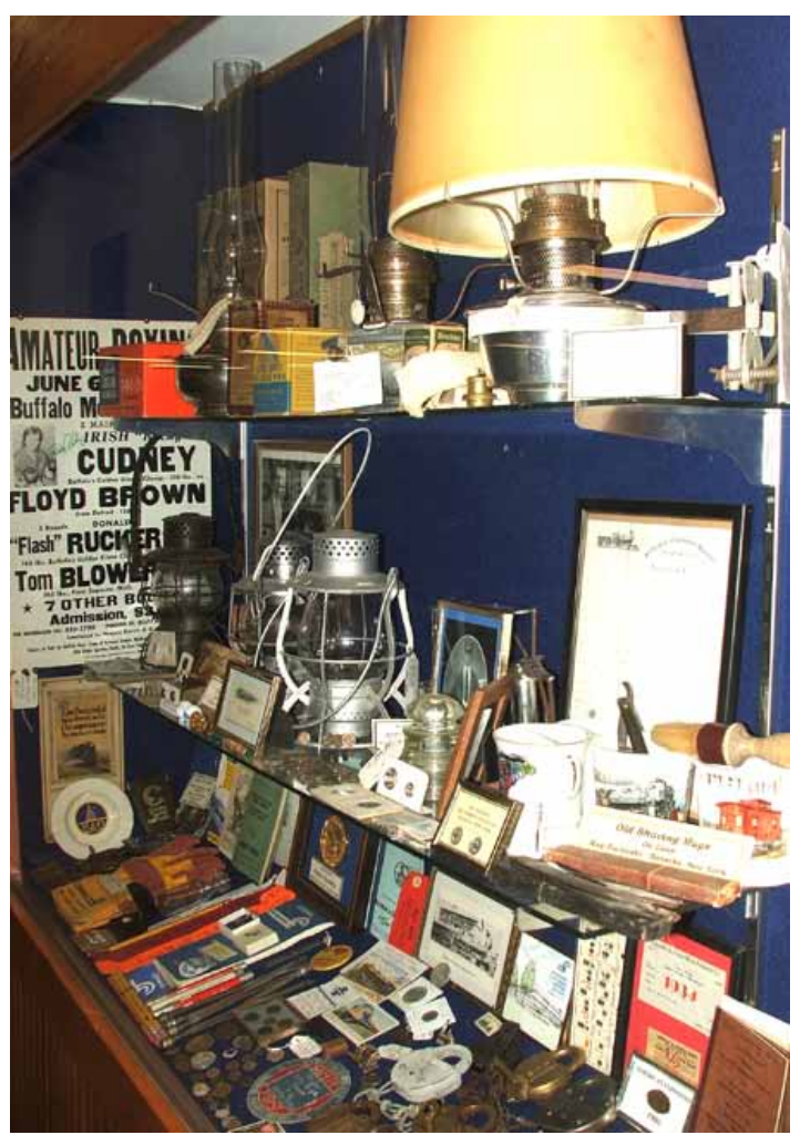
The walls of the Medina Railroad Museum are lined with display cases filled with every type of railroadiana.