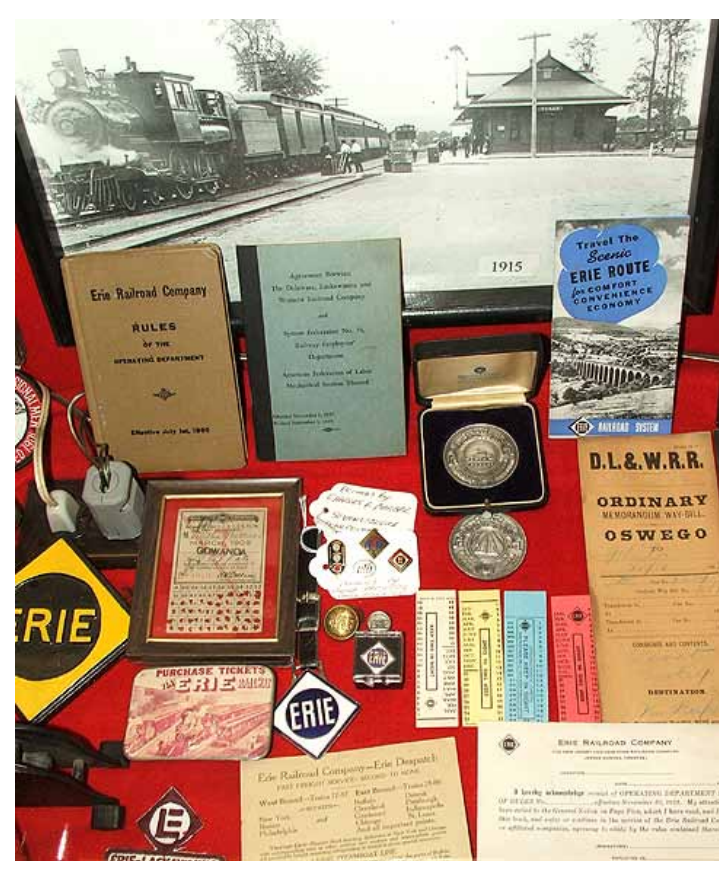
Railroadiana at the Medina Railroad Museum is generally grouped into exhibits covering specific railroads.