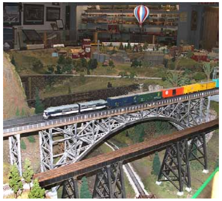
Both young & old visitors will enjoy the museum's huge HO Scale model railroad layout.

Located in a former New York Central freight house in Medina, NY, the centerpiece of the museum is a 200 foot long HO scale model railroad layout. Trains pass over high trestles, into tunnels and freight yards, and through large cities. While the layout is not intended to recreate a specific line or time period, visitors will recognize accurate depictions