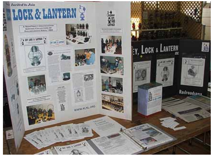
The Key Lock & Lantern display at the Gaithersburg show introduced the organization to prospective members.

Several dealers reported brisk sales of more common paper items and timetables, along with anything that was priced to reflect the current state of the market. However, a number of higher end items also changed hands. One lantern with a $1600 price tag was snatched up in the opening minutes, with almost no bargaining. Truly rare items still seem to command top dollar.