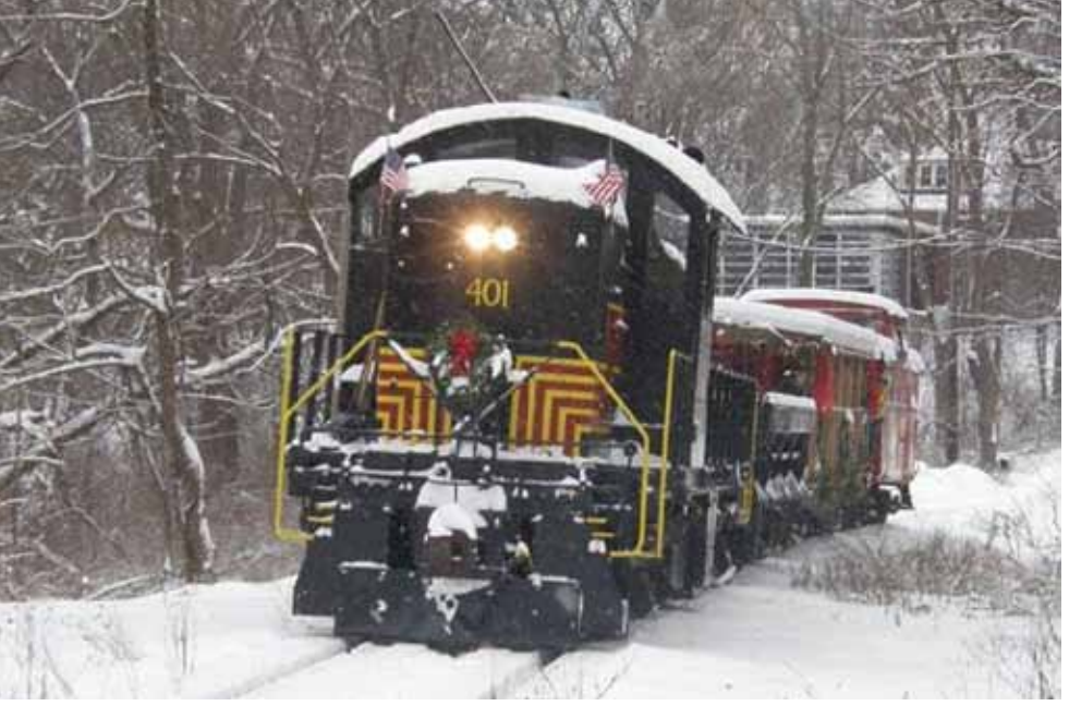
Holiday train on the Catskill Mountain Railroad at Kingston, NY.

good news for the railroad historical groups that organize these trips. The profits from special events this season will go directly toward the preservation of railroad memorabilia and equipment next year. With funding from other sources scarce in recent months, every dollar of revenue counts.