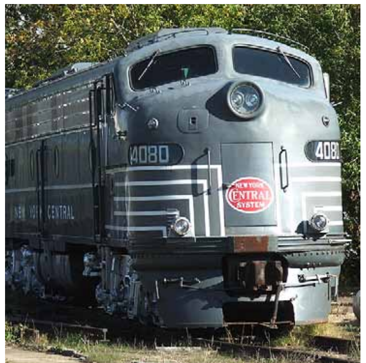
The Medina Railroad Museum plans to use former NYC units on its excursion trains in the near future.

A large collection of toy and collectible model trains is also on display, in addition to the operating railroad layout. Several hundred ship and aircraft models fill other display cases, along with scale models of stationary steam engines and military equipment. Museum director Marty Phelps is a retired firefighter, and his extensive collection of fire department memorabilia is shown, including over 400 fire helmets. While the current trend with museums seems to be a greater focus on interpretive exhibits at the expense of display space for artifacts, this one strikes a perfect balance between presenting history and showing off its collection. More railroadiana is currently stored in the museum archives, and will be displayed when a planned expansion is completed.