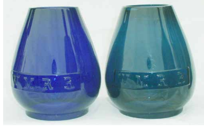
Many of the lanterns and globes pictured in the book are extremely rare and cannot be seen elsewhere.

Many of the lanterns pictured in the book are quite rare, and are unlikely to be seen anywhere else. While the main focus is on brakeman's hand lanterns and globes, examples of inspector's and marker lamps, and presentation lanterns are also included. Variations in styles and markings are outlined, which can be useful in dating specific lanterns, and the identification of fakes is discussed.