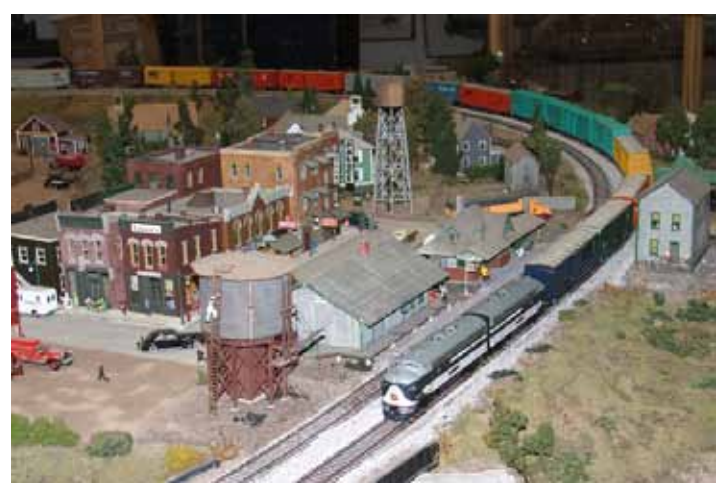
Model train shows & displays, such as this one at the Medina Railroad Museum, introduce the railroad hobby to the general public and help support railroad preservation.

on their own property, or a nearby shortline, holiday trains have also been popular this year. Polar Express trains, based on the children's book and movie of the same name, have been sold out on several lines. These reports are certainly