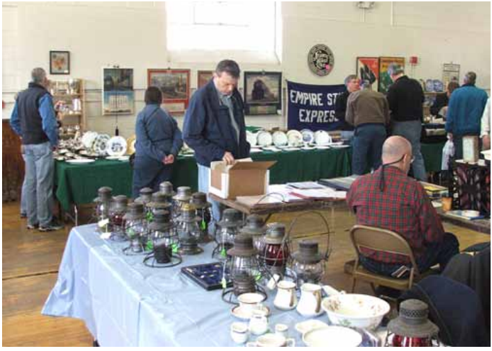
Early admission holders get a head start on some of the higher end lanterns and dining car china.

Once again this year, Key Lock & Lantern had a table at the show, to introduce the organization to prospective members. A number of KL&L members stopped by the table to say a brief hello, before continuing to hunt through the show's five different rooms and hundreds of tables. An all weekend pass was a must for those who wanted to spend any time visiting with fellow collectors.