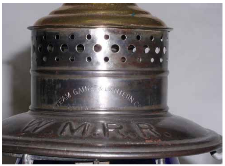
Lanterns of the Western Maryland includes photos of the details of many of the lanterns cataloged in the book.

is currently conducting research on locks and keys from this railroad, for publication in a similar book, and any information from KL&L members on this subject would be appreciated. He can be contacted at myetter@myactv.net.