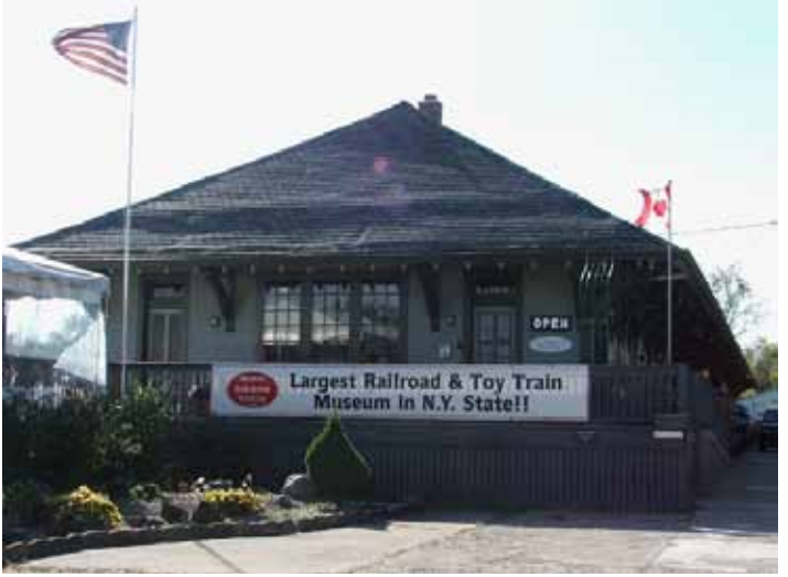
The Medina Railroad Museum is housed in a circa 1905 New York Central Railroad freight house.

Surrounding the model train layout are dozens of display cases containing railroad memorabilia, with a focus on the lines of the western New York region. From common tickets to rare lanterns, there are examples of almost every type of