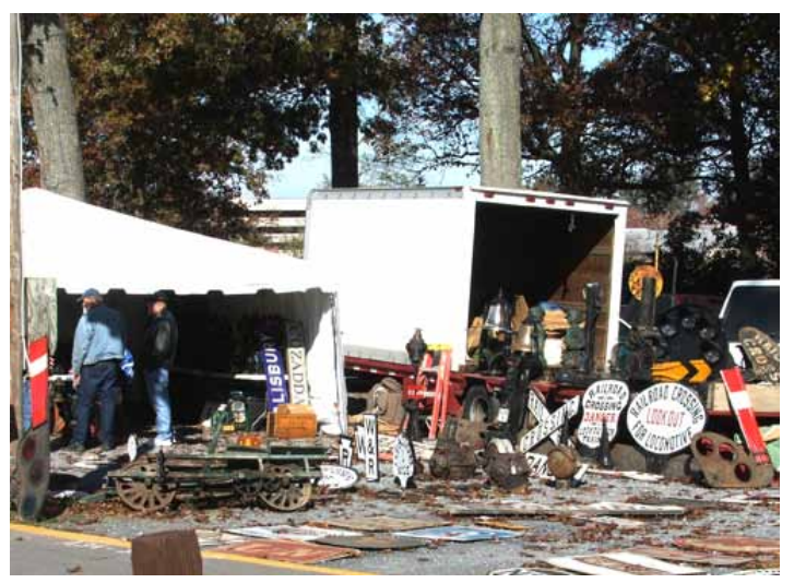
Need a sign or a signal? The outdoor display area for the larger items is a Gaithersburg show tradition.

Fairly decent weather allowed for some train watching on the adjacent former B&O main, or a side trip into Washington to visit some of the museums. If we could only convince Amtrak and MARC to stop at the fairgrounds, we would have it made. Overall, a trip to the Gaithersburg railroadiana show makes for an enjoyable weekend, whether or not a collector is planning to make any big purchases. We can safely assume that most everyone who attended is already looking forward to next year.