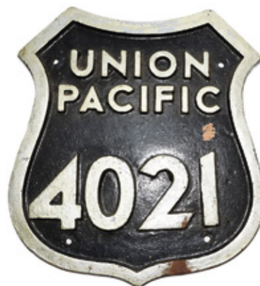
UP Big Boy Number Plate