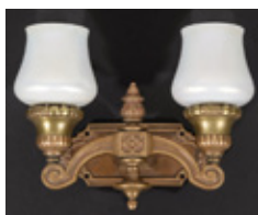
Many Ornate Side Lights with Iridescent Art Glass Shades