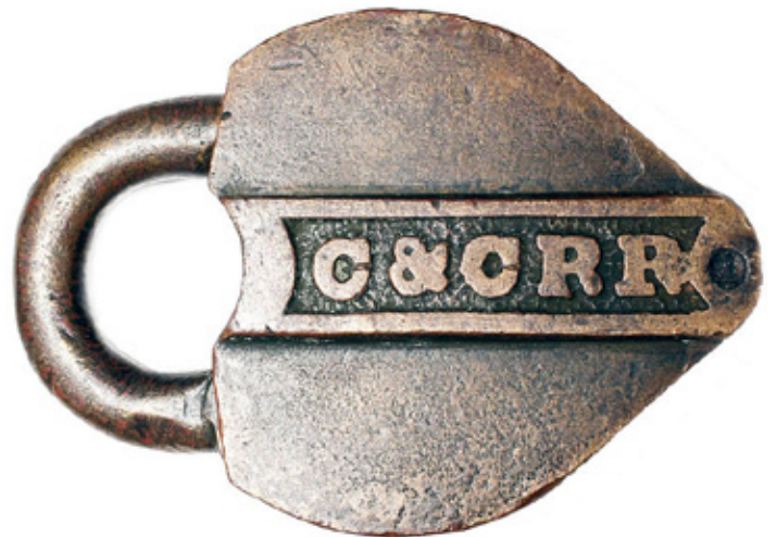
This Carson & Colorado brass car lock by Dayton was found near Lunig, NV and sold for a $5750 bid.