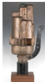
Hardware and Locomotive Items