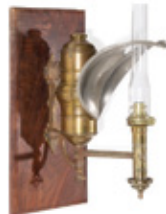
Postal Car Side Lights