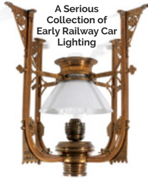
A Serious Collection of Early Railway Car Lighting