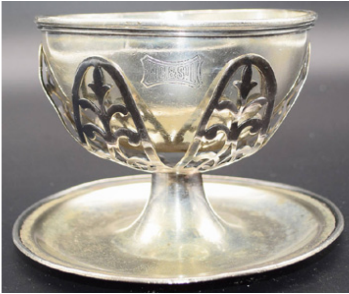
This Nashville Chattanooga & St. Louis 4 3/8" silver bowl by Gorham went to a new home for a $1200 bid.