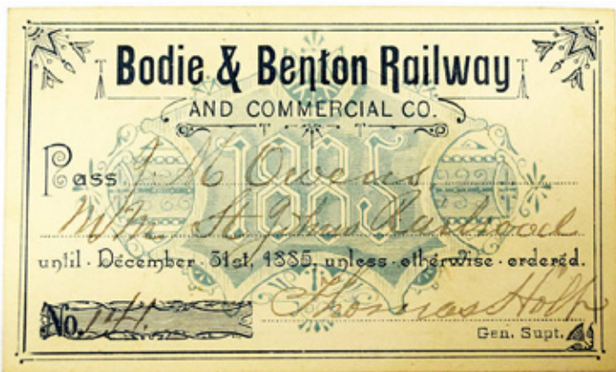
A $5500 bid took home this Bodie & Benton Railway & Commercial Company 1885 annual pass.