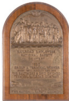
A 1930 Bronze Safety Award For B & O Railroad