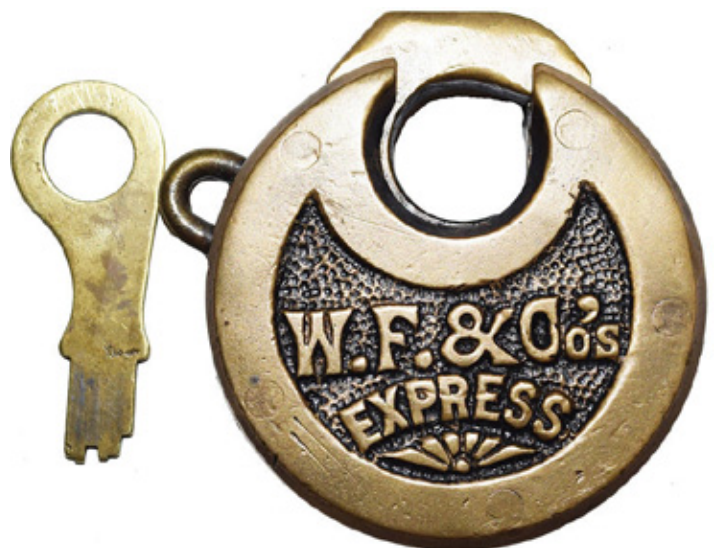
A $6250 bid was needed to buy this rare Wells Fargo & Company Express D.K. Miller lock and matching key.