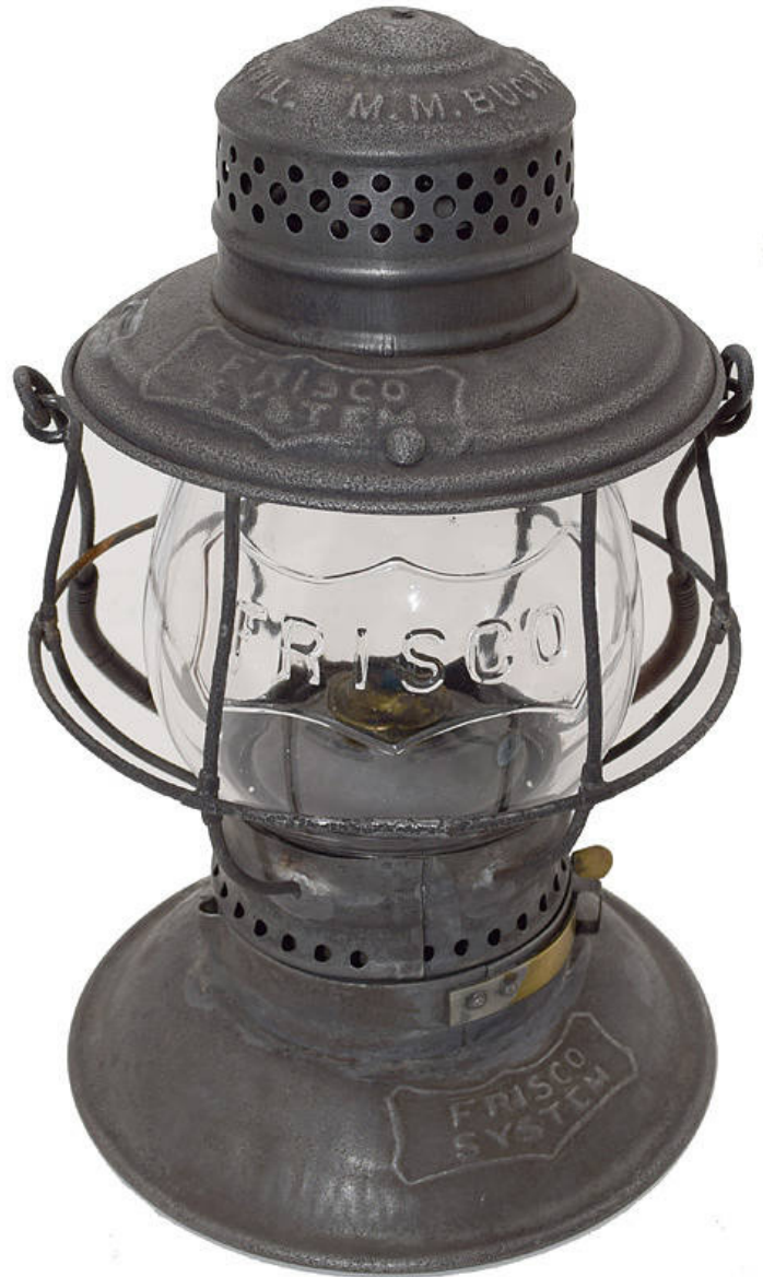
A high bid of $850 took home this MM Buck bellbottom lantern triple marked with the Frisco logo.