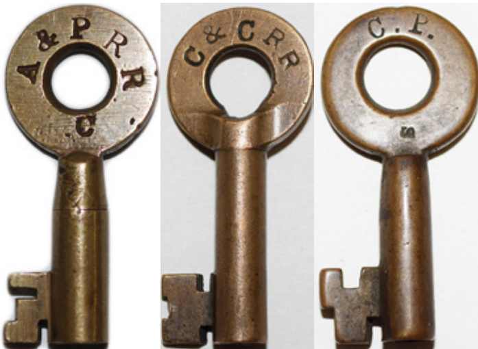
Keys from the Atlantic & Pacific ($825), Carson & Colorado Railroad ($2200) and the Central Pacific ($850).