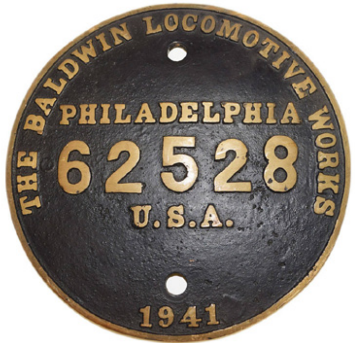
A $2700 bid was needed to buy this Baldwin builders plate off Duluth Missabe & Iron Range 2-8-8-4 #222.