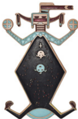
Santa Fe Wall Plaque