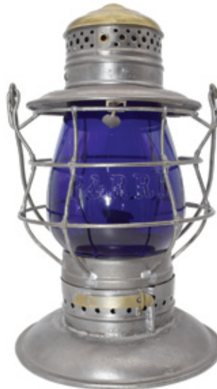
P&RRR Cobalt BTBB