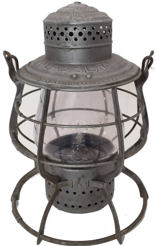
A San Pedro, Los Angeles & Salt Lake Railway Adams lantern with clear cast globe sold for a $625 bid.