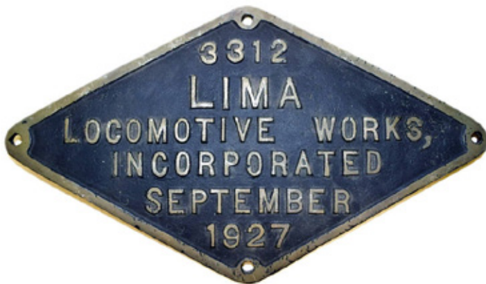
The Lima Locomotive Works builders plate off logging company Bloedel Stewart & Welch Company's Shay locomotive #11 sold for a high bid of $3200.