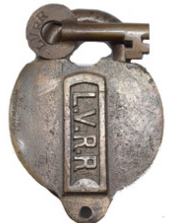
Lehigh Valley Lock