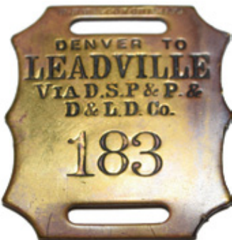
DSP&P Baggage Tag