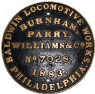
1883 D&RG Builders Plate

Announcing Auction 102 Closing September 16, 2018 Featuring some amazing pieces from the Neil Shankweiler estate. Some highlights: 60 lanterns including BTBB cobalt blue cast P&RRR, C&SRV clear cast, LVRR signal green cast, Santa Fe ext base clear cast logo. 100 pieces of china including an extremely rare D&RG Buena Vista pattern dinner plate, demi's, including Portland Rose, butter pats including C&SRV & Uintah. 96 keys includes Carson & Colorado, CMRY, Eureka & Palisades. Locks including cast LVRR, T&T, BA&P. Early passes, Santa Fe Wall plaque, depot ticket cabinet. More builders plates including 1883 D&RG, T&T and UP Big Boy front end number plate. This is just a sampling of over 600 lots that will be featured in this amazing issue. Printed catalogs are available for $20 each and include a complete prices realized list. Auction is hosted on my website with live on line bidding as well as multiple photos of each of the pieces. Remember I guarantee authenticity on everything I sell. Auction will be opened in early September so if you are not already a registered bidder be sure to sign up now.