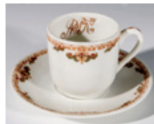
Norfolk and Western Demitasse and Other Rare China