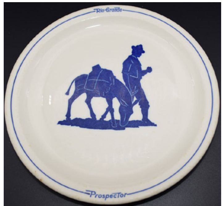
A high bid of $1000 was needed to buy this Denver & Rio Grande Western 9" Prospector dinner plate by Syracuse.