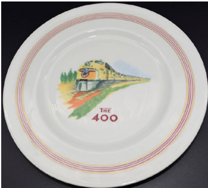
An $850 high bid was needed to purchase this Chicago & Northwestern 10 1/2" Flambeau service plate.