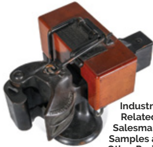
Industry Related Salesman's Samples and Other Rarities