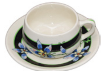
UP Columbine C&S