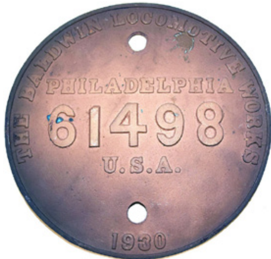
This Baldwin builders plate from Chicago Burlington & Quincy 4-8-4 steam locomotive #5604 sold for $4300.