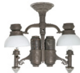
Two Arm Center Lamps