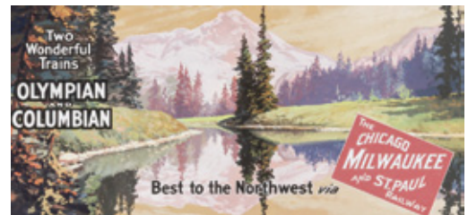
Original Illustration Art