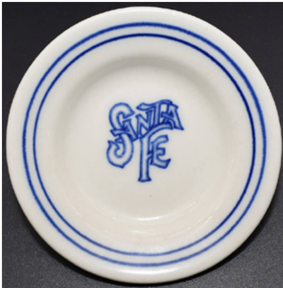
A $220 high bid took home this AT&SF Bleeding Blue pattern butter pat marked for Albert Pick & Company.