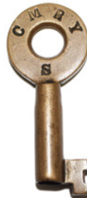
Colo Mid Tapered Key