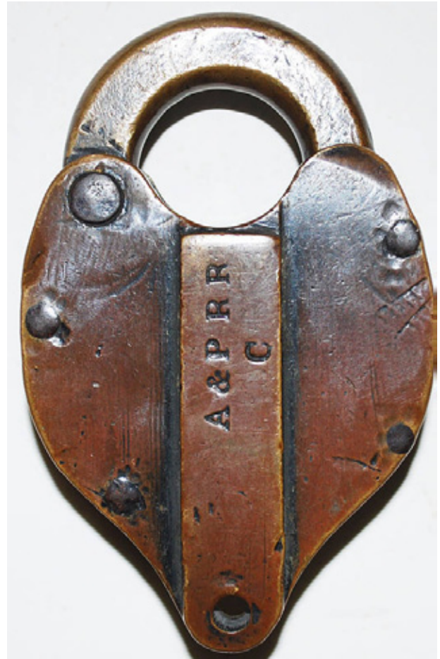
This Atlantic & Pacific Railroad car lock by Ritchie & Boyden sold for a high bid of $725.