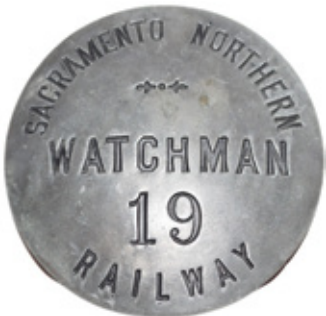
Sacramento Northern Badge