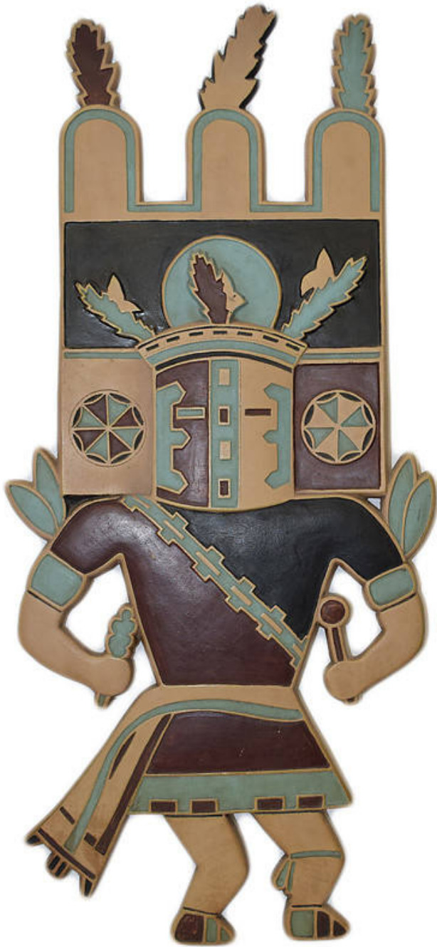
A $6000 high bid took home this 31" high cast aluminum "Kachia" wall plaque from a Budd High Level Lounge Car on the 1950's Santa Fe El Capitan train.