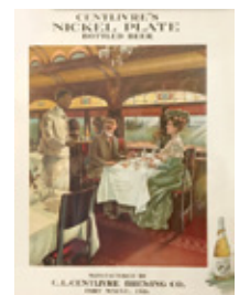
Paper Advertising and Ephemera

Held Inside 529 Gallery, 529 West Lone Jack Lee's Summit Road, Lone Jack, MO 64070, 816.697.3830 | www.SoulisAuctions.com