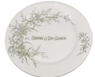
D&RG Buena Vista Plate