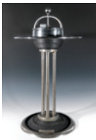
A Wide Range of Pullman Furniture and Accessories