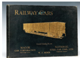
An Important Collection of Trade Catalogs for Railway Cars, Street Cars, Headlights, Lanterns, Water Towers, Car Trimmings, Crossing Signals, Locomotive Forgings and More!