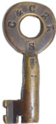
Carson & Colo Tapered Key