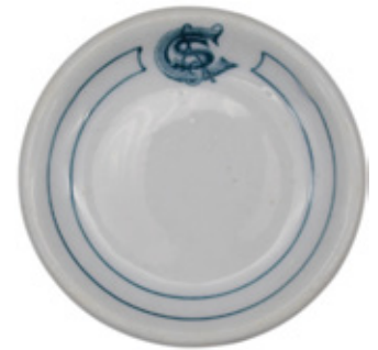
Colo & Southern Butter Pat