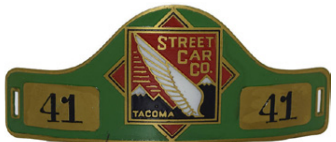
A nice Tacoma Street Car Company uniform hat badge went to a new home for a $250 high bid.