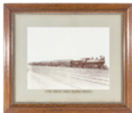
Many Early Photographs