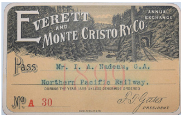
This Everett & Monte Cristo Railway 1899 annual pass with a nice vignette sold for a high bid of $525.