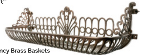
Fancy Brass Baskets