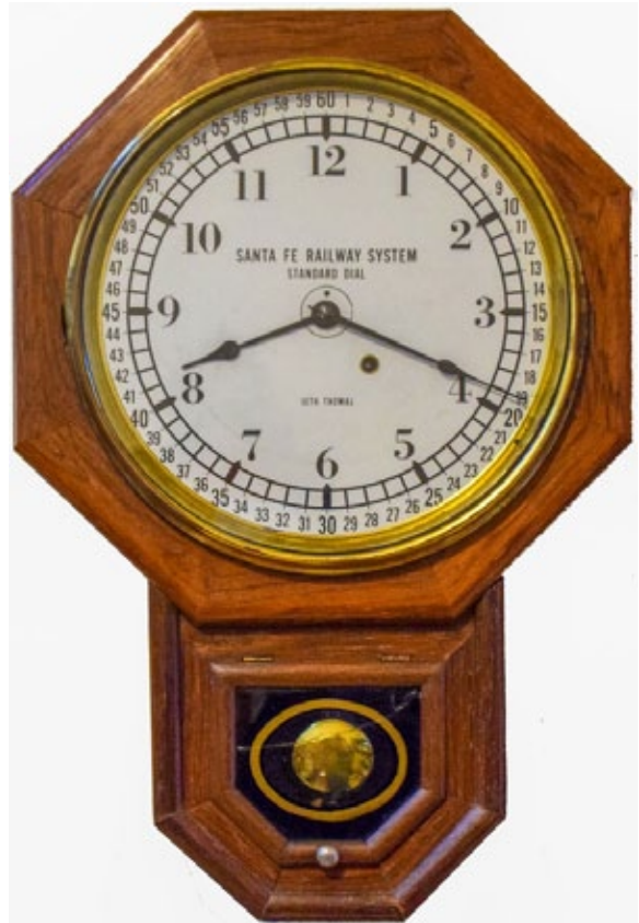
A $1700 bid purchased this Santa Fe Railway System schoolhouse style depot clock made by Seth Thomas.