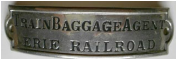
An Erie Railroad Train Baggage Agent cap badge by American Railway Supply sold for a high bid of $600.