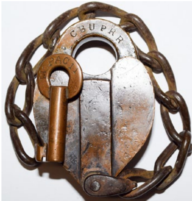
A $1000 bid took home this Central Branch Union Pacific Railroad Bohannon car lock with MOPAC key.