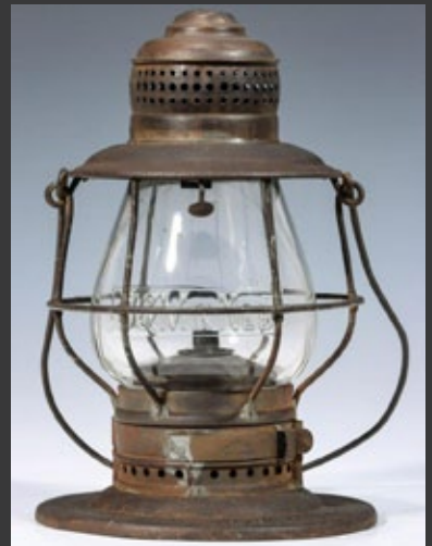
B&M in Neb w/ Clear Cast Globe - $9,000