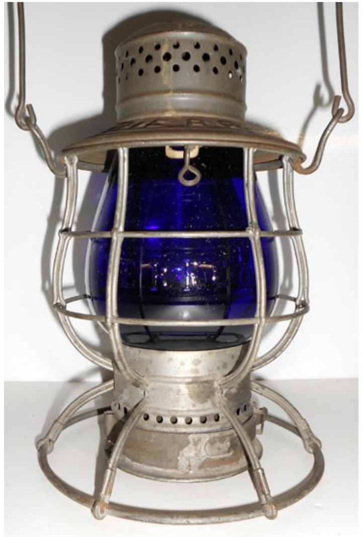
An Erie RR CT Ham wire bottom lantern with a blue cast "ERRCo" globe sold for a high bid of $1700.