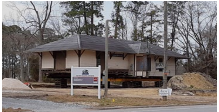
Above, Pollockville station is placed in position at its new location. Below, a new foundation has been constructed and interior work will soon begin.