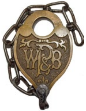
PW&B fancy back as well as MP Women's Toilet, D&RG, SP, DM&N & DM&IR