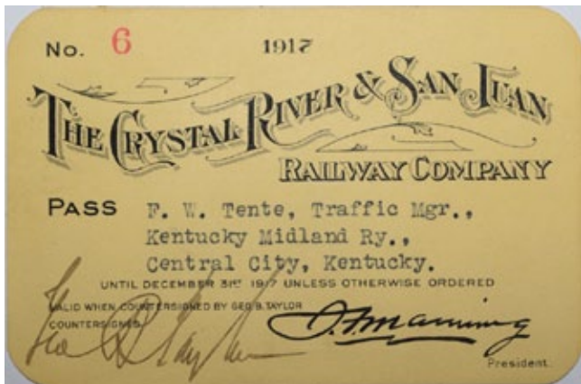
A $1300 bid was needed to purchase this Crystal River & San Juan Railway Company 1917 annual pass.