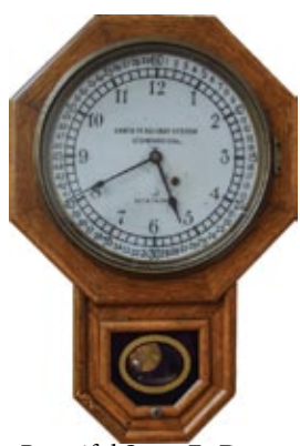
Beautiful Santa Fe Depot Clock