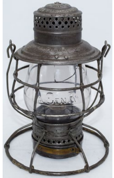
Colorado & Southern Railway with 100% tin & C&S Ry purple tint globe ($2600), Denver & Rio Grande Railroad A&W with clear cast D&RGRR globe ($3300), Iowa Central Railroad A&W with "Ia Cen Ry" clear cast globe with crack ($1300).