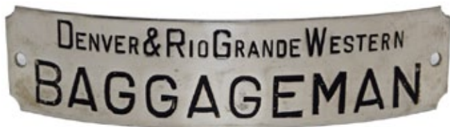
A Denver & Rio Grande Western Baggage Man cap badge went to a new home for a high bid of $725.