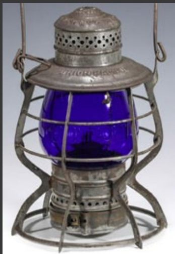
Union Pacific w/ Blue Cast Globe - $42,000