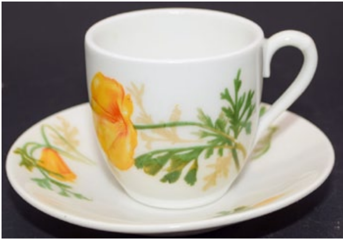
An AT&SF California Poppy demitasse set with a bottom stamp of 1922 by Bauscher sold for a $525 bid.