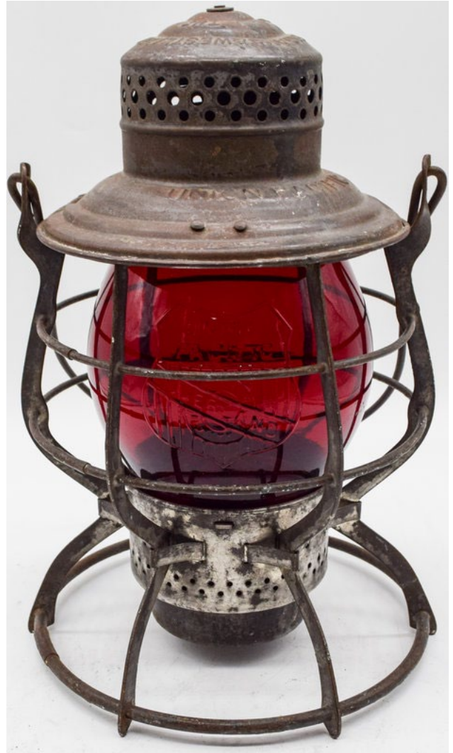
A $675 bid took home this red cast Union Pacific logo globe in a Union Pacific Adams & Westlake wire bottom lantern.