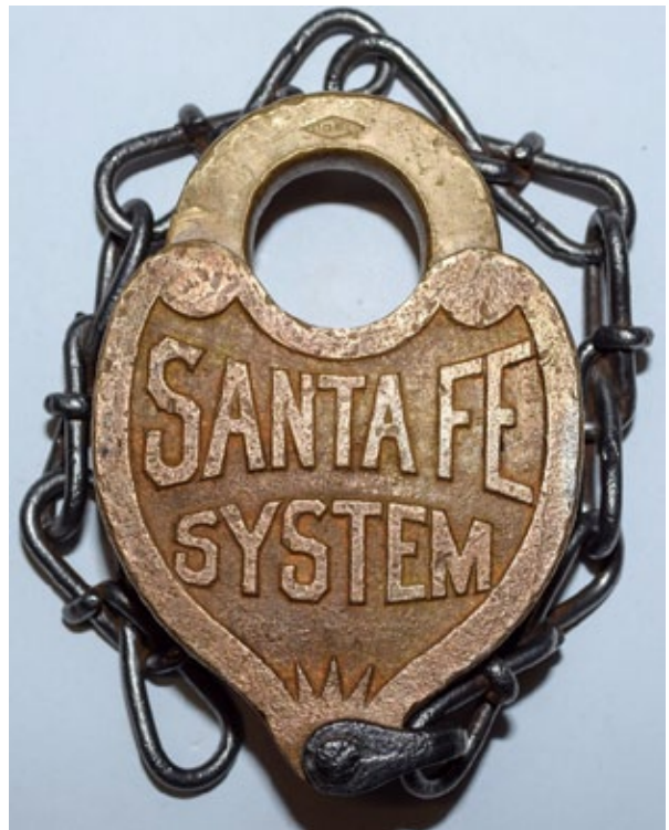
A Santa Fe System brass heart lock stamped "MTRY" (Midland Terminal) on the reverse sold for a $5500 bid.