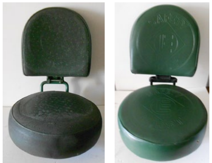
A locomotive seat from the Chessie System sold for $500, while one marked Erie Lackawanna brought $1600.