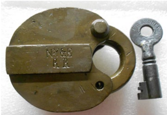
A $275 bid was needed to purchase this New York & Erie Railroad brass car lock with working key.