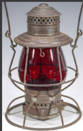
UPRR w/ Red Cast Globe - $13,000