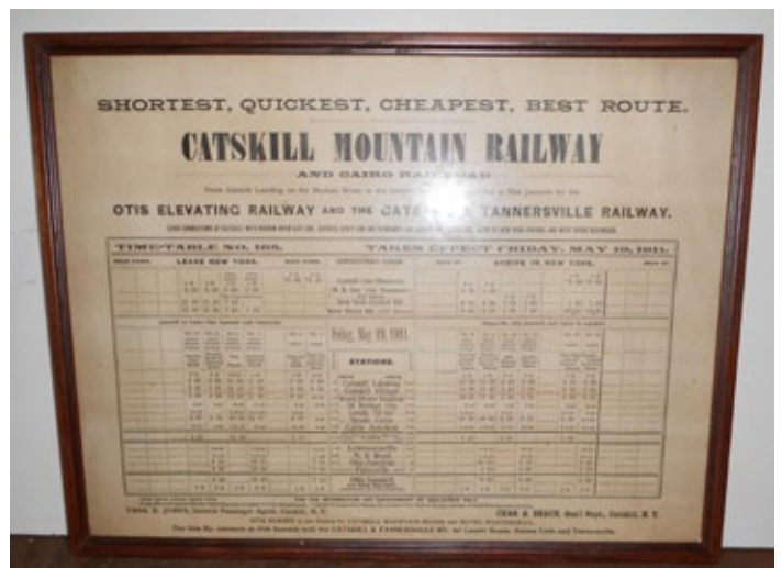
A timetable from the Catskill Mountain, Otis Elevating, and Catskill & Tannersville Railroads sold for a $220 bid.