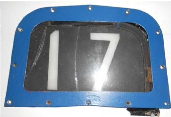
The number board from Delaware & Hudson Railway Alco PA locomotive #17 sold for a high bid of $1000.