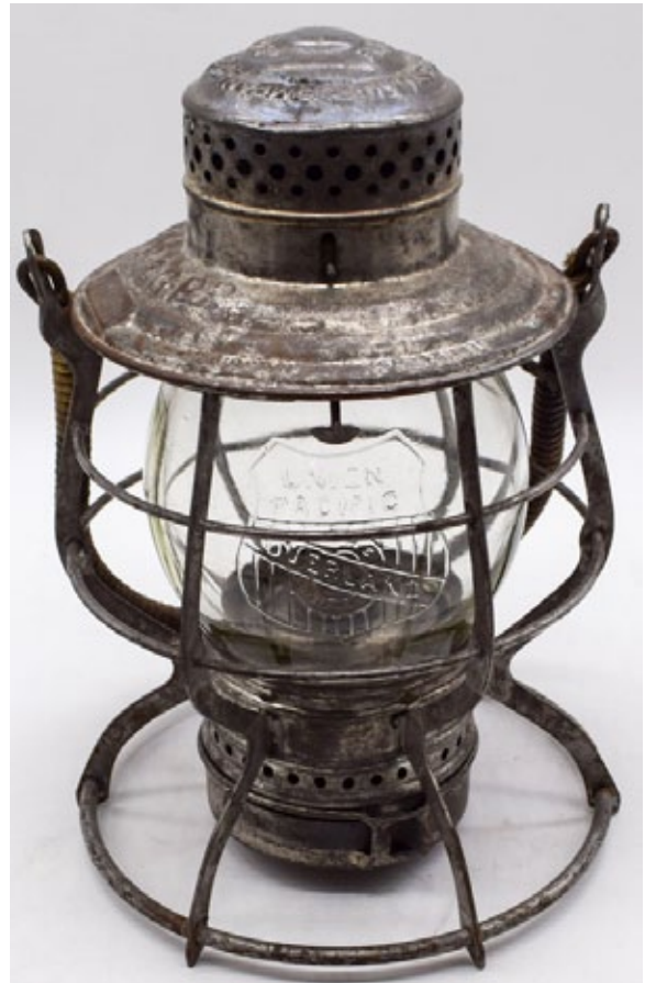
A Union Pacific Denver & Gulf RR Adams lantern with clear cast Union Pacific logo globe sold for a $5000 high bid.