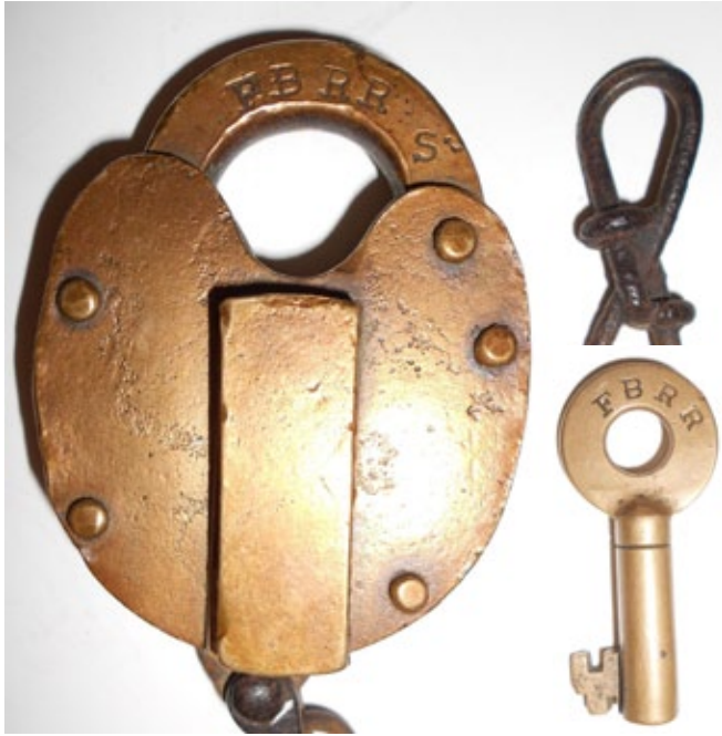
A brass Fall Brook Railroad switch lock brought an $850 bid, while a key sold separately for a $550 high bid.