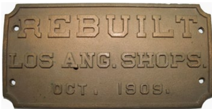
A Southern Pacific Los Angeles Shops 1909 locomotive rebuild plate from 4-8-0 #2939 sold for $6250.