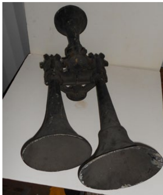
One of several sets of horns in the auction, this 3-chime Leslie Supertyfon sold for a high bid of $4600.