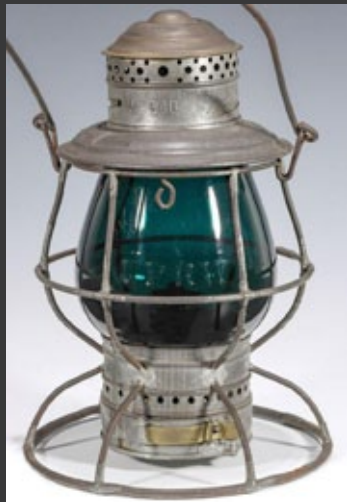
UPRW A&W w/ Green Cast Globe - $15,000