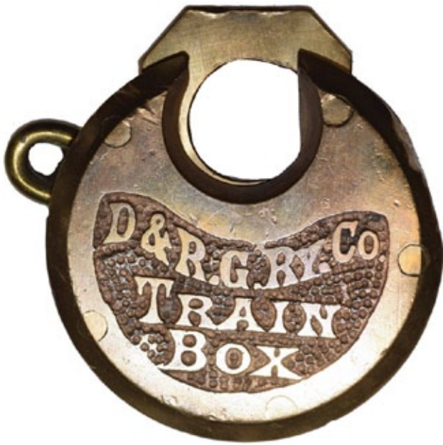
A $3600 bid was needed to purchase this Denver & Rio Grande Ry Train Box brass 6-lever lock by D.K. Miller.