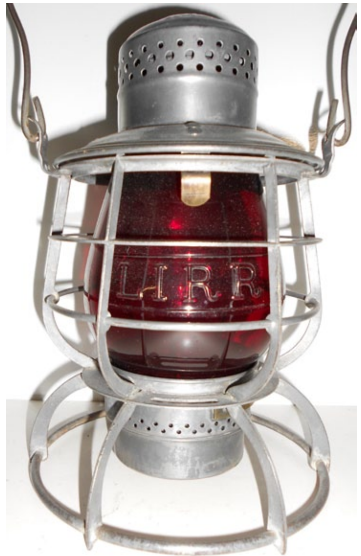
A Long Island Railroad Armspear lantern with a red cast LIRR globe with base damage sold for a $325 bid.