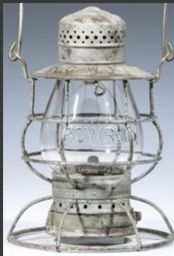
RGW Ry w/ Clear Cast Globe - $13,000