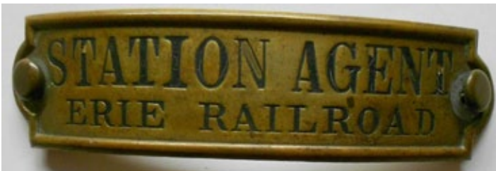
An Erie Railroad Station Agent badge by E.J. Brooks went to a new owner for a high bid of $240.