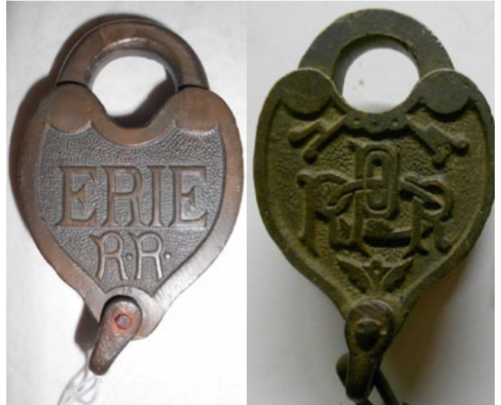
A $1000 bid was needed to buy this fancy cast Erie Railroad brass heart lock made by Slaymaker, while a Pennsylvania Railroad version, also by Slaymaker and including a knobby key, sold for a reasonable $250.