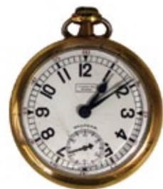
Santa Fe Route Pocket Watch