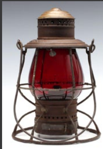
Union Pacific w/ Red Cast Globe - $7,000