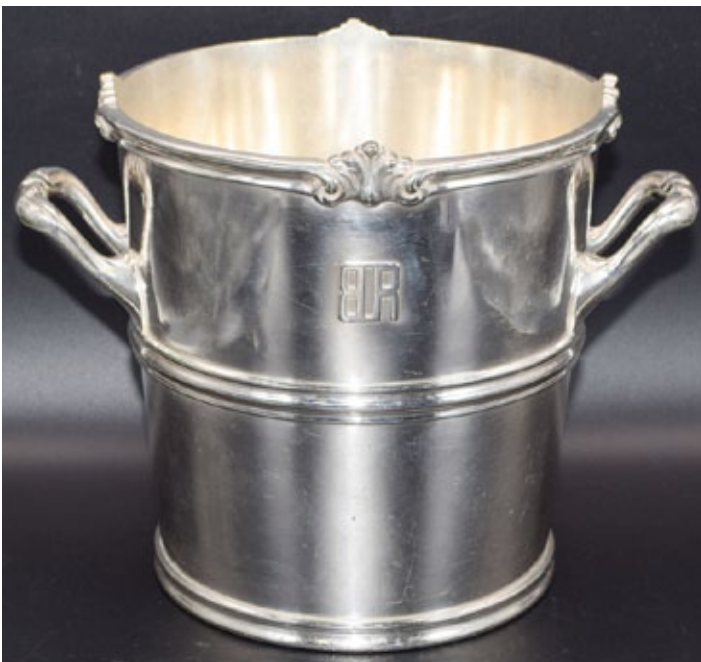
An $1100 bid took home this Burlington Route "BR" logo champagne bucket made by Reed & Barton.