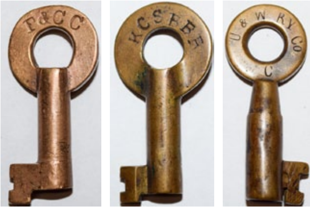
Switch keys: Florence & Cripple Creek ($1150), Kansas City Suburban Belt ($320), Utah & Western ($440).