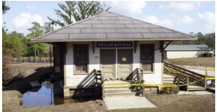
The Pollockville station was still structurally sound after flood waters subsided.

In September of 2018, Hurricane Florence ravaged the east coast, bringing destructive winds and historic flooding to many communities. Pollockville was one of the many towns that were hardest hit, with over eight feet of water completely covering the business district. The station was first battered by the wind, and then submerged up to its eaves.