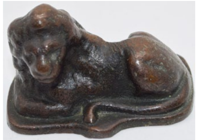
A rare Santa Fe lion paperweight, made for British investors, sold for a high bid of $500.