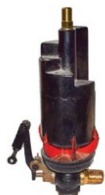
AT&SF 6 chime Whistle