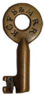
Kansas City Ft Scott & Memphis key