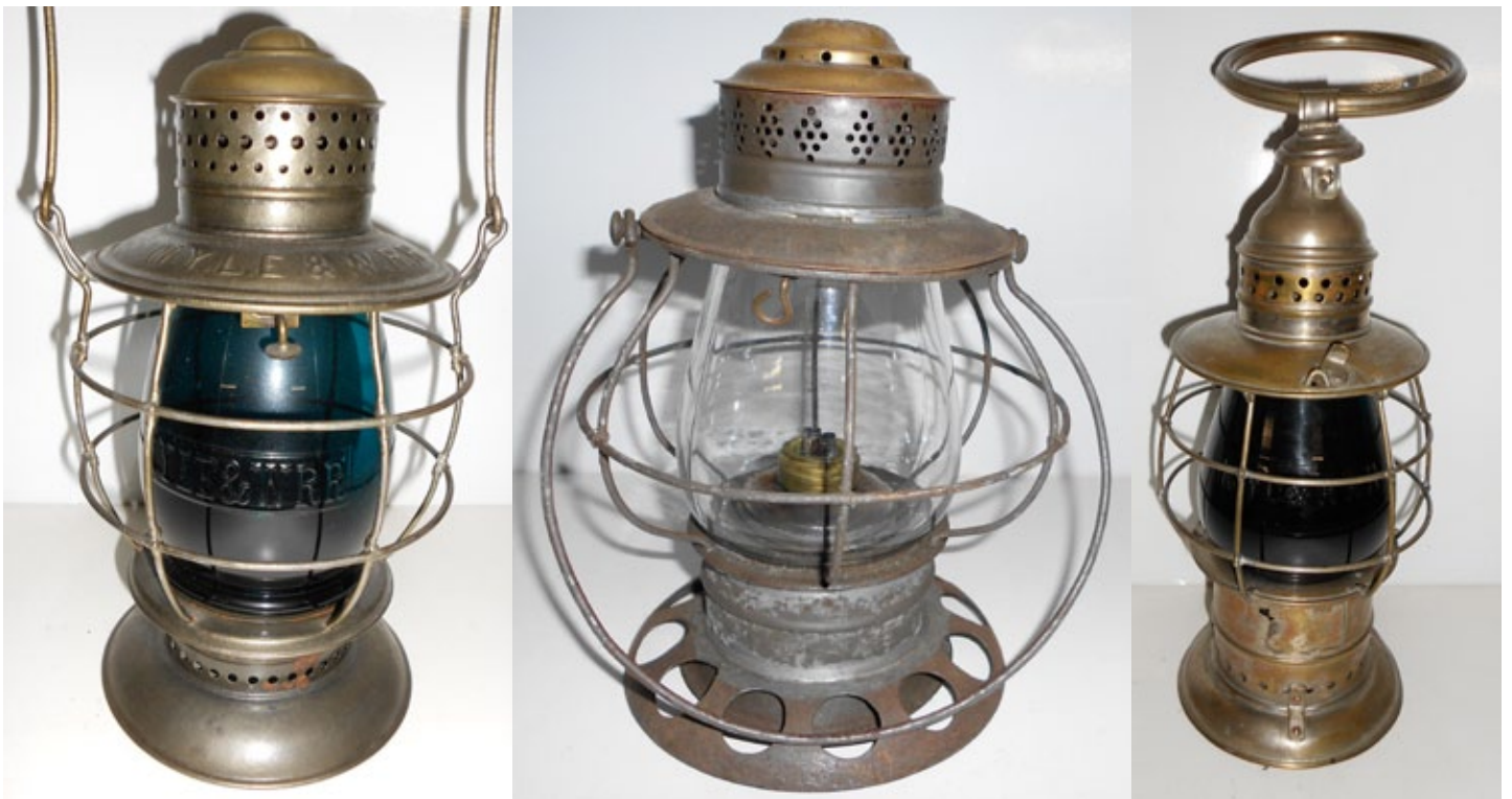
A Steam Gauge & Lantern Co. brass top bellbottom lantern from the New York Lake Erie & Western with a green cast NYLE&W globe ($1900), A Boston Concord & Montreal RR Taylor Aetna model lantern with unmarked globe ($700), William Porter brass fire department lantern with mismatched New York Central & Hudson River green globe ($4100).