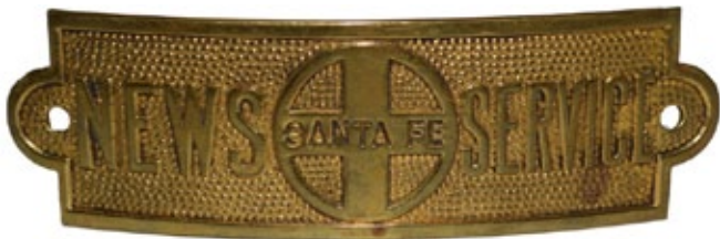
A rare Santa Fe News Service logo cap badge with no manufacturer's hallmark sold for a high bid of $1850.