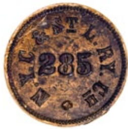
Nice selection of wax sealers