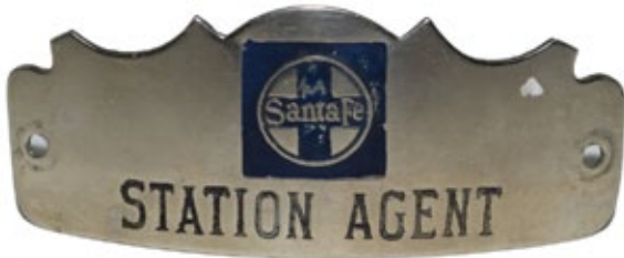
Several bidders had a strong interest in this Santa Fe Station Agent badge, driving the price to $1550.

Railroad Memories is known for the sale of high-quality consignments of railroading, but the stars of the show in recent auctions have been artifacts from several estates and collections. Many lots in the last sale were those “once or twice in a decade” pieces, that only surface when major collections are dispersed, and prices reflected their scarcity. While the general antique market may be depressed, railroad memorabilia collecting seems to still be going strong. All photos, prices, and descriptions courtesy of Railroad Memories Auctions. Prices do not include any applicable buyer’s premium or shipping.