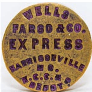
A wax sealer from the Wells Fargo & Company Express, Harrisonville, Missouri depot of the Kansas City, Clinton & Springfield Railroad went to a new owner for a high bid of $1000.