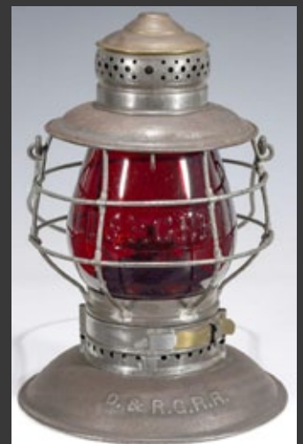
D&RGRR Buck w/ Red Cast Globe - $13,000

In Person, Absentee, Phone & Internet Bidding. Visit www.soulisauctions.com for information about upcoming sales