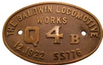
A nice selection of Builders Plates including this B&O, plus D&IR, MP, GN & C&O

Scheduled for May-June 2021! With over 500 lots of quality items from several estates and collections including many rare and desirable keys from the late Doug Schnackenburg's estate. Below are just a few of the highlights