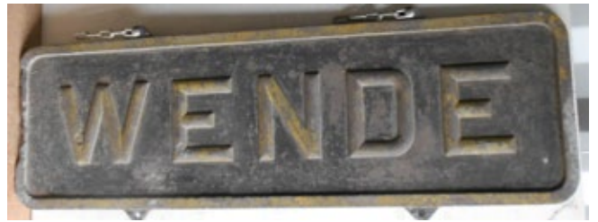
The New York Central Wendé station sign sold for a $1000 high bid. I hear the train a comin, its rolling round the bend, I'm stuck in Wendé Prison, and time keeps draggin on.