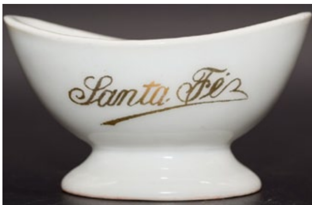
A Santa Fe gold script oval bowl salt well from the Scholl estate sold for a high bid of $2050.