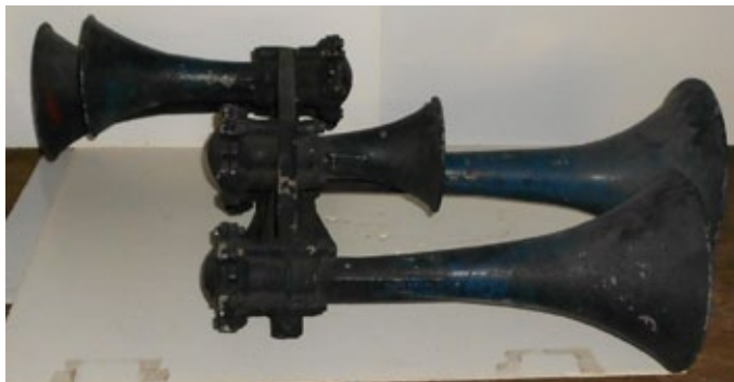
A $3000 bid was needed to buy the Leslie Supertyfon horn from Delaware & Hudson Railway Alco PA #17.