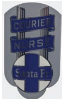
Cap badges including this Santa Fe Courier Nurse