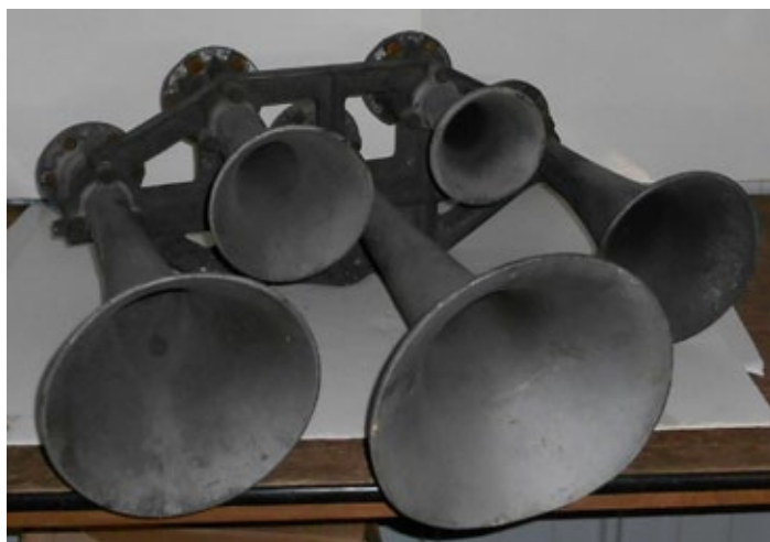
A five-chime Supertyfon horn from a Pennsylvania Railroad EMD E-7 locomotive went to a new home for $1100.