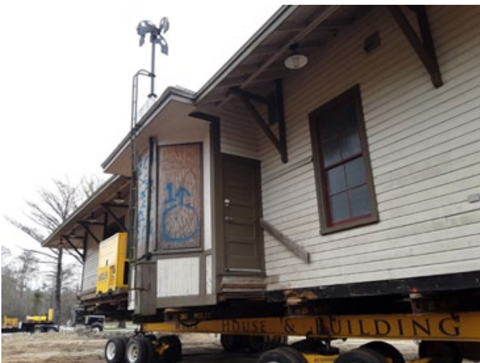
The station is moved to higher ground. Note that the restored order board is gone again.