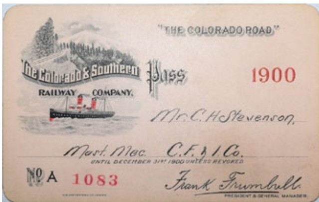
A 1900 Colorado & Southern Railway pass with a steamship vignette sold for a $460 high bid.