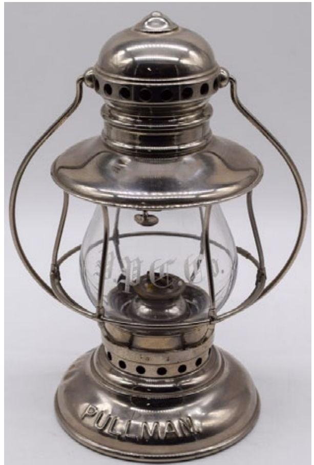
A Pullman A&W conductor's lantern with cut Pullman Palace Car Co. globe sold for a high bid of $500.