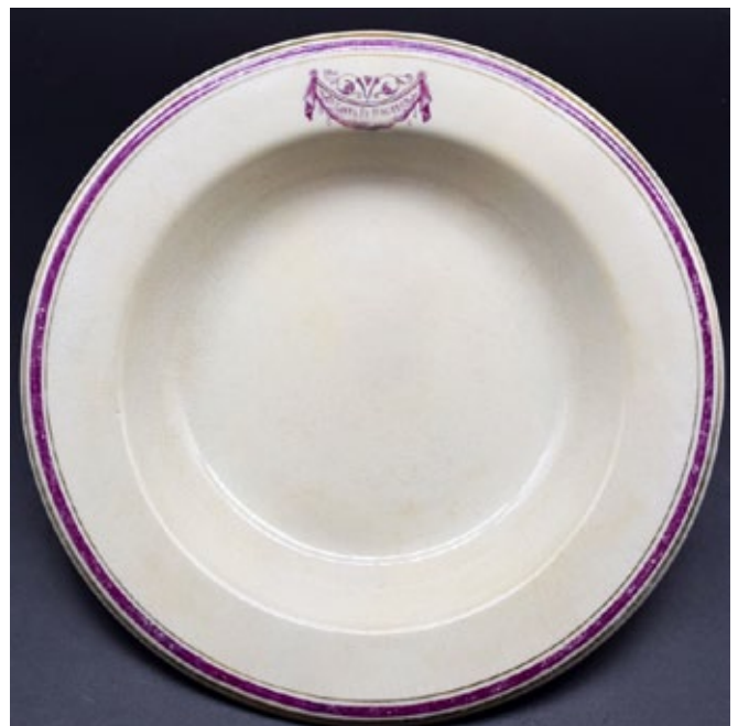
A $1250 bid was needed to buy this rare AT&SF 9 1/2" soup plate by Dunn Bennett's Burslem England.