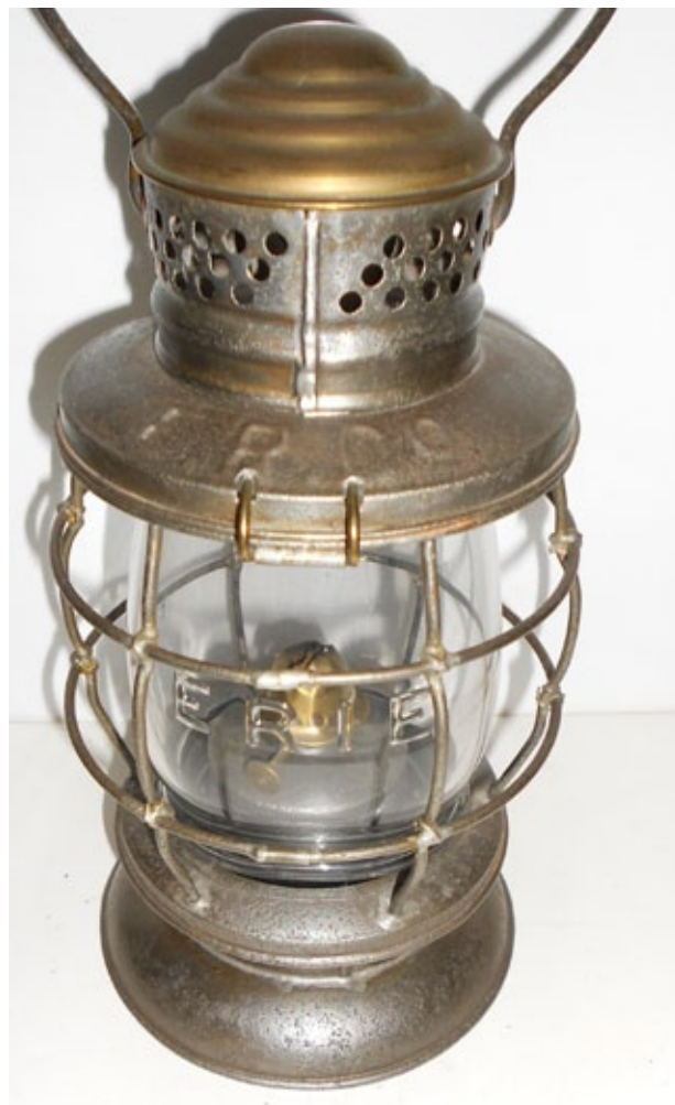
A $4100 bid took home this "ER Co" DD Miller style brass top bellbottom lantern with clear cast Erie barrel globe.