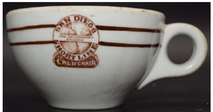
A small crack & specks didn't stop this San Diego & Arizona Carriso cup from bringing a $1250 high bid.