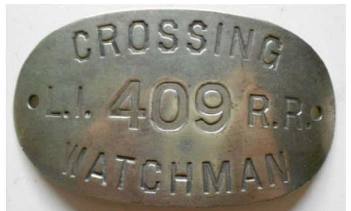
A $220 high bid was needed to purchase this Long Island Rail Road Crossing Watchman #409 badge.