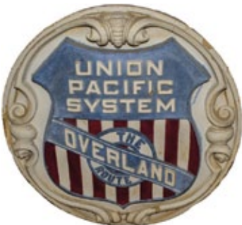
First time offered publicly a rare Terra Cotta emblem salvaged from a Union Pacific building