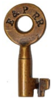
Rare Eureka & Palisades tapered key