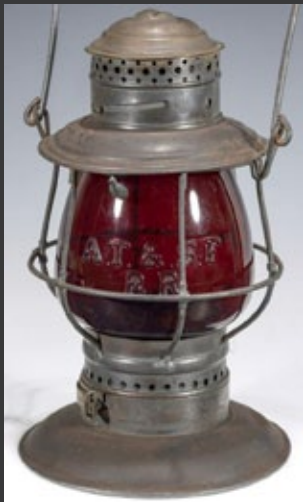
AT&SF A&W w/ Red Cast Globe - $18,000