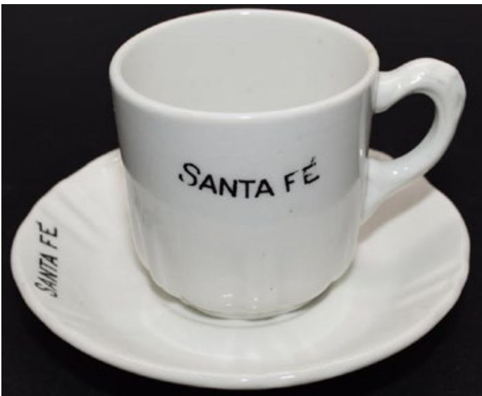
A $2150 high bid took home this Santa Fe Columbian pattern demitasse set stamped Albert Pick, Chicago.