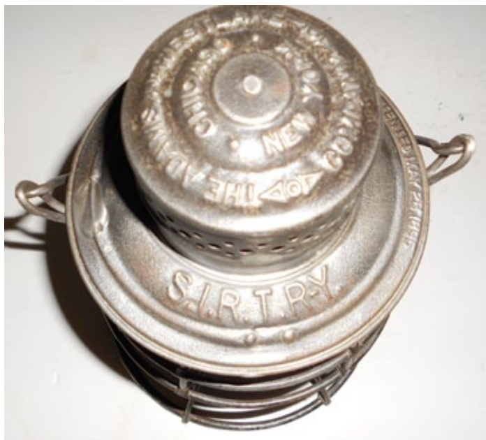
A high bid of $140 took home this Adams & Westlake lantern from the Staten Island Rapid Transit Railway.