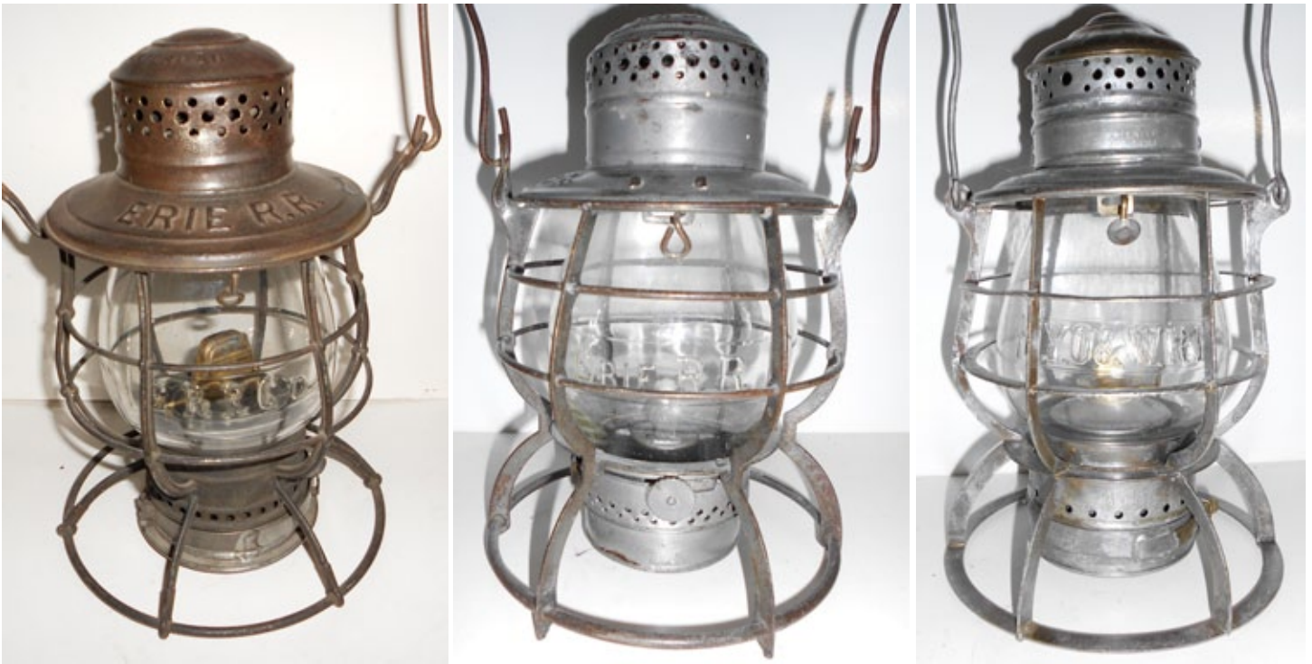
A CT Ham Erie Railroad lantern with a clear strongly cast serif lettering ERRCO globe ($375), a scarce Erie RR Dietz Steelclad lantern with an unusual clear cast Erie RR globe ($1000), a Railroad Signal Lamp & Lantern brass top wire bottom lantern from the New York Ontario & Western Railroad with clear cast NYO&WRR globe ($2600).