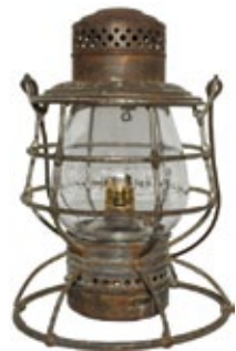
Lanterns including CMRY, D&RG, C&S, DM&N & C&NW to name a few