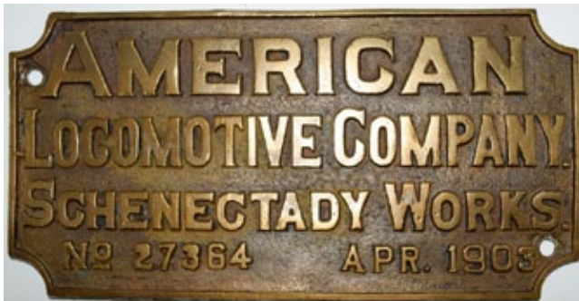
A $1750 bid was needed to buy this Alco builders plate from Northern Pacific 0-6-0 locomotive #1033.