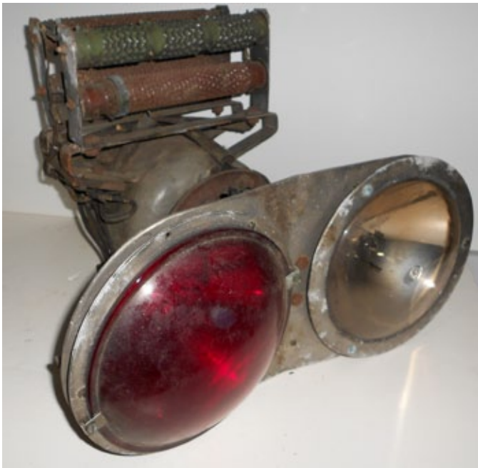
A high bid of $550 was needed to buy the Gyrallight from Delaware & Hudson Railway Alco PA unit #17.