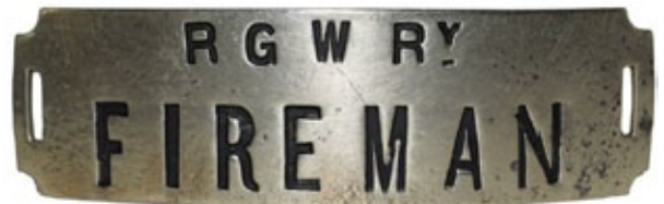
A high bid of $1050 took home this Rio Grande Western Railway Fireman cap badge with some wear.