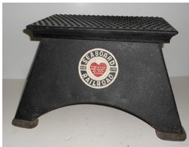
A nicely restored and repainted Seaboard Railroad logo stepbox by Morton sold for a high bid of $300.