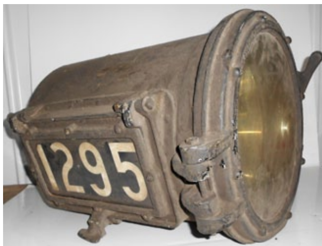
A $1000 high bid was needed to take home this Pyle National Multiple Unit car headlight from the #1295.