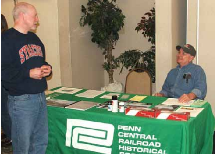
Exhibitors at the NYCS Historical Society show included railroadiana dealers and railroad historical groups.