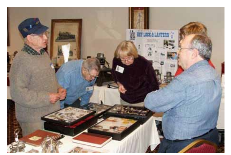
KL&L Convention registrants get a first look at some of the memorabilia during the "early admission" trading session.

The 39th Annual Key, Lock & Lantern Convention was a huge success, with over 70 KL&L members, guests, and other collectors attending the Saturday events. With almost twenty exhibitors, extra tables were added in the convention room to accommodate last minute registrants. A fair amount of trading took place during the "early admission" period