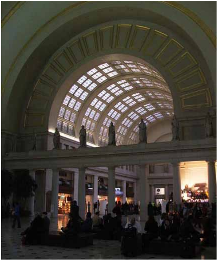
Amtrak's exhibit train is scheduled to visit stations across the country, starting at Washington Union Station.

The tour begins in Washington, DC, as part of the National Train Day celebration on May 7, 2011. On May 14th & 15th, the train will be on display in Lorton, Va, after which it will travel to Baltimore, MD on May 21st & 22nd. Philadelphia is the next stop, on May 28th & 29th, followed by a visit to Perryville, MD on June 4th & 5th.