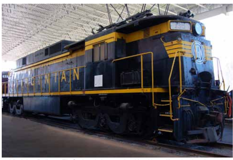
Virginian Railway EL-C electric locomotive No. 135, will make the short trip from the Virginia Museum of Transportation to the O. Winston Link Museum for the Roanoke Rail Days celebration.

For more information on how KL&L can help promote your museum, contact Dave Hamilton at transportsim@aol.com