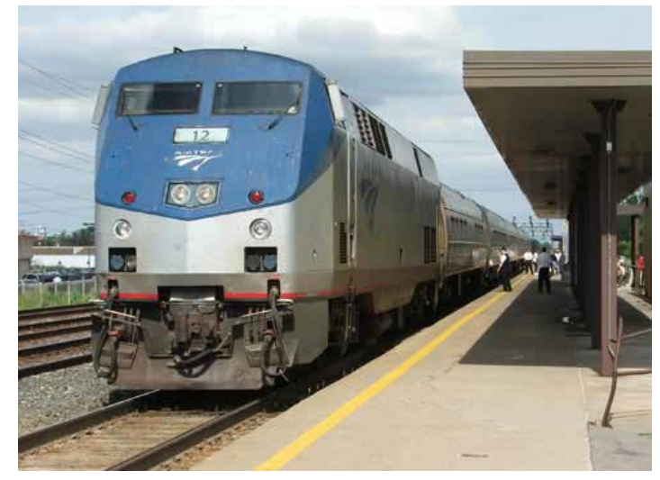
Amtrak is celebrating its 40th anniversary in 2011 with a number of events, including a nationwide exhibit train tour.

The unique exhibit train consists of three modified Heritage Fleet baggage cars, originally used on the Santa Fe, a former Union Pacific sleeper that will house the train's staff, and an Amclub car that has been converted into a gift shop. Pulling the train will be P40 locomotive # 822, with former F40PH