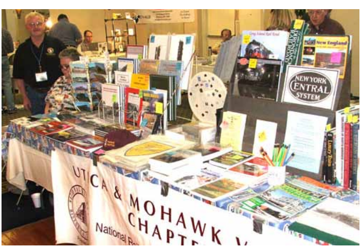
Local railroad historical societies and collectors offered a variety of books and memorabilia from the region.