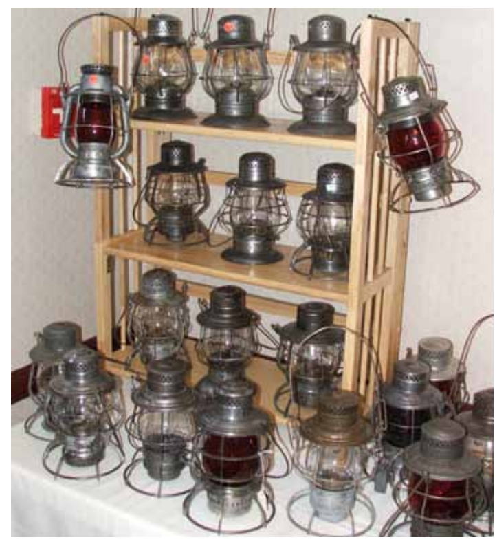
A few of the many lanterns offered for sale or trade at the 39th Annual Key, Lock & Lantern Convention.

The KL&L convention is unique in that many members bring memorabilia for display only, and there were several museum-quality exhibits this year. With numerous excellent displays, the competition for the "Best of Show" award was