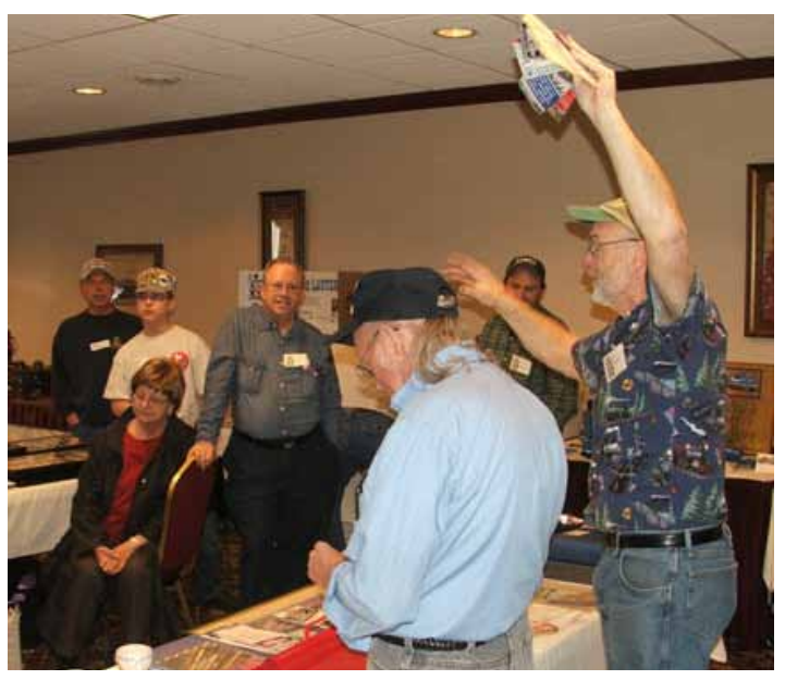
The railroadiana fundraiser auction is a convention tradition, with all proceeds going to support KL&L.