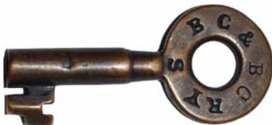
A Battle Creek & Bay City Railway tapered barrel switch key by Romer & Co. went to the high bidder for $556.