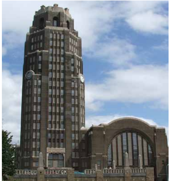
After years of neglect and many false starts, progress is being made in the restoration of Buffalo Central Terminal.

The station's somewhat remote location on the city's edge, although inconvenient for passengers, is probably what saved it from destruction, while other depots fell victim to urban redevelopment projects. Several early attempts to convert the unique building to other uses failed to materialize, although they served to preserve the building for another ten years. However, by the 1990's, the terminal had become a playground for vandals, and looters had stripped anything of