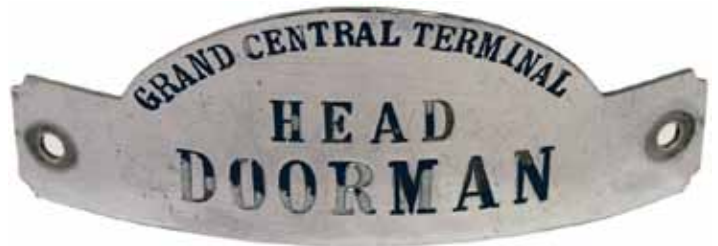
How's this for an unusual occupation? This cap badge, hallmarked for F.G. Clover Co., went for a high bid of $330.