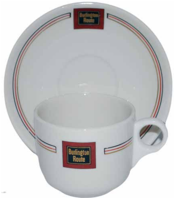
A CB&Q "Aristocrat" pattern cup and saucer by Syracuse China with 1957 & 1965 date codes sold for $600.