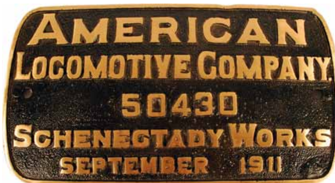
A high bid of $1210 took home this Alco builders plate from Missouri Pacific RR 2-8-2 steam locomotive #1241.