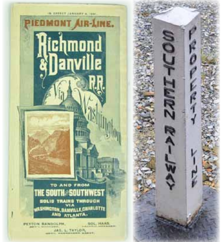
A scarce Richmond & Danville timetable sold for $81, while an unusual Southern Ry property line marker brought $230.