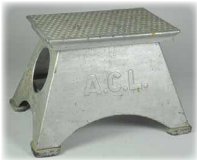
A number of step boxes were sold at the auction, with this one from the Atlantic Coast Line bringing in $201.

Complete auction results & photos are available at www.kfauctions.com .