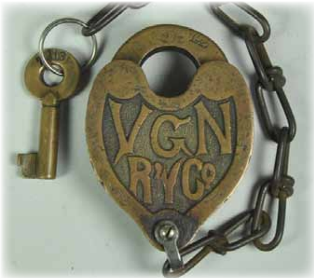
This Virginian Ry brass heart lock & key brought $1150, one of several locks that pushed the $1000 mark.

sets pushed the $1000 mark, with similar examples from the Richmond & Danville and Richmond & Petersburg bringing in over $900. There was also a strong interest in the more common lock & key sets, with most going for $60-150. Brass heart locks from a variety of roads were popular, with many pushing the $300 mark.