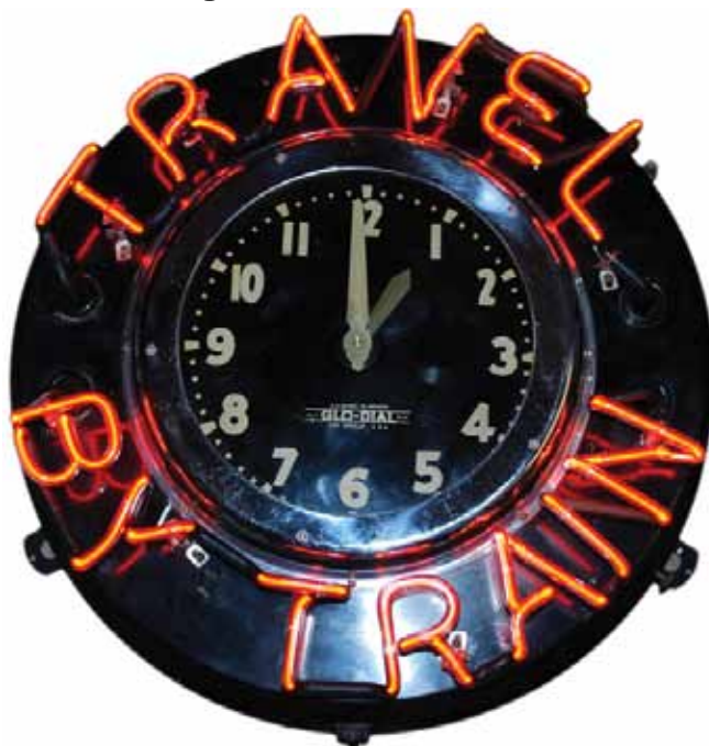
A fully restored and operational Glo-Dial "Travel By Train" twenty-two inch neon sign and clock brought $3850