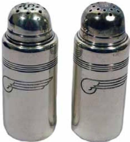
Southern Pacific "Winged Daylight" salt and pepper shakers by International Silver sold for $800.