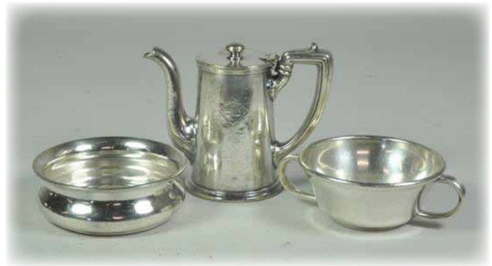
One of several lots of silver hollowware, this set from the Erie Railroad went to the high bidder for $316

Timetable prices fell within the typical range, with scarcer early issues bringing $75-100, and more common examples selling for $10-20. Switch keys bids also reflected the current