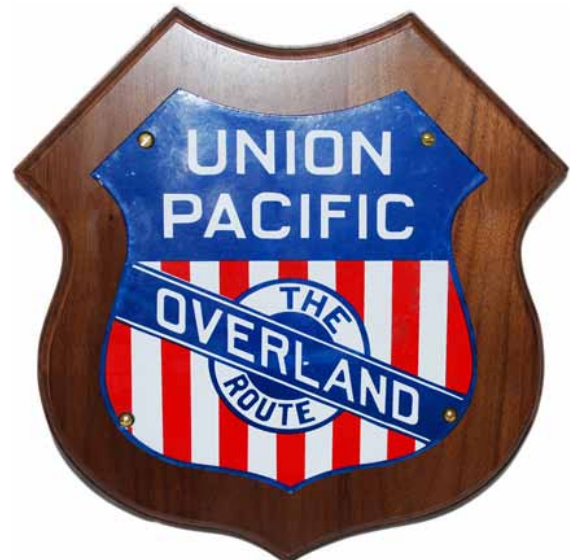
Some paint touch-ups on this scarce Union Pacific enamel baggage cart sign didn't discourage a high bid of $845.