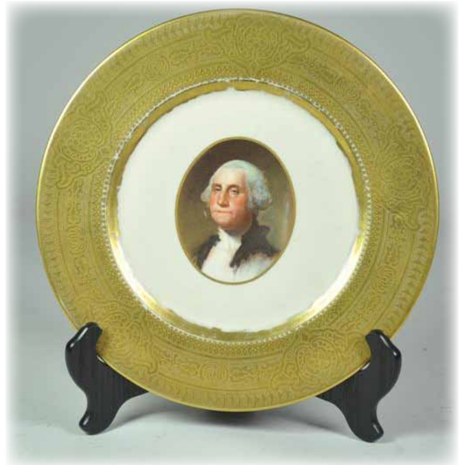
Although many lots brought high prices, there were a few bargains at the sale. This C&O George Washington plate with some wear and minor foot chips sold for only $115.