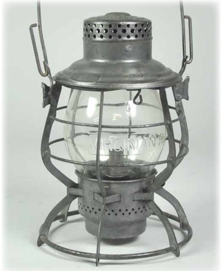
A nicely restored Virginian Railway "Adams" lantern with a clear cast tall globe went to a new owner for $1495.

Memorabilia from the Virginian Ry proved to be popular, with tall globe lanterns selling for between $400 and $700, and short globes bringing $300-400. A Virginian "Adams" lantern with a clear cast globe was one of the higher-priced items at $1495, although a Danville & Western lantern was not far behind at $1265. Both were overshadowed by a Richmond & Danville lantern with a clear etched globe, that sold for $1610. Several Virginian brass heart lock and key