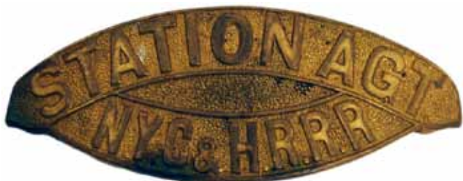
This unusual New York Central & Hudson River Railroad Station Agent badge, with no maker's mark, sold for $430.

Railroad Memories catalog Number 79 included a broad selection of keys, china, lanterns, globes, paper, locks, and advertising material. Despite the relatively weak economy, it