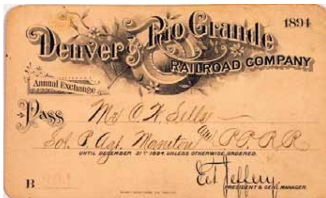
Railroad Memories auctions usually include some scarce items from Colorado lines. This ornate Denver & Rio Grande Railroad 1894 annual pass brought $385.