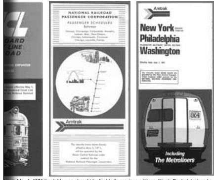
May 1, 1971 timetable was almost identical to its previous editions; Illinois Central designed a new form with the Amtrak logo, and Penn Central added the Amtrak logo to its June 7th Northeast Corridor folder. KL&L Issue #162 Page 4 (3/87)