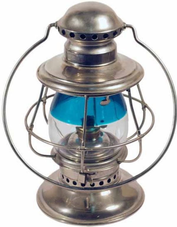
A crack in the green over clear globe and a slightly bent bell bottom allowed someone to take home an otherwise nice example of a Dietz No.3 presentation lantern for $357.