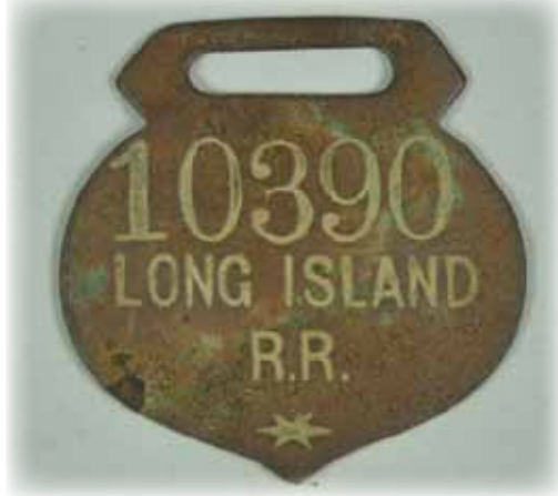
While several baggage tags brought high bids of over $200, this example from the LIRR sold for a reasonable $23.

state of the market, with harder to find roads commanding over $100 and more common lines selling for around $30. A key from the Virginia & Mt. Airy sold for $649, while a bid of $518 was needed to take home a East Tennessee, Virginia & Georgia key.