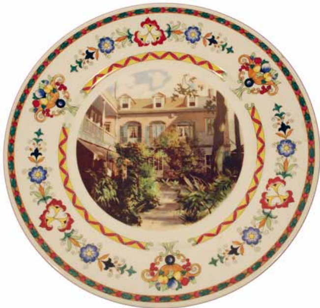
A rare Illinois Central "French Quarter" pattern service plate produced by Bauscher went to the higher bidder for $940.

A complete online catalog with photos and prices realized for this auction (and previous auctions) is available on the Railroad Memories web site at www.railroadmemories.com .