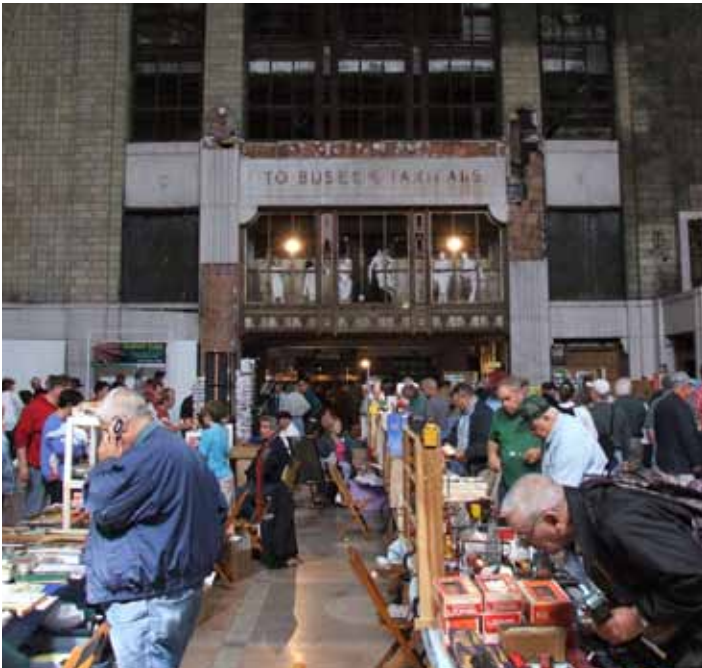
What better place is there for a model train and railroad memorabilia show than an old passenger terminal?

One event that has been held since 2006 is the annual train show. With dealers of models, toy trains, and railroadians filling the huge main concourse, this event provides an excellent reason to visit Buffalo Central Terminal and see