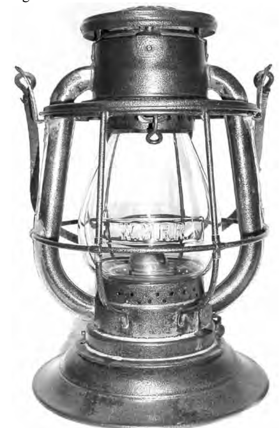
Western Maryland RR Vesta with the enclosed top and original style bell bottom.

During 1906, he drew up the plans for another version of the Vesta, which included additional refinements to the smoke dome, and a change from a bell bottom to a wire base. Introduced in the 1907 catalog as the "new Vesta," this lantern would become one of the most successful railroad lanterns ever produced by Dietz. In the next installment, we'll take a closer look at the further development of this interesting lantern.