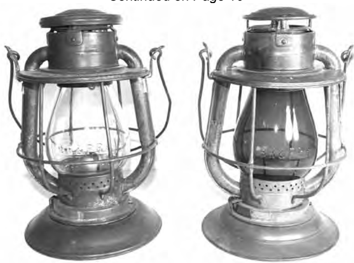
The newer (left) and older (right) variations of the "new" bell bottom Dietz Vesta.