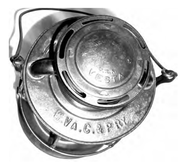
During mid-1905, the smoke dome was altered, and the familiar Vesta style lettering was added. West Virginia Central & Pittsburgh Ry.

While some customers were still hesitant to purchase a lantern that burned only kerosene and required a special globe, the new Vesta proved to be more popular than its predecessor. Railroaders soon discovered that kerosene