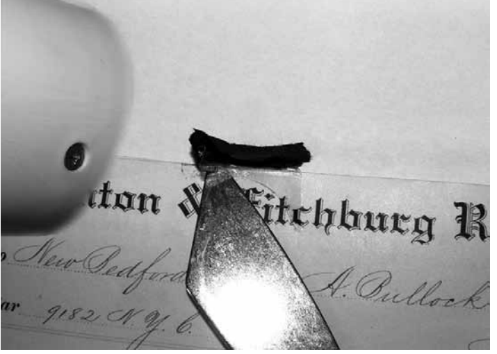
The tape's backing is removed by heating it with a hair dryer and slowly lifting it off with an artist's spatula.