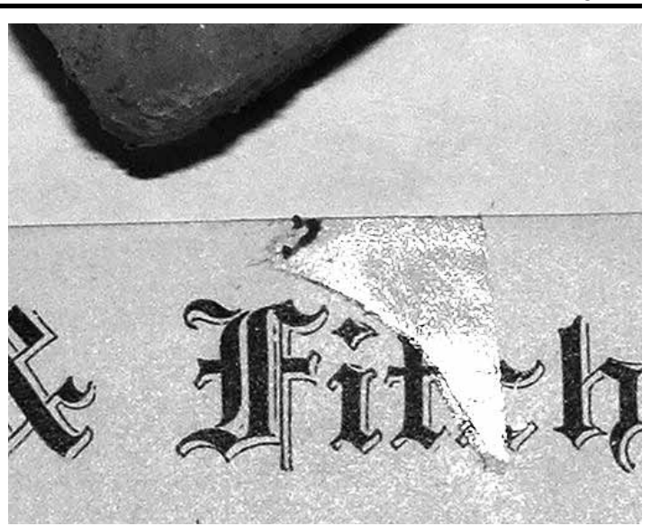
The eraser is lightly rubbed in a circular motion until small clumps of adhesive begin to form and stick to it.

At this point, there may still be a light stain on the paper, caused by acids or oils in the adhesive. Unfortunately, there isn't much that can be done to clean it, even with more extensive conservation treatments. If the tape was applied