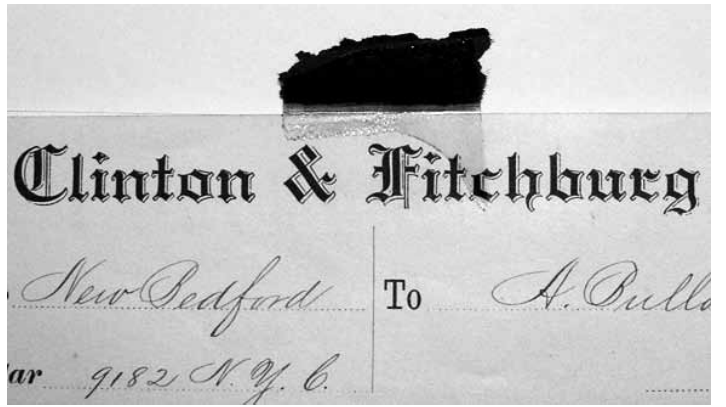
Books and ephemera are often repaired or mounted with tape, causing damage over the long term.

Tape is actually just an adhesive held in place by some type of backing material. While on the surface it appears to be a good product for use in paper repair, even acid free tape will damage paper over the long term. Most of the adhesives