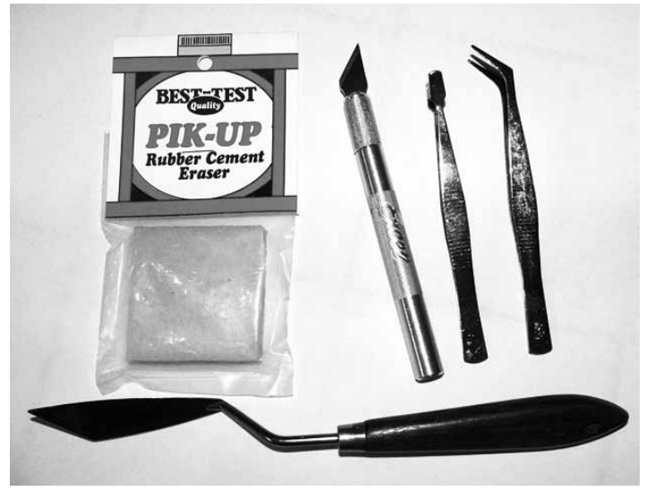
Tools for tape removal are readily available at art supply and craft stores: rubber cement "eraser," hobby knife, artist's paint application spatula, and tweezers.

While conservators use specialized equipment for this type of job, we can get by with a more simple technique that doesn't require a big investment in hardware. The tools required for our tape removal method are readily available at any good art supply store and around the house. Items needed include: a hair dryer, a thin edged artist's spatula, flat tweezers, a hobby knife, and a rubber cement clean-up