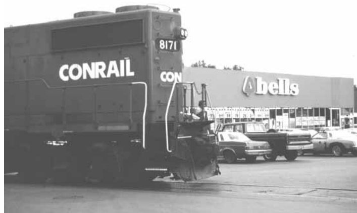
Conrail switcher WAOL-2 passes the entrance to the Bells supermarket in East Aurora, NY, enroute to pick up a car from the Griggs & Ball feed mill, in the early 1980's.

the reason, he invited me up into the cab of the engine, where I spent the first of what would be many afternoons riding around town while the train served the various industries.