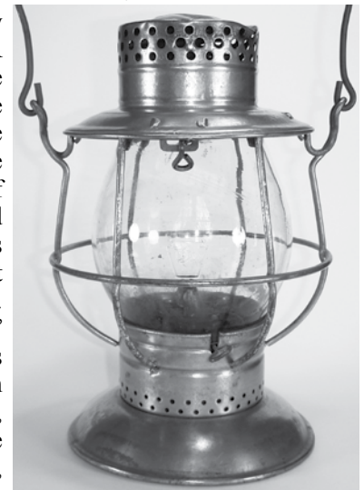
Unmarked Dietz No.39 with PRR globe, used on the Pig Tail Line.

I had to dig out my box of Pennsylvania RR memorabilia just to double check, but sure enough, the derailment pictured in the photo was the same one that had been the subject of the discipline letter. It had taken 25 years, but I was able to put three different pieces of history together. Although my "collection" isn't quite as exciting as a set of bellbottoms with different colored globes, it was almost as enjoyable to assemble it. To me, collecting has always been