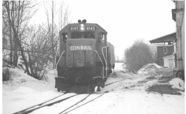
The crew of Conrail train WAOL-2 carefully descends from the mainline to spot a car at the former E.E. Godfrey feed mill in East Aurora, NY on a snowy day in the early 1980's.

That all changed one day when I was watching the Conrail switcher deliver a car to one of the local feed mills. Perhaps the engineer was intrigued by the fact that there was a kid out there who would rather watch trains than visit the nearby video game arcade, or maybe he just felt like talking to someone. Whatever