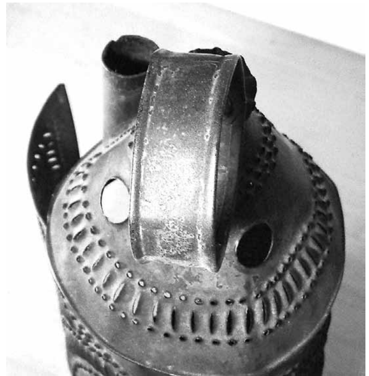
A close-up view of the lantern shown on the previous page reveals details of a pre-machine era manufacturing style that assists in dating the lantern to the late 1700's period.

Production of sheet iron to be used for tinplate was limited in pre-Revolutionary America. While the colonies were major exporters of pig iron, the means to create sheet iron were limited. The British "Iron Act" of 1750 attempted to prevent colonies from making finished goods by restricting the construction of triphammers and rolling mills, thus protecting the British trades. The Colonists did their best to evade this and other trade laws and often were vague in reporting, so knowing if a pre-Revolutionary lantern was made here or abroad is hard