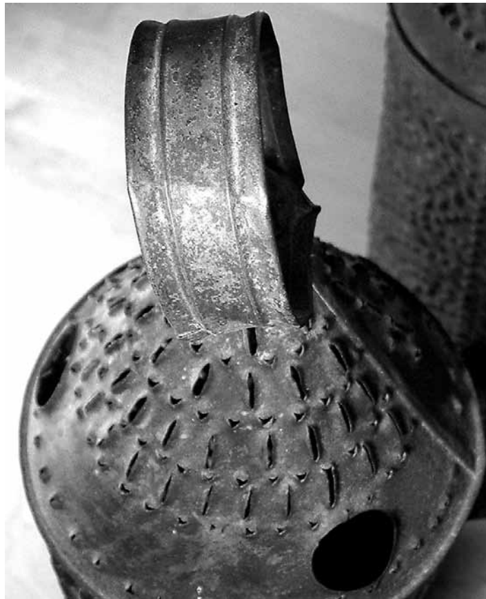
The handle loop on another lantern shows a crisp and uniform second impression, possibly indicating machine turning that came into use in the 19th century.

to determine. It is clear, however, that there were tinsmiths working in the colonies well before the Revolution, with imported sheets of tinplate.