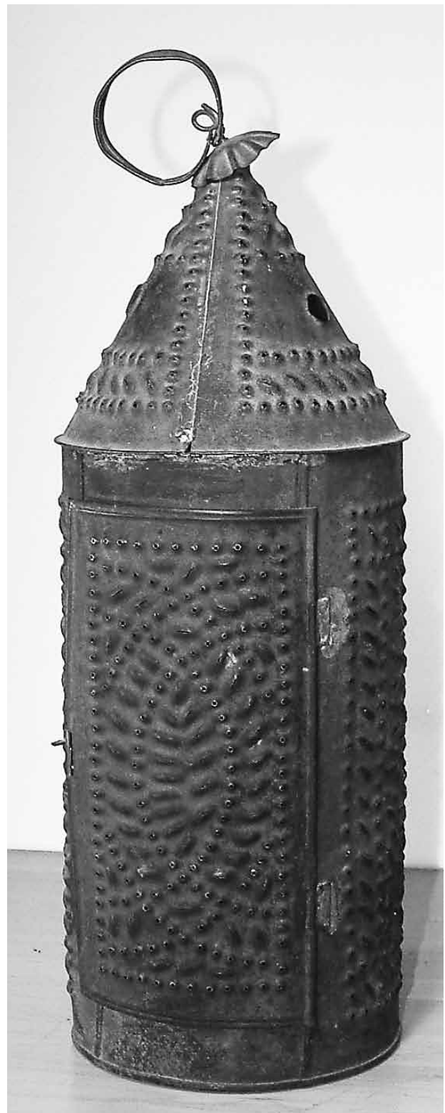
An example of a 19th century punched tin stable lantern, which exhibits uniformity of construction that is consistent with machinery use that was introduced in the 1810's.

Mayhew, Henry. London Labour and The Poor . London: Griffin Bohn & Company, 1861.