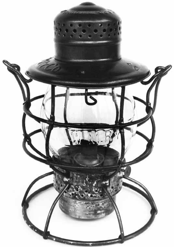
In his book, Lanterns of the Western Maryland , Mike Yetter notes that Fairbanks, Morse & Co. included the buyer's choice of an oxweld or kerosene lantern with the purchase of their motor cars. Lanterns were available in either bell bottom or wire bottom models, with this example marked "WMRYCo" for the Western Maryland.

Telephones for train dispatching are used almost exclusively and signalmen take their orders direct from the dispatchers, except at offices where operators are on duty. In addition to the telephones at stations and block offices, telephones are located at each end of passing sidings, in watchmen's boxes, and at other convenient places along the line, and also in signal