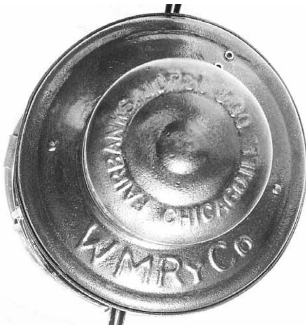
"Fairbanks, Morse & Co. Chicago, ILL" markings are stamped on the top of the lantern pictured at right, but the lettering style reveals that the manufacturer was the Star Headlight Co. of Rochester, NY.

maintainer's tool houses, where located some distance from offices, so the signal maintainers can get their orders before leaving headquarters, and for reporting in to the dispatcher when their run is completed.