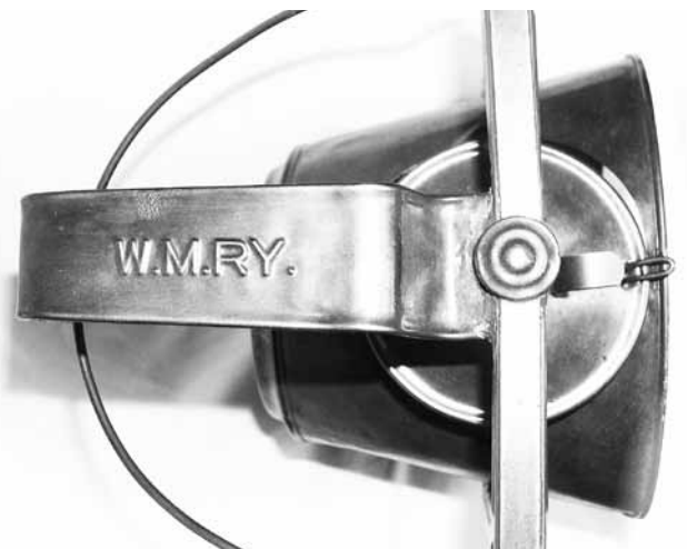
A view of the "WMRY" marking on a Dietz inspector's lamp which could have doubled as a motor car headlight on the Western Maryland Railway.